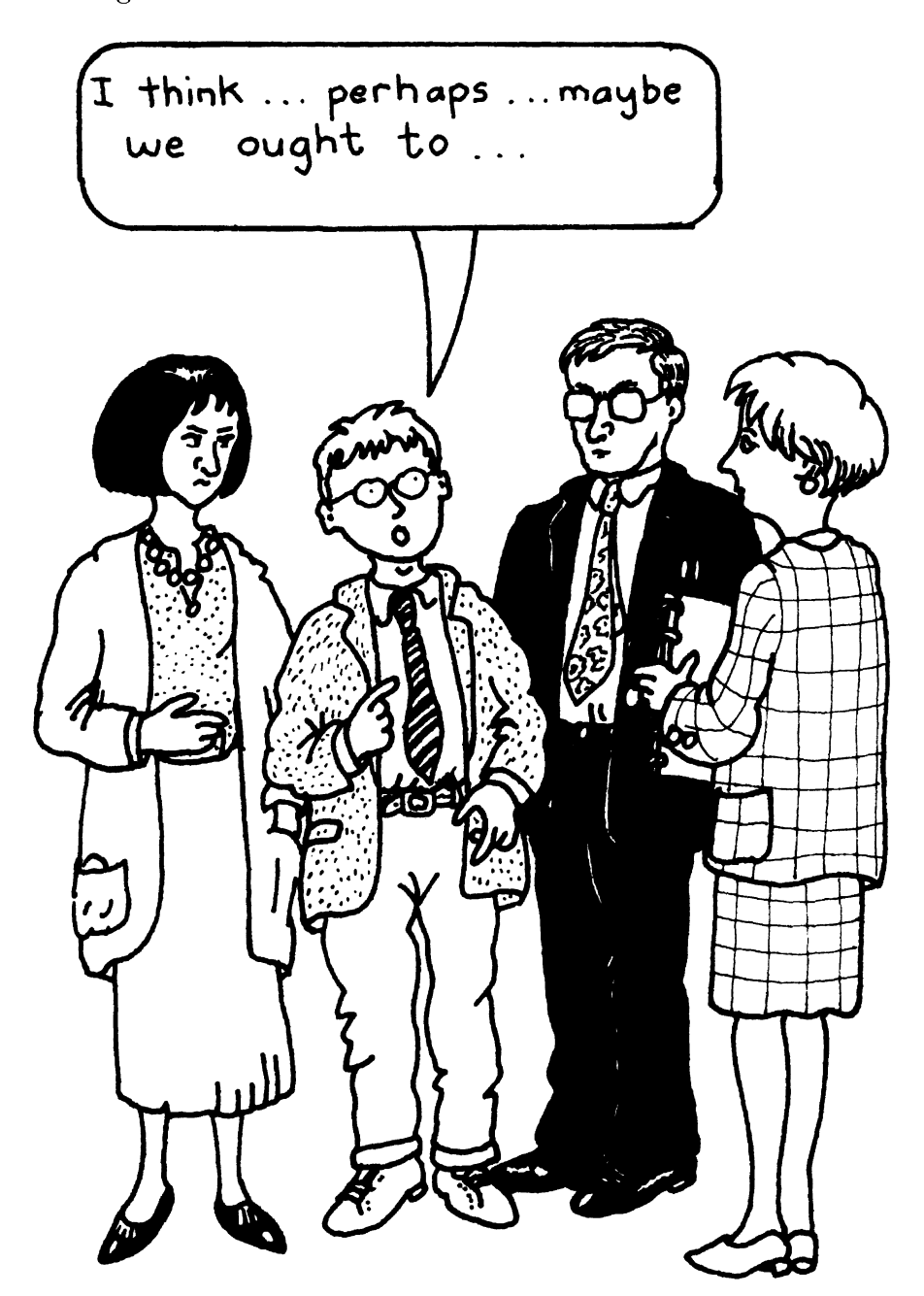
Figure 5.1: Everybody has got to have a voice