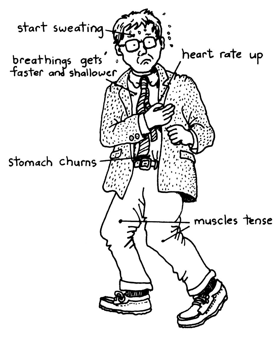
Figure 1.2: The fight or flight response to stress