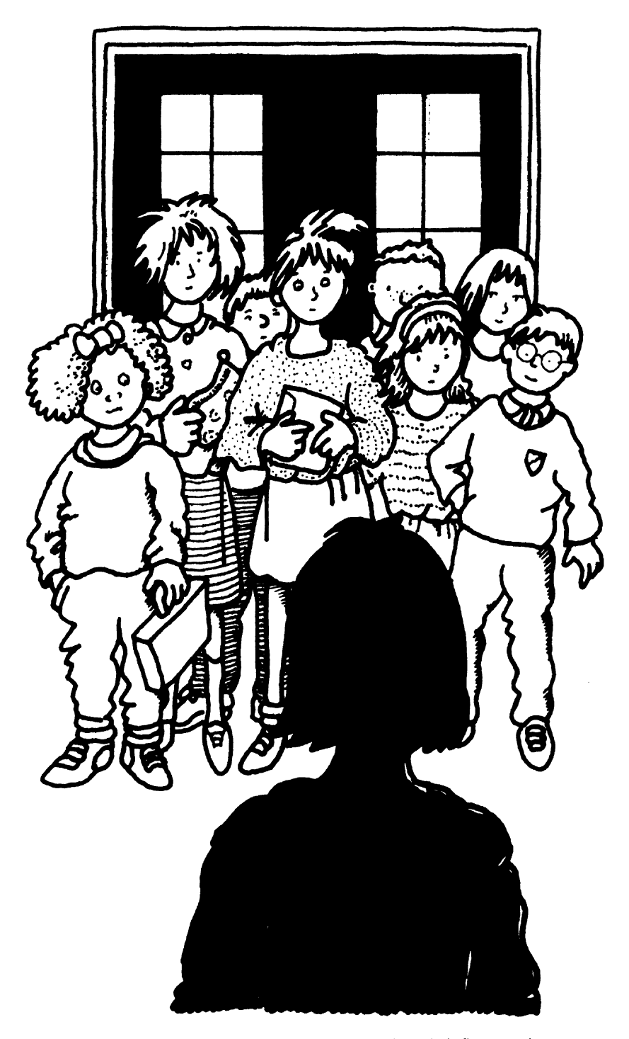
Figure 2.1: Try to picture the children arriving at school on their first morning