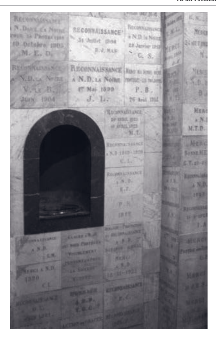
Modern equivalent of medieval votive gifts. Notre Dame la Noire, Toulouse.

Nature is mentioned rather frequently in miracle story collections, especially in stories about storms and shipwrecks that were avoided thanks to the intercession of saints. A stereotypical example is the testimony of several sailors in the canonisation process of Thomas de Cantilupe. Their ship had barely parted from the harbour, when it was attacked by a violent storm, which kept them in its grip for several days. By that time, the men were already 'despairing for their lives'. Since there was no priest aboard, they confessed to each other and prepared to die. At the moment of despair all the hands prayed unanimously to God and Saint Thomas, and vowed to make a pilgrimage to his shrine if they were saved. Then they said the Pater noster and Ave Maria aloud many times. Needless to say, by the evening the