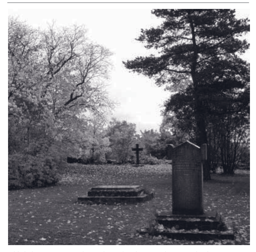
Old cholera cemetery in the outskirts of Turku in South-West Finland is a testimony of for the univeral nature of the 1830–32 cholera epidemic.

The success was, however, not as total as it would have been few centuries before. Parts of the population were not impressed with the doctrine of an interventionist God. The Unitarians dismissed the national fasting and prayer day as 'the tribute of political expediency to sectarian cant'. The opinion of the scientists was that even though God undeniably existed and had created the world, it was functioning according to the natural laws provided by this creation. Thus the epidemic was not directly caused or manipulated by God. Even though science did not accept the idea of an interventionist God, it was still another generation before Darwin and Huxley brought science and religion into direct conflict. There were yet others who did not want to accept religion as any kind of explanation for the epidemic. The working-class radical papers were very hostile towards ecclesiastical ways of disaster management. They took all the liberties to ridicule fasts and prayers and claimed that God was nothing more than a ruling class agent and hence to be ignored.<sup>427</sup>