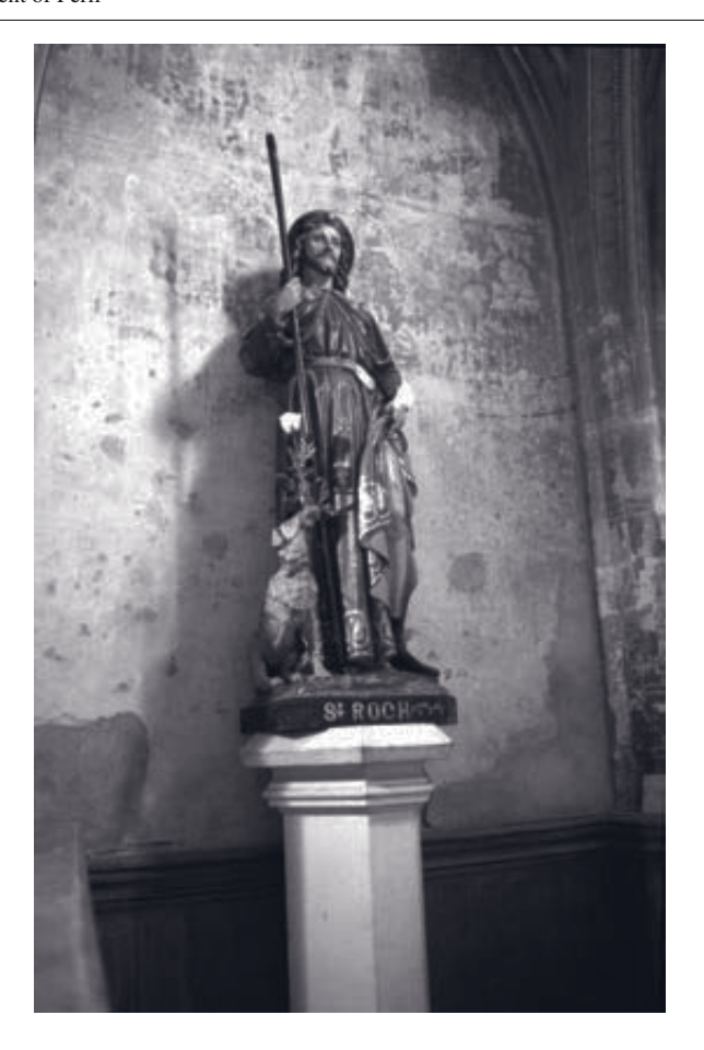
Saint Roch, the primus inter pares of plague saints. Even the iconographic presentation underlines the saint Roch's function as a protector against bubonic plague. The saint is shown in the form of a pilgrim filled with bubos. Etienne, Toulouse.

and was reiterated in masses for saint Sebastian as an argument for his capacity to avert the plague.<sup>201</sup>