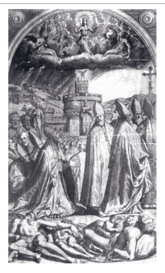
Gregory the Great's procession during the plague of 589.

healing, love, and fertility of different sorts. The rites that are particularly interesting for us here are those performed at the Calends of January to secure good harvest for the coming year.<sup>53</sup> The pagan rites and celebrations, which were meant to secure good harvest, had assimilated with the Christian practises.