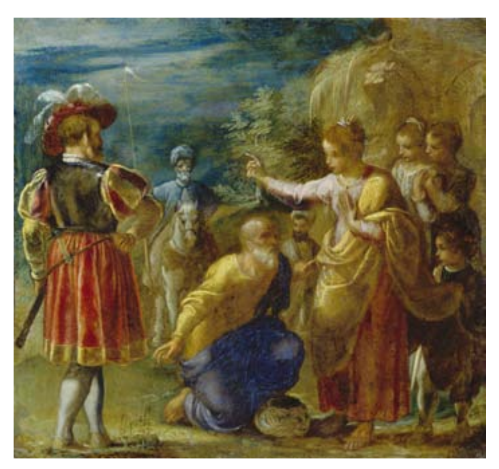
Figure 10: Adam Elsheimer, St Helena Questions the Jew , c.1603–05, Stadelsches Kunstinstitut (Stadel Museum), Frankfurt.