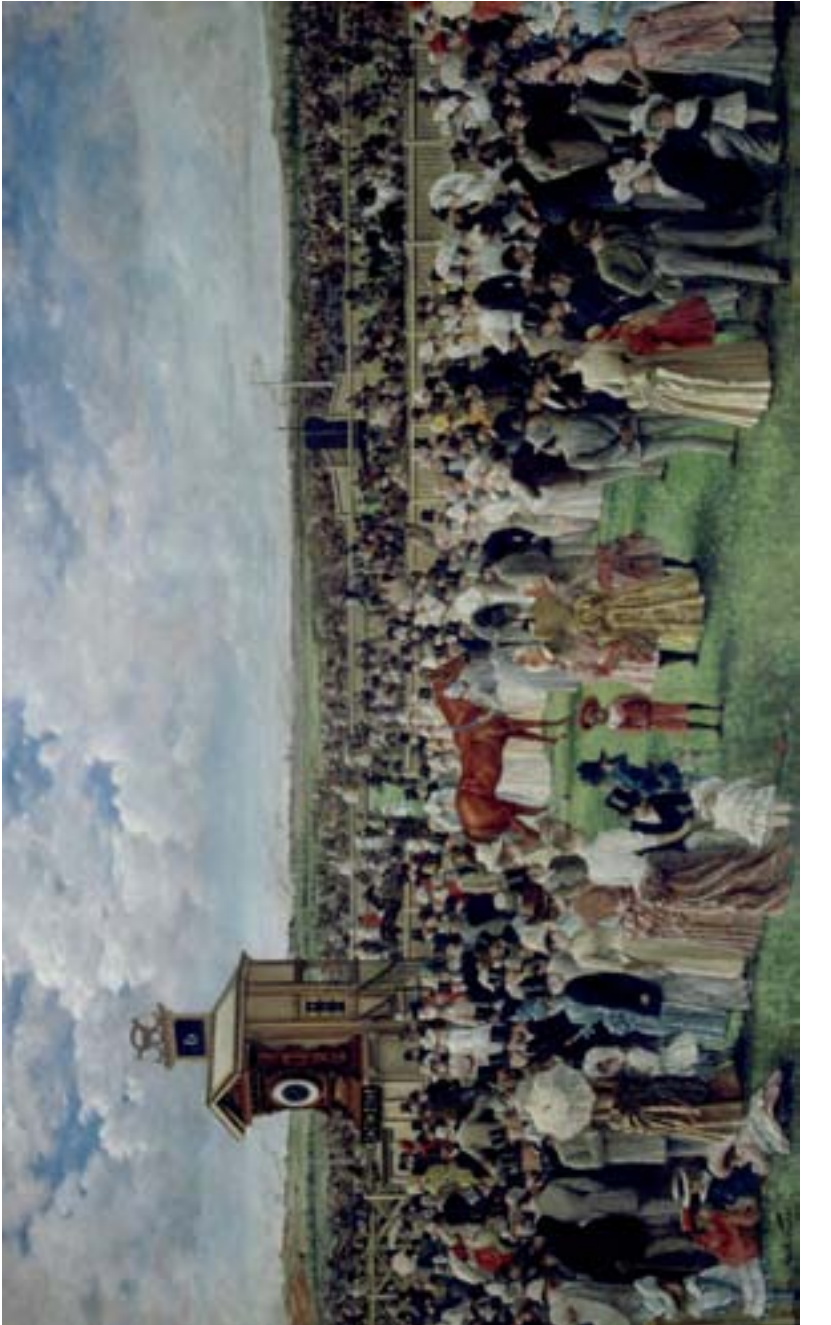
Figure 5: Carl Kahler , The Derby Day at Flemington, 1886, oil on canvas, 300 x 200 cm, Victoria Racing Club Collection.