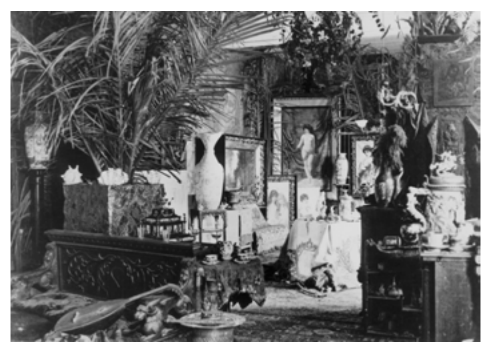
Figure 6: Artist Carl Kahler's studio, interior, Melbourne, (west end), c.1890, gelatin silver photograph, 20 x 25 cm, State Library of Victoria.

The first nine lots in this second auction catalogue are pastels, with twenty oil paintings and the two photographs of the studio following. This is interesting in itself, as today the oils would be presented first and the 'lesser' works reserved for the back of the catalogue. The catalogue is very elegantly presented and displays some of the current auction and commercial gallery catalogue traits, in that it 'talks' or 'puffs' up the works and includes references which would increase the value, mentioning the technical skill of the artist and including poetic references. For example, Lot 10, an oil painting, The Munich Burgher's Daughter , is described as 'A girl in the costume of the last century, with a bird perched on her shoulder. The costume consists of a grey satin robe, with a gold-embroidered bodice; her cap also embroidered in gold. A most graceful and expressive work. The whole of the textures wrought out with conscientious fidelity.