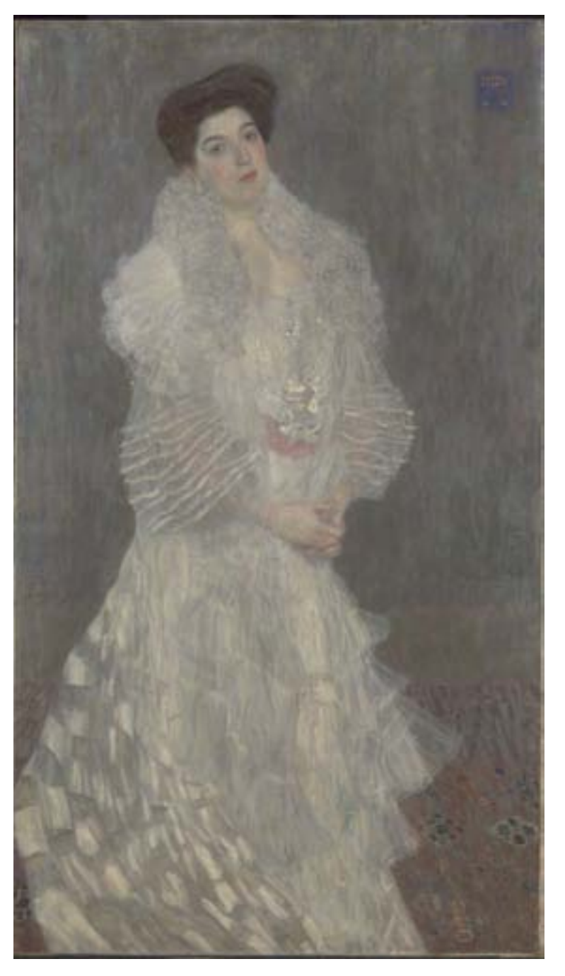
Figure 9: Gustav Klimt, Portrait of Hermine Gallia , 1904, oil on canvas, 170.5 x 96.5 cm, ^{\odot} The National Gallery, London (on loan to the Tate Modern, London).