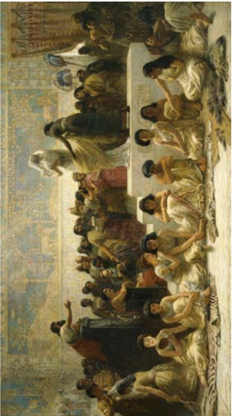
Figure 2: Edwin Long, The Babylonian Marriage Market, 1875, oil on canvas, 172.6 x 304.6 cm, From the Picture Collection, Royal Holloway, University of London. For a review of the Victorian Collection please visit www.rhul.ac.uk/picture-gallery/index.html.