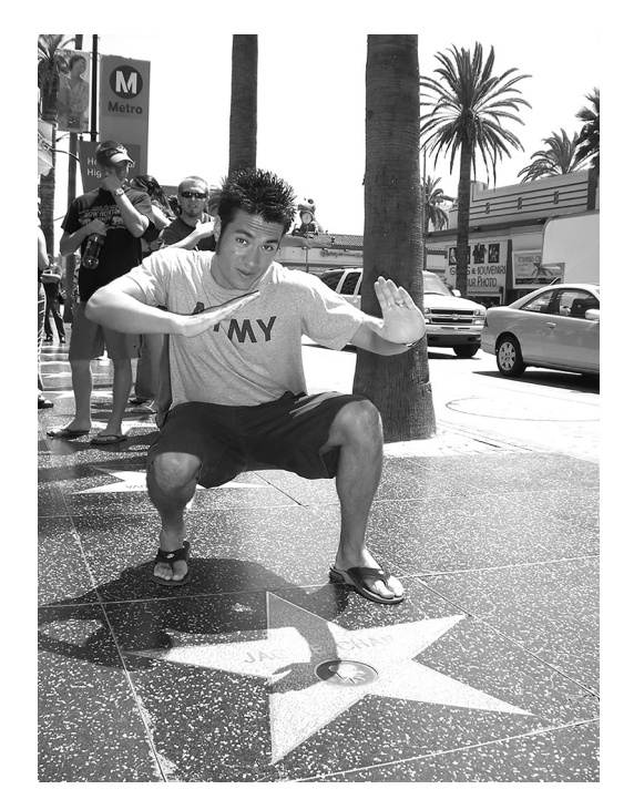
Figure 2.1 'Jackie Chan's Star' - the title of a tourist's photograph posted on Flickr

the photographs are either the fan-based activities or goodwill activities that are most relevant to the discussion of Chan's shifting status and value that attends his ethically Chinese-yet-transnational star phenomenon. They include an album posted by tourists who visited Hollywood's Walk of Fame, one posted by an Australian fan of Chan 'Adelaide Flashmob: Quest for Jackie Chan', and the other two posted by the event official photographers – 'Jackie Chan & Friends Free Concert' and 'Jackie Chan in Myanmar, July 2012.' This chapter will show that Chan's stardom on Flickr renders itself into an entity that negotiates the boundaries between star and celebrity, onscreen martial arts image and offscreen goodwill image, and Chineseness and globalness.