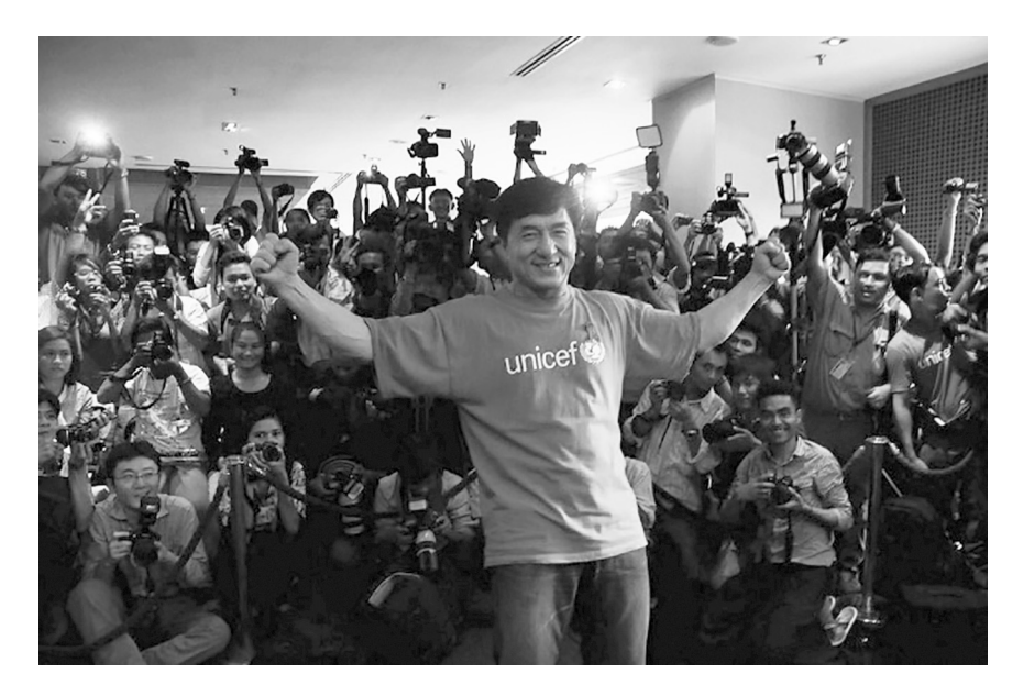
Figure 2.4 As a UNICEF ambassador, Jackie Chan displays his paternal power in front of the press in Myanmar

generation in Myanmar. His rhetoric sounds profound yet fanatical and it articulates the star profile carrying 'the possible connotations of depth, intelligence, and commitment to his or her public persona' (Marshall 1997: 110).