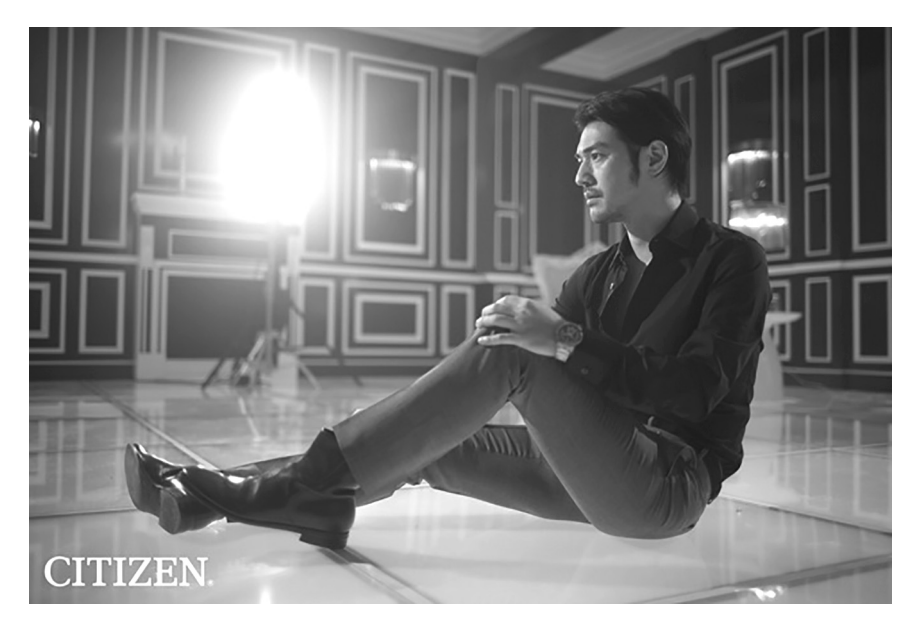
Figure 5.1 Takeshi Kaneshiro as the subject of celebrity endorsement of CITIZEN in 2012

and symbolic associations that inform and complicate the meanings attributed to transnational stars of Chinese or semi-Chinese heredity.