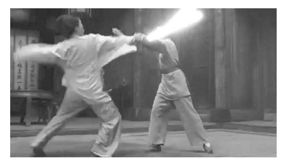
Figure I.1 Two female warriors in Crouching Tiger, Hidden Dragon fighting with 'Star Wars' lightsabers

Gibson's notion of cyberspace calls for consciousness with respect to the geographic movement of information, which is often invisible. As a global and dynamic domain synonymous to 'network', cyberspace offers a new medium for communication, akin to 'an immense heterogeneous virtual metaworld' (Lévy 2001: 25) undergoing relentless makeover and evolution.