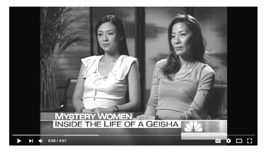
Figure 4.1 'Ziyi Zhang and Michelle Yeoh talk about Memoirs of a Geisha on NBC's Today show'