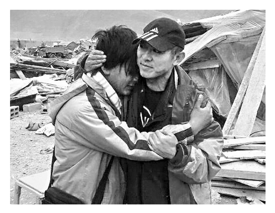
Figure 3.1 A Facebook picture shows Jet Li lending a shoulder to a weeping victim during the relief work of the Yushu earthquake

to the network. Such activity fosters feedback from users and builds trust between Li and his fans. On the '李连杰Jet Li' Page, an album consisting of thirty-four photographs of this trip details the celebrity's spontaneous charity work amid the devastated ruins of buildings and livelihoods. In the photographs, Li consoles victims, converses with the local government officials, and supplies food and water. One photograph, which is selected by the uploader as the cover image of this album, as allowed by the Facebook setup, shows Li hugging a heartbroken and desperate male victim, signifying a generous compassion and brotherly love that transcends class boundaries (Figure 3.1). This photo collected 10,653 likes, 2,435 comments, and 104 shares by 24 June 2014, while other photographs in the album attracted numerous 'likes', ranging from several dozen to several hundred. 'Likes' and comments are the visible markers of attention (Ellison, et al., 2014: 858), also signalling the strength of the fan-celebrity relationship. As Ellison and her colleagues argue, a Facebook status update without 'likes' or comments reveals a lack of interest from one's network, or the update goes largely ignored, and thus