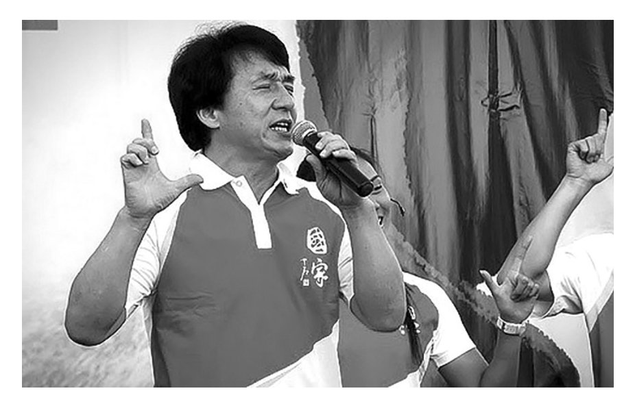
Figure 2.3 'Jackie Chan feeling the love of his country'

global market. The nationalistic essence of the stars displays complicity to capitalism, legitimising an incorporation of Chinese stardom into globalising processes. In such a context of global economy, on the one hand, transnational Chinese stars capitalise on their ethnic personae in order to capture the world's market. On the other, the Chinese star images are configured by the capitalistic logic of which the marketised and commodifying tendency of Chinese stardom provides a viable and appealing option for the cultural imaginary of Chineseness. Therefore, in the Flickr album I examine, if Chan has embodied anything about Chinese nationalism, such embodiment is reified into a commodity (Chu 2008: 190), an image that can be marketed and sold in the celebrity machinery of the global order. Chan's ostensibly nationalistic Flickr images are used by the star's personnel to secure his global star status and marketability in the global cyber-cultural politics.