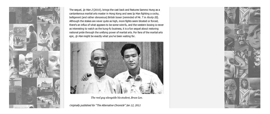
Figure 1.3 The blogger poaches and posts an archival picture of Bruce Lee and the Wing Chun master Ip Man

blogosphere, Yen fans copy and share documented texts of real-life figures, formulating a new archival and discursive space that permits users to revisit and recirculate the history at any time. In this way, historical narrative intertwines with fictional personalities. This kind of composite presentation insinuates that the persona construction oscillates between documentary and fictive modes, occupying the middle ground of the real and the fabricated.