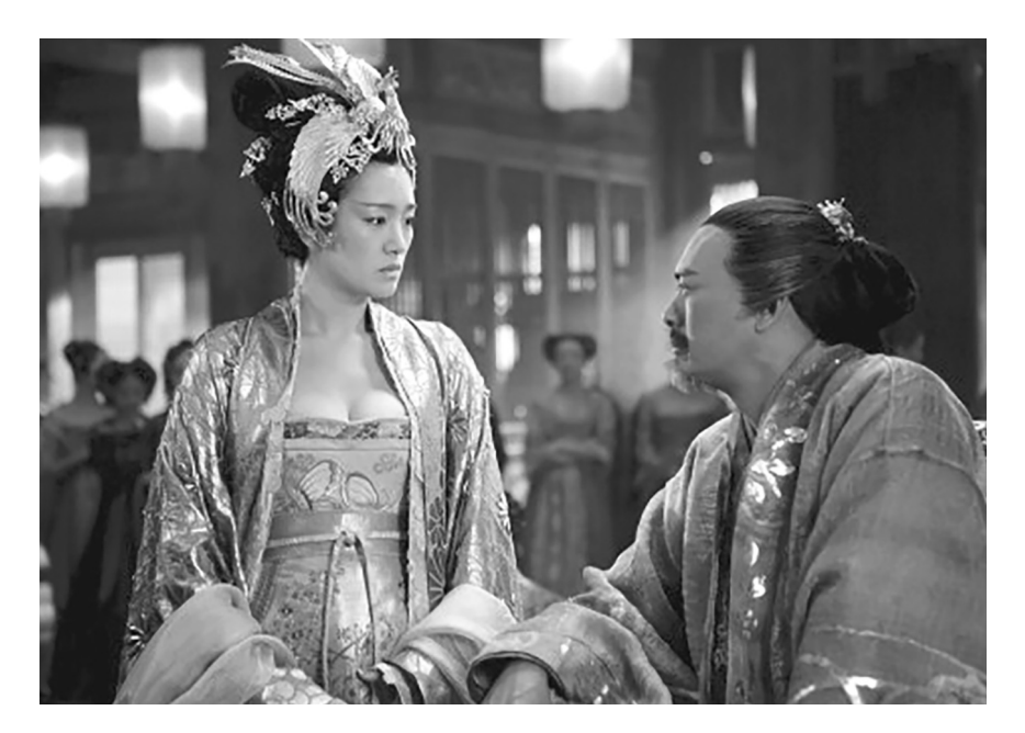
Figure 1.2 Gong Li and Chow Yun-fat are in the main cast of the Chinese epic drama, Curse of the Golden Flower (2006), which exhibits the appeal to the global film market

2010) as polysemic, multi-dimensional, and hybridised, not lying in the paradigm of the Orientalised image as their action counterparts whose transnational profile was more Hollywood-oriented. Their star presence embodies 'mutating currencies of transnationality' (Lee 2011: 1), which seems more complex and unstable than the outcome of mere 'Hollywoodisation' or 'Americanisation'. It coincides with Lisa Funnell's (2013b) argument that it is necessary for transnational Chinese stardom to move beyond the Hollywood crossover and to consider the stars within Chinese industrial contexts (118). It also prompts us to reevaluate the transnational Chinese image without presuming that globalisation is always 'Western'. These famed figures present a cultural critique of the West, particularly Western modernity, and introduce change and complexity in hegemonic dynamics. Whereas the tension between Chinese-speaking stars and the Anglo-American system is often the critical focus, such tension was not set up as solely between the off-cited dichotomy of 'East' and 'West'. Rather, it is established in a network for connecting new visualities and communities, which emerged as a result of global capitalism (Yue and Khoo 2014: 4), reimagining Chineseness in the milieu of contemporary border-crossing stardom.