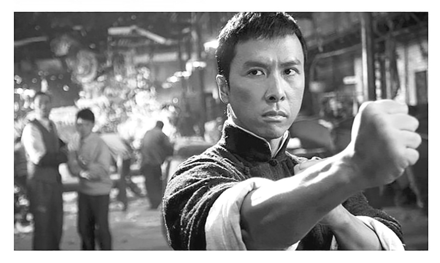
Figure 1.1 A movie still of Ip Man included in a blog entry of 'The Fightland Blog'