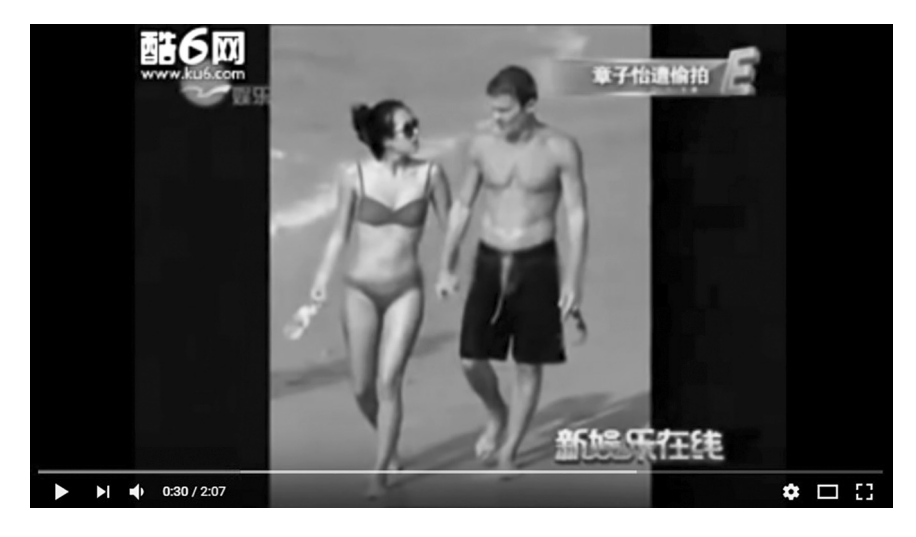
Figure 4.2 The YouTube video encompassing images of Zhang Ziyi's 'sex photo-gate' copied from the video-sharing site www.ku6.com