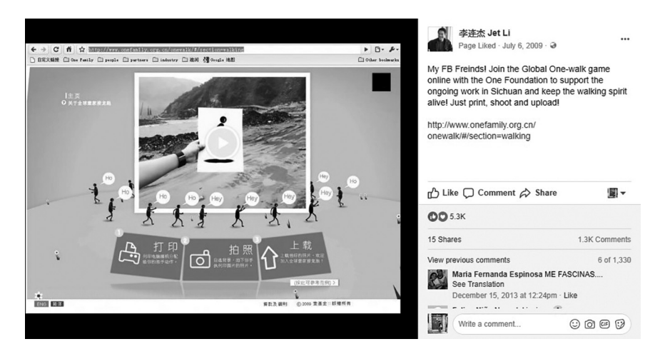
Figure 3.2 An online game launched by the One Foundation as part of the fundraising for the relief work of the Sichuan earthquake in China in 2008

Facts and figures' 2008). The message of the post states, 'My FB Friends! Join the Global One-walk game online with the One Foundation to support the ongoing work in Sichuan and keep the walking spirit alive! Just print, shoot and upload!' By no means neutral, the propagandistic penchant of the status update actively campaigns for Li's humanitarian causes. The direct address shapes Li's online persona by fabricating an ostensibly amicable and approachable image on Facebook and, thus, the imaginary close links with fans.