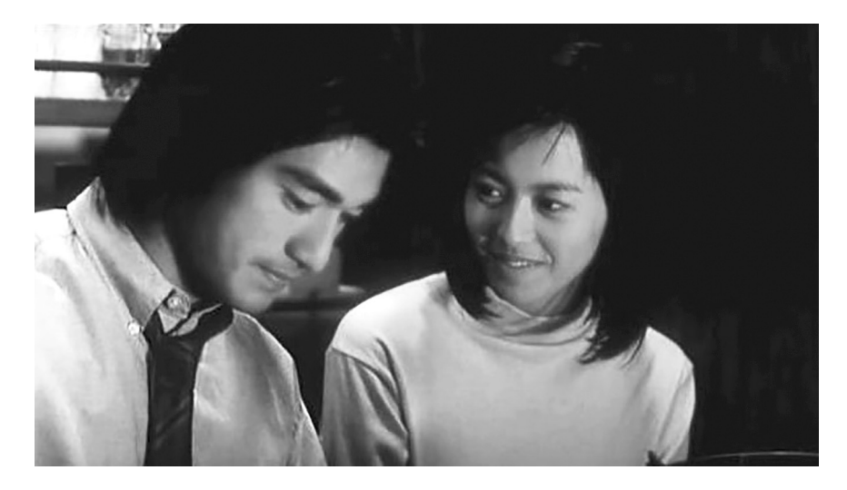
Figure 5.2 The camera focuses on the 'beautiful' faces of Takeshi Kaneshiro and Gigi Leung in Tempting Heart (1999)

A longstanding notion reveals that good looks and convincing acting are two contrasting strands of star presence. Stars who look handsome tend to be interpreted as poor in acting skills, and vice versa. This tension is a major theme in Takeshi Kaneshiro's star phenomenon, attracting media and public attention. The actor has once expressed, 'Even today, the media still like to put a lot of emphasis on my appearance ... Sometimes, I feel as if my looks have overshadowed my performance and the hard work I put into my characters. They can be an obstacle for me' (SCMP 2008). An evident part of Kaneshiro's fans' cyber-discourse positions him as a celebrity star rather than as a serious star. Consider a fan site established under the name of Takeshi Kaneshiro, http:takeshianiki.forumotion. com/. The subforum 'fan art' features users' creative works relevant to the actor, including pictures, poetry, short stories, and song lyrics, expressing adoration and thoughts. A piece of poetry under the thread title 'new verse for TK' indicates the focus on Kaneshiro's physical appearance. Uploaded on 4 August 2008 by the user 'mikomijade', the poem reads: