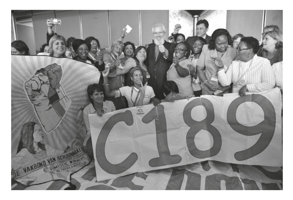
Figure 16: Representatives of domestic worker organizations celebrating the adoption of the Domestic Worker Convention (No. 189) with ILO Director-General Juan Somavía at the 2011 ILC.

ILO's long history of engagement with informality, which started in the 1970s with the World Employment Programme.<sup>711</sup>