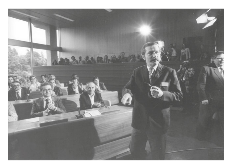
Figure 13: Lech Wałęsa at the 67th Session of the ILC, 1981.

(which, in return, received the backing for another resolution denouncing Israel). In March 1983, however, the Governing Body decided to establish a Commission of Inquiry, which found that there was no legal basis for the ban of Solidarnosc . The Polish government, supported by other socialist countries reacted with great indignation to the Commission's report which was submitted to the Governing Body in June 1984. In November of the same year, Poland submitted a notice announcing its intention to withdraw from the ILO within the regular two-year period. At this point, and despite continuing protests from the Workers' group, the ILO softened its approach towards Poland in order to keep the door for membership open. Martial law restrictions were progressively relaxed, and Solidarnosc could legally function again in 1986. Poland postponed its withdrawal and then actually never left.<sup>614</sup> By that time, the pace for changes in the region was set by the policy of perestroika under the new Soviet leader Mikhail Gorbachev. As one of the consequences of this change, the Workers' representatives of the formerly monolithic communist bloc were no longer obliged to vote in accordance with