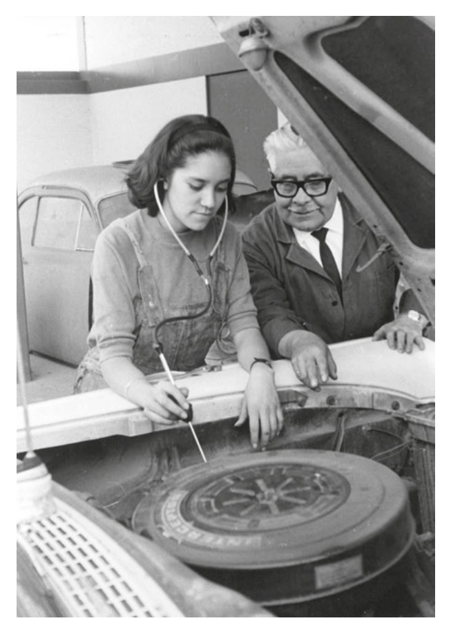
Figure 9: Training course in car mechanics, International Training Centre of the ILO, Turin, 1960s.

ception that "more scientific" approaches were necessary to gain credibility, both with the public and vis-à-vis other organizations carrying out similar functions.<sup>433</sup>