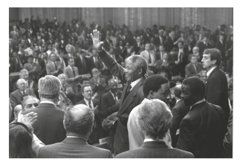
Figure 14: Nelson Mandela at the 77th Session of the ILC, 1990.

While unleashing an ever-increasing flow of goods and capital on an unprecedented scale and opening opportunities for businesses to expand, globalization has, at the same time, restricted the capacity of countries to control the economic forces working within their own national borders. As a consequence, governments – some more voluntarily than others – have abdicated some of their means to pursue social and employment goals, under the impression of presumably irrefutable demands of globalization. For the ILO, these developments and the debates accompanying them, spelled immediate dangers. Already during the late 1970s and 1980s some of the certainties – and indeed the foundations and premises on which the ILO's work had rested ever since the Second World War – began to erode. If national governments and national trade union federations were losing part of their capacity to steer economic and social policies on the state level, the ILO would necessarily lose part of its influence, too.