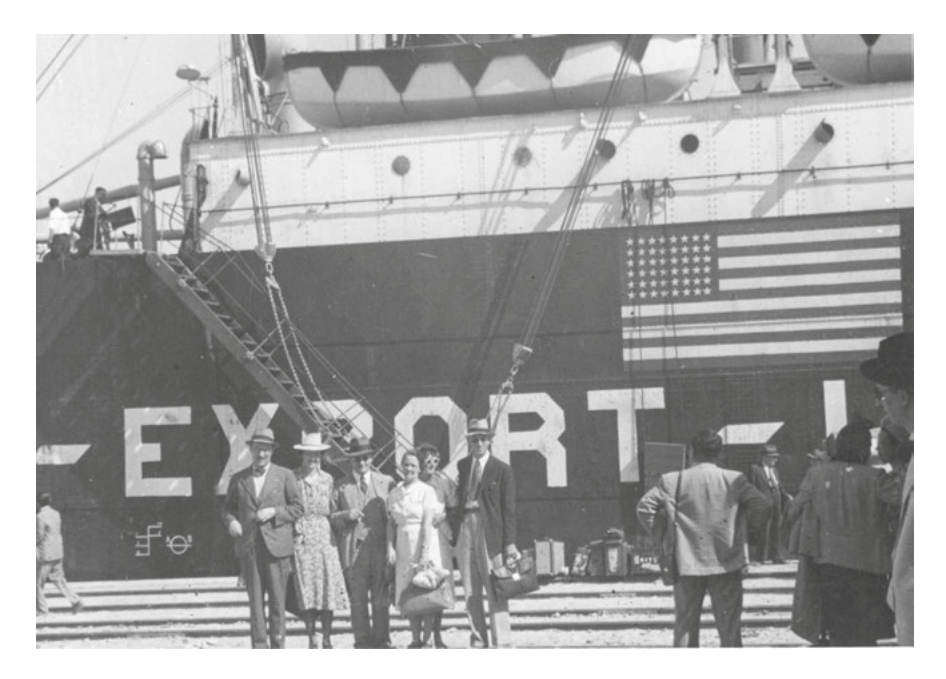
Figure 6: Group of ILO staff in Lisbon, waiting to board a ship to Canada, 1940.

ity had to be laid off. All in all, about 40 members of the ILO's staff travelled secretly through French and Spanish territories to Lisbon. From the Portuguese capital – where thousands of people fleeing persecution and war were desperately waiting for passage to a safe haven overseas – the group eventually boarded the steam liner Excambion , leaving Europe for an uncertain future.