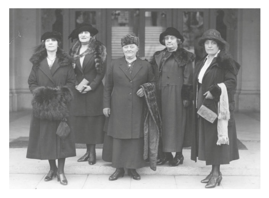
Figure 2: The Norwegian government delegate Betzy Kjelsberg (centre) with technical advisers. Kjelsberg was the first and only woman delegate with voting rights when she attended the third Session of the ILC in 1921.

The two Conventions that dealt specifically with women's employment were, for most part, an expression of the protective mainstream thinking. For legal equality feminists the Night Work (Women) Convention (No. 4) was the quintessential expression of the attempt to perpetuate a social order through ILO standard-setting which gave men priority in access to jobs and relegated women to the role of housewife and mother.<sup>152</sup> By contrast, the Maternity Protection Convention (No. 3) had wider support among women's organizations, because it also contained provisions for compulsory benefits that went beyond the merely protective frame. The protection of women workers during pregnancy and after childbirth has been the least controversial area of protective standard-setting for women, and it has