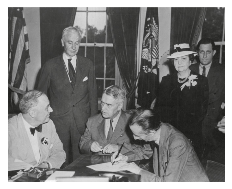
Figure 5: ILO Director-General Edward Phelan signing the Declaration of Philadelphia with Franklin D. Roosevelt, President of the United States, at the White House, 1944.

form upon which the ILO could secure its place in the post-war order, as the result of factors that its leadership and its most devoted supporters could only partly control.