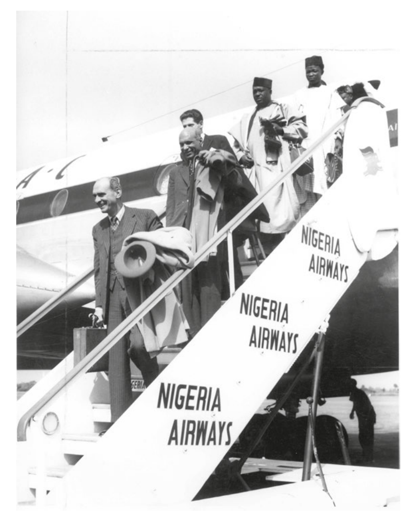
Figure 11: ILO Director-General David Morse arriving to the First African Regional Conference, Lagos, Nigeria, 1960.

international agencies to both launch large size programmes and get involved more directly in the developing countries' planning processes. Campaign-style programmes were also in line with new techniques tested by international agencies to reach out to a broader international public through cooperation with NGOs and academic partners. The WEP has to be seen in the context of a whole series of similar campaigns taking off from within the United Nations system during the 1960s and 1970s. Examples are the FAO's Freedom from Hunger Campaign