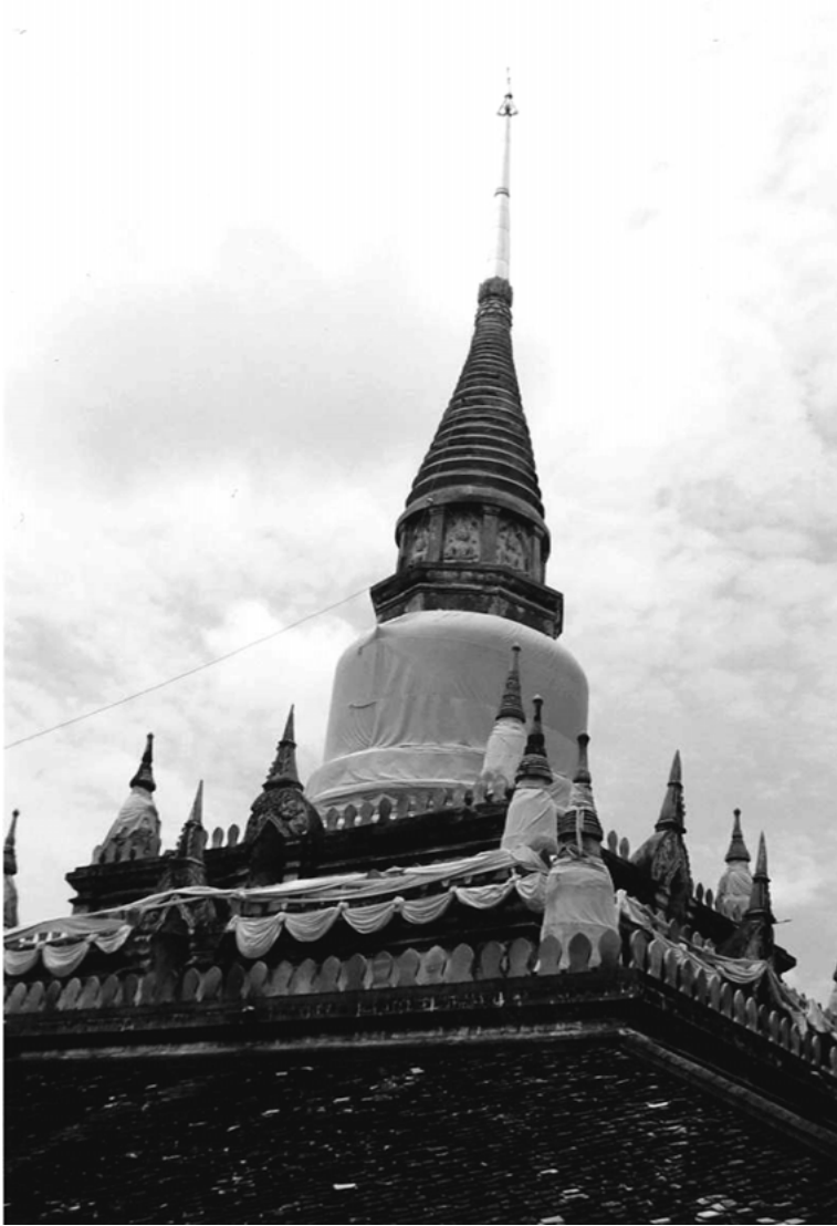
Wat Phra Kho, Reliquia, Songkla, South Thailand.