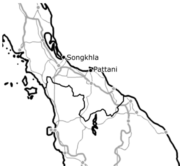
Map 1: Southern Thailand, showing Songkhla and Pattani in the Gulf of Thailand

The present study is concerned with the escalating competition in which cultural concepts vie for hegemony in the expanding local public sphere in Southern Thailand. The aim of the study was to assess recent forms of we-group formation, which seems to be centrally based on the cultural imagination and distinction of the educated middle classes. The transformation of society and culture in Southern Thailand has rarely been explored from this angle. Buddhist-Muslim relationships and identity politics in the 1990s can be interpreted as resulting from