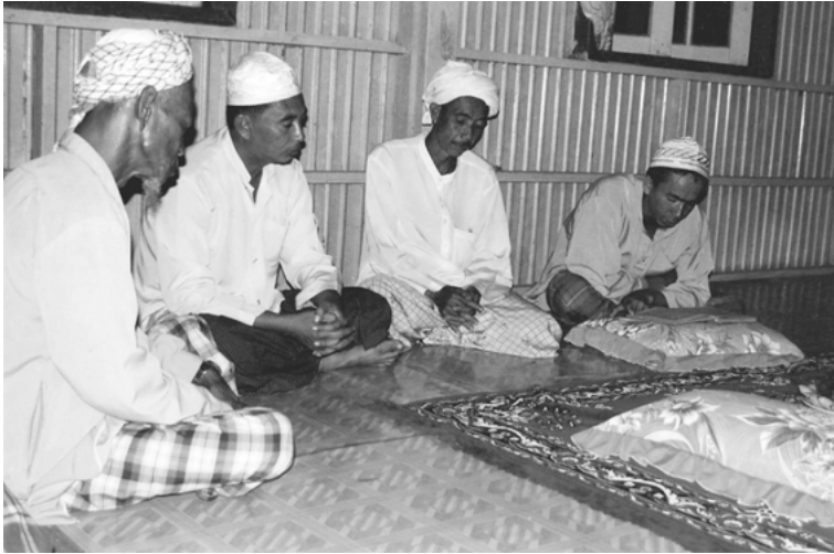
Islamic Chant, Patani, South Thailand.

Does the Songkla-based movement take the place of a third sector between market and state? The ‘club’ provides a forum for the organisation and networking of the Thai-Buddhist middle class. The cultural movement presents itself as firmly anchored in Thai culture. Interestingly, it is not the central Thai culture that has been performed in the urban events, but rather, local community culture. Local people are urged to participate in the building of baan muang in Songkla. Although the association does not challenge the legal or political system, the middle class is increasingly able to impose its moral standards on the rest of urban society. From this angle, the club succeeds in an upgrading of the cultural field. The enhancement of the cultural field is strengthening the position of the new middle class. The strategies of the people’s organizations in Songkla are processes of local reconstruction, self-awareness and emancipation.