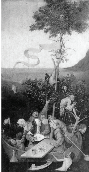
Fig. 1. Hieronymus Bosch, Ship of Fools (1490–1500)