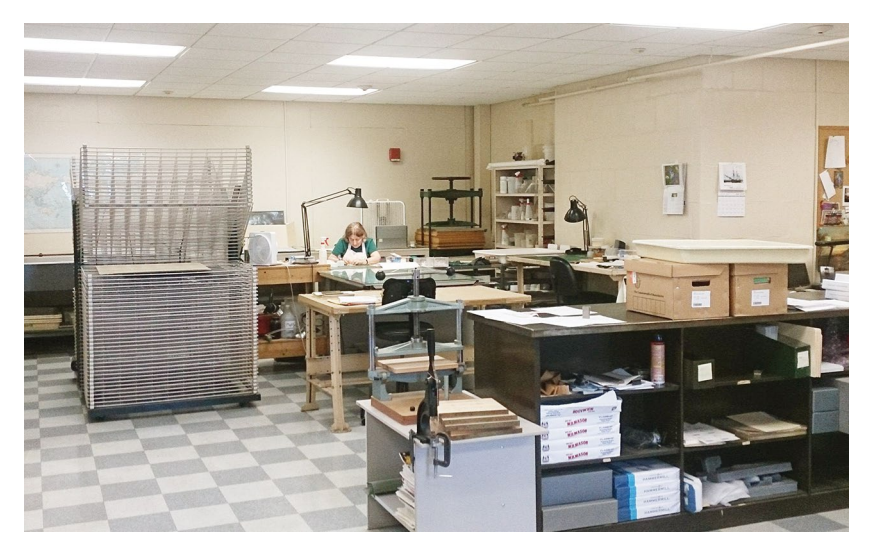
Figure 3: Document preservation facility, Superior Judicial Court.

Although discussed as early as the 1970s, the poor physical state of court records was as much of a concern to researchers as the poor identification of their location.<sup>72</sup> The former Director of Archives and Records Preservation at the Superior Judicial Court noted that from the start of the Colonial Courts Record Project, it was necessary not only to identify where records were kept but also to begin a process of repairing and preserving those records.<sup>73</sup> Consequently, Archives and Record Preservation has a large document-preservation facility in the Superior Judicial Court Building.