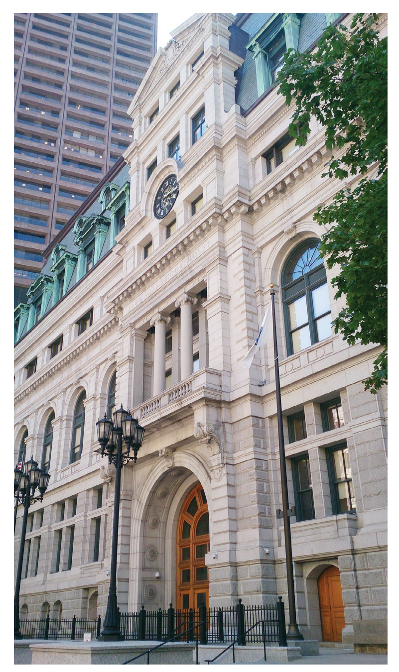
Figure 1: Massachusetts Supreme Judicial Court, Boston, Massachusetts.