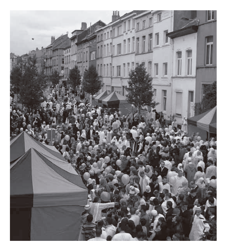
Women and men after Eid pray together for a street feast in front of the 'megamosque'.

"... separated Salafis who think to know Islam better than their parents and even their imam, after they have read only a few Islamic works".