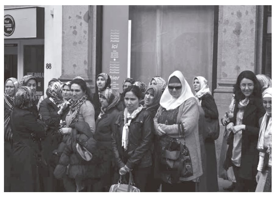
Local women like to be informed on societal issues. Here, they are returning from a group visit to the bank.

debate evenings with keynote speakers from different ideological backgrounds, as this approach corresponds to the Belgian socio-cultural state-funding requiring a sufficient level of discursive pluralism. This setting is not perfect, as the observed centre coordinator points out that in Belgium 'openness towards different directions' after all remains a wishful ideal. She experiences secularism being too much state imposed and hindering Muslims' internal and external reflections from going hand in hand. Whereas Islam is discussed, secularized Westerners are less likely to join the debates, except where the 'Muslim organizers' choose the card of religious liberalization for which state funds can easily be found. Meanwhile, in the latter case, the dominantly conservative Muslim public of the research site remains visibly more absent.