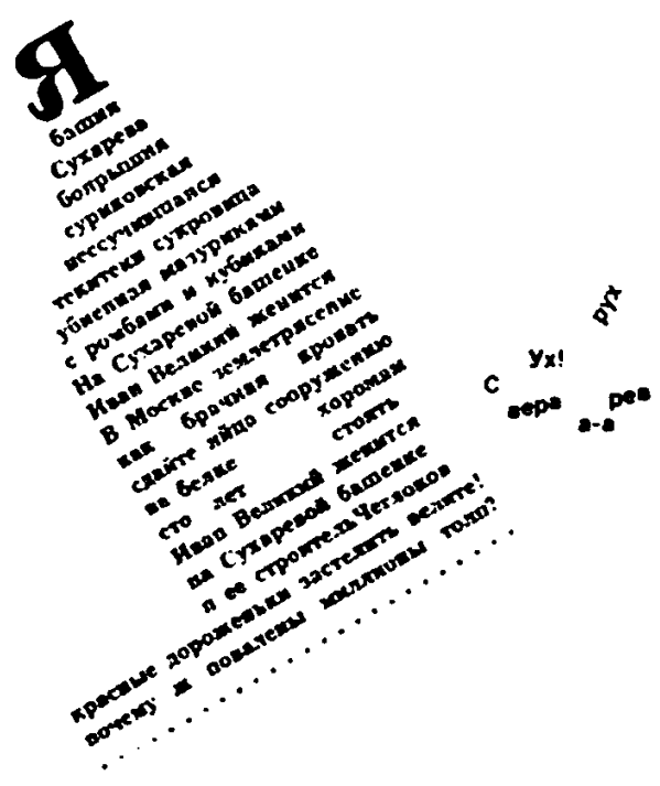
По Сухарской башие рыдай, Иван Великий! Над Москвой белест овдовевший столи.

If we recall, Voznesenskii first turned to this genre in Ten' zvuka (1970), but then abandoned it for several decades. He comes back to it in Aksioma samoiska , which features a significant number of visual poems. Here is one of them, dedicated to the ancient Sukharev tower, which was demolished in the 1930s along with many other historic buildings in downtown Moscow: