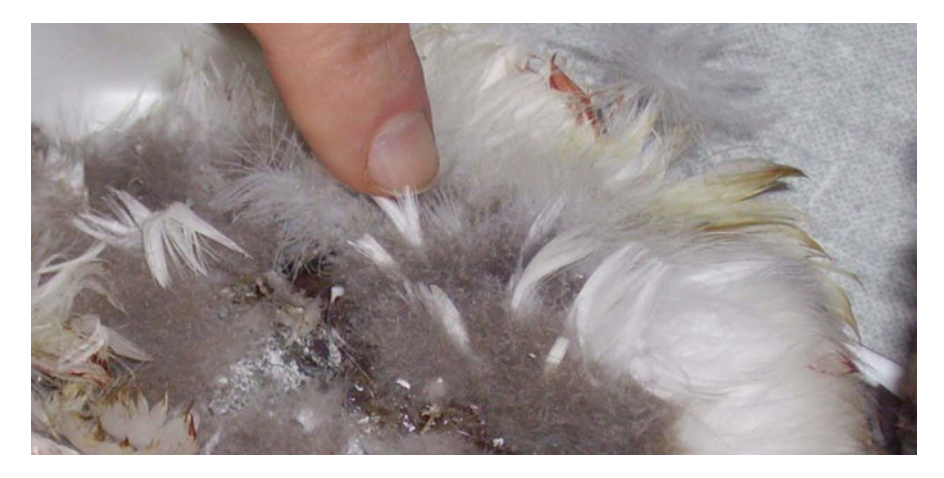
Fig. 3.2 Blood keel feathers in growth

should be dry. No visible infestation of feather inhabiting parasites. Put all feathers from one individual bird in the same envelope. Close, seal and label the envelope. Note which samples it contains (large feather, down feathers, blood keel(s); bird species, [if possible also: sex, growths status (juvenile, adult)], date and location of sampling, name of person sampling. The samples can be stored at room temperature. No preservation is required. They should be shipped by ground or air with adequate protection (bubble wrap envelope) and sent to the isotope laboratory of choice.