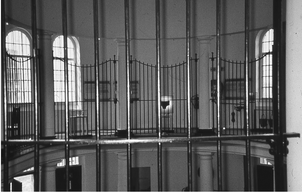
FIGURE 3 Installations across the atrium at the Women's Jail, Johannesburg, 2005.