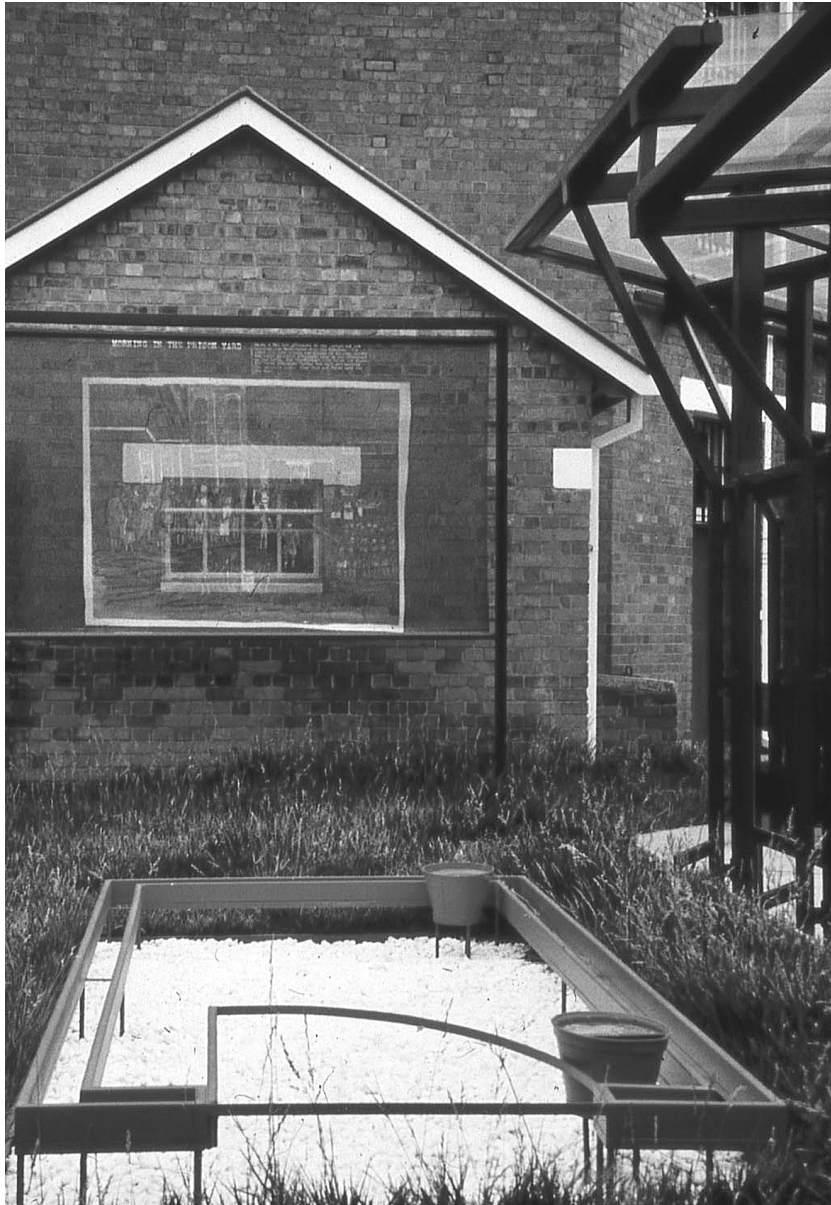
FIGURE 2 Ground plan of a cell at the Women's Jail, Johannesburg. Metal, 2005.