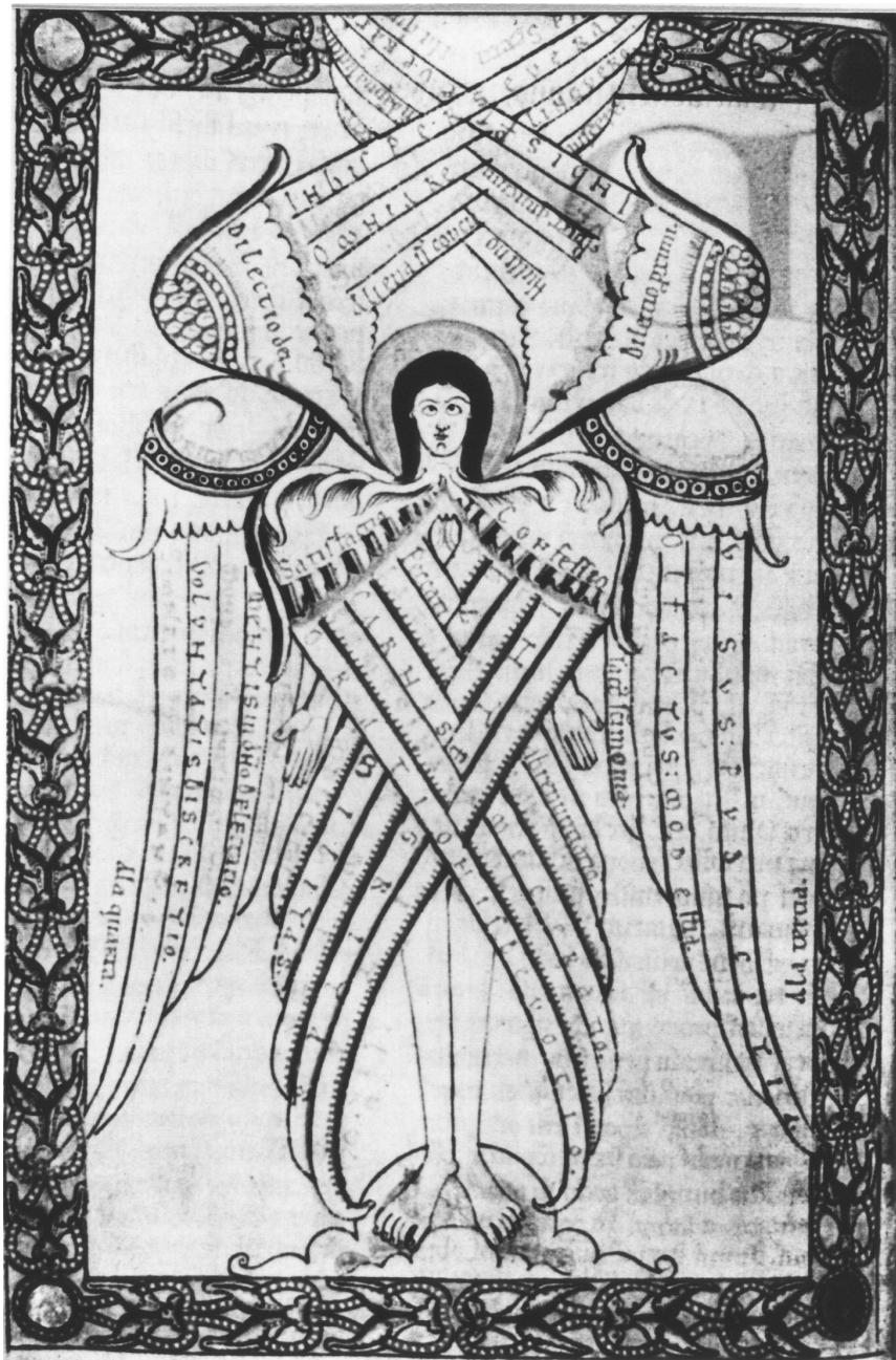
FIGURE 2. The Seraph (or Cherub) figure, used in recollection. Cambridge, Corpus Christi College MS 66, p. 100; English, c. 1190; from Sawley Abbey (Cistercian), but probably made in Durham.