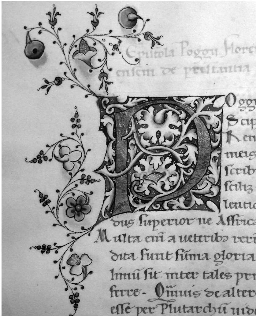
Figure 2-1. Oxford, Bodleian Libraries, MS Bodley 915, fol. 100v, illustrated motifs by Poggio Bracciolini.

as they are in fifteenth-century English art generally, but they do appear on the Followers' pages of the Prayerbook of Charles d'Orléans. 47 Even more typically English is the lion's mask with vines emerging from ears and nose that makes up the central feature of another initial. 48 No one could confuse this with Italian work, but the Florentine inspiration is clear