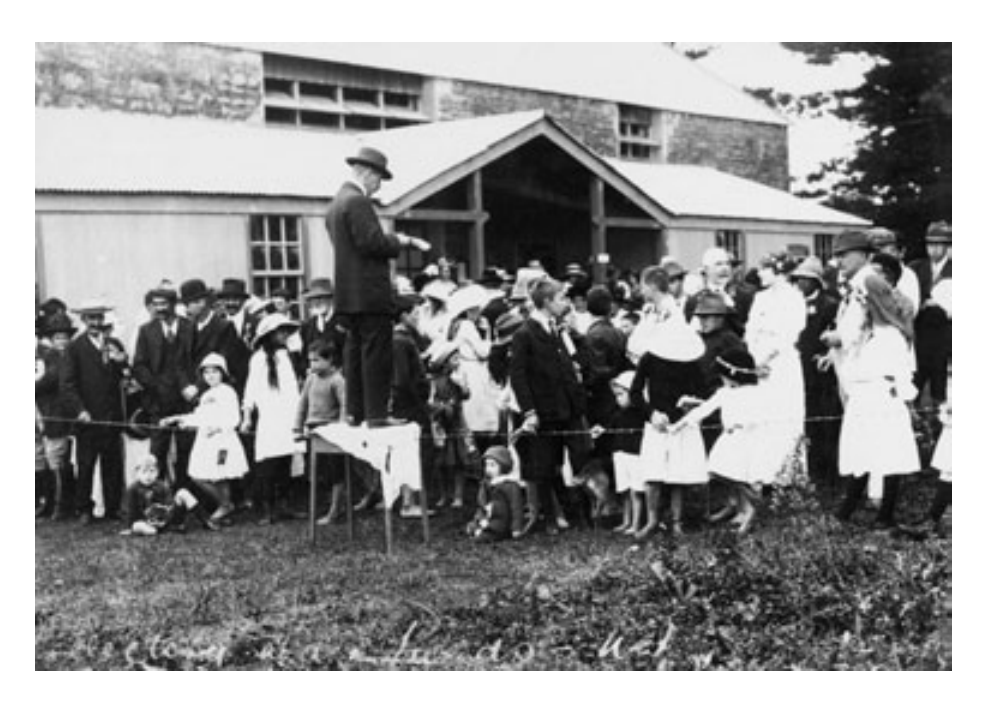
Collecting War Funds Norfolk Island A145 neg. no 25