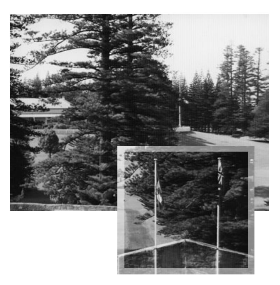
View from the Legislative Assembly towards Government House. Insert: The Norfolk Island and the Australian national flags