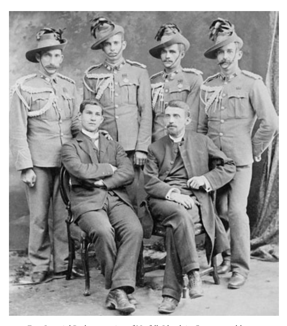
Four Imperial Bushman natives of Norfolk Island, in Commonwealth Contingent sent to London for the Coronation of King Edward VII; also one clergyman and one civilian, London NAA CP697/96/