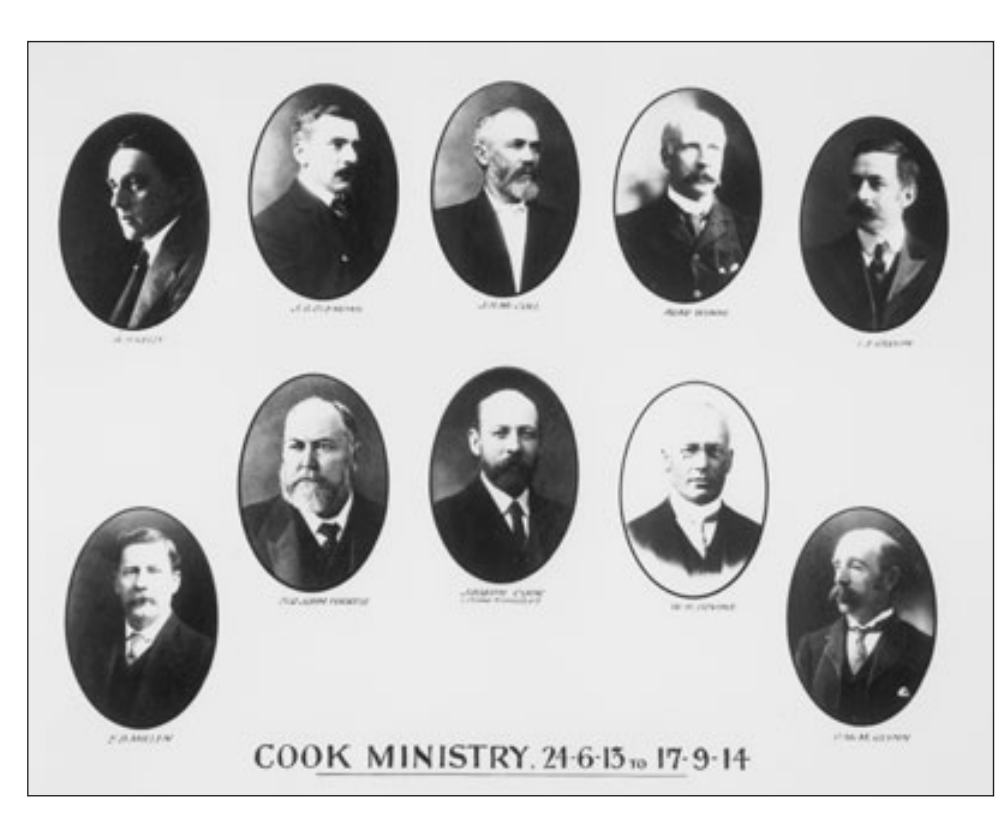
Cook Ministry (1913–06–24 to 1914–09–17) Copied from photograph hanging in Cabinet Room, Parliament House, Canberra