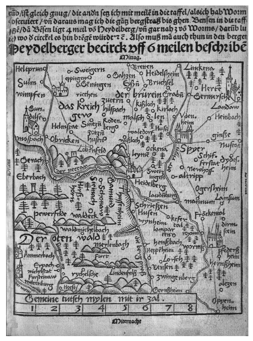
Heydelberger becirck uff 6 meilen beschribe[n], from in Sebastian Münster, Erklerung des newen Instruments der Sunnen, nach allen seinen Scheyben und Circkeln, Oppenheim 1528.

The electors were also noteworthy for being the most important patrons of early humanism in Germany. Late medieval Heidelberg reached its cultural apogee in the last decades of the fifteenth century, with the