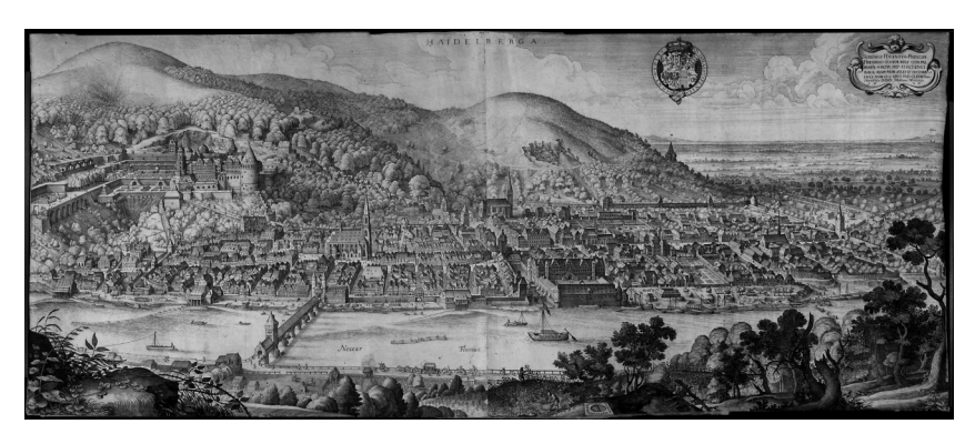
Engraving of Heidelberg by Matthaeus Merian, 1620.