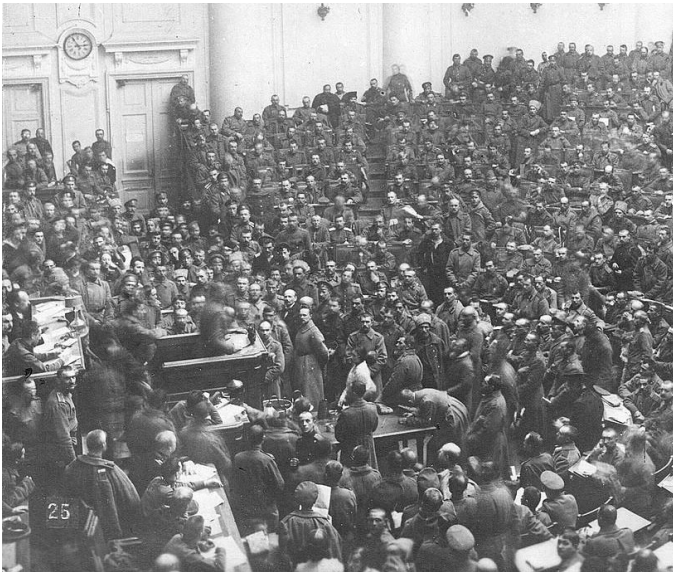
Mass participatory democracy. The Petrograd Soviet in session.