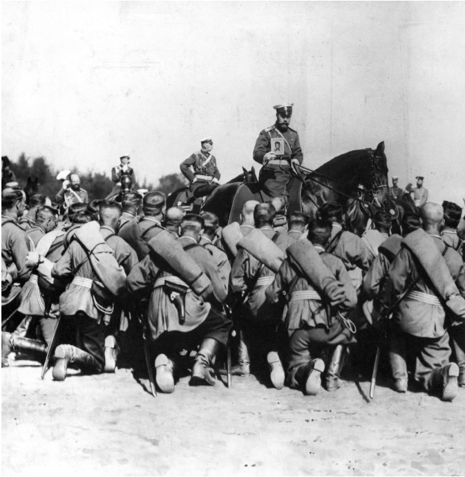
Medieval mysticism. Russian soldiers – peasants in uniform – kneel as the Tsar passes by waving a holy icon.