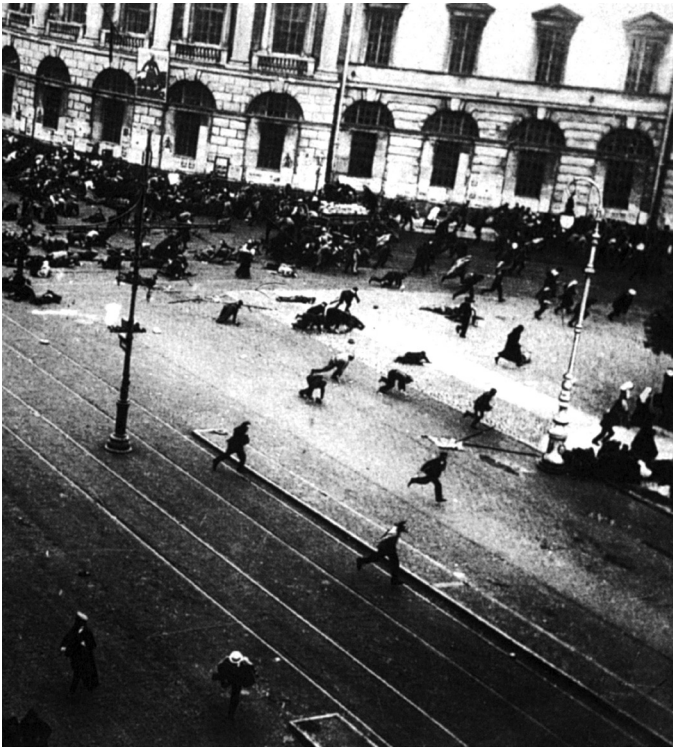
The July Days. Demonstrators scatter as right-wing gunmen open fire from upper-floor windows.