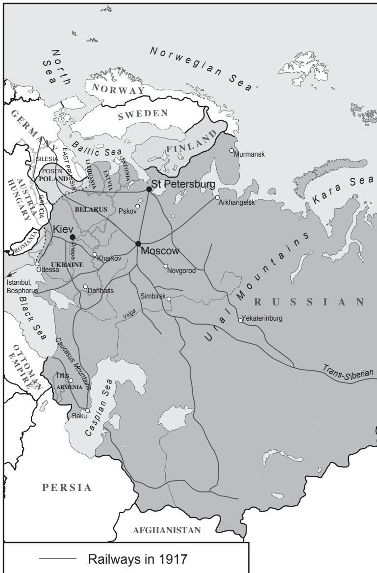
Map 1 The Russian Empire in 1917