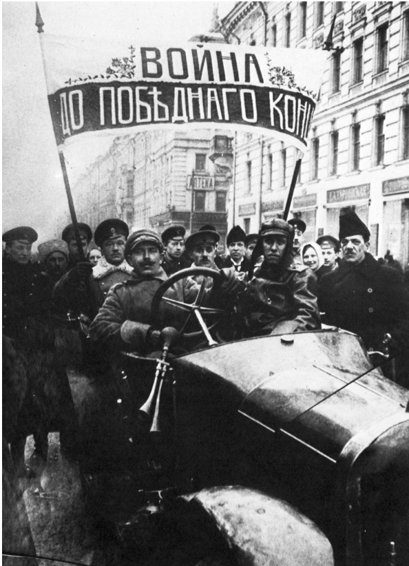
The counter-revolution. Right-wing soldiers demonstrate in favour of war.