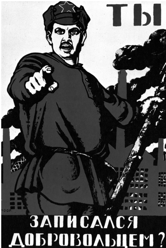
Defending the revolution. A Red Army recruitment poster from the Civil War.