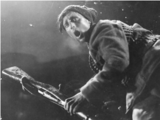
The October Days. A still from Soviet filmmaker Sergei Eisenstein's depiction of the storming of the Winter Palace.