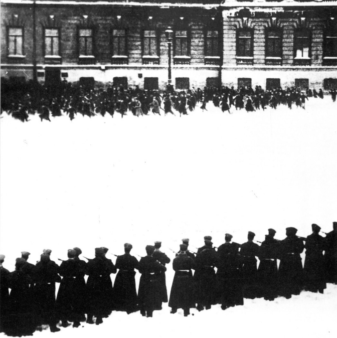
Bloody Sunday. The Tsar's soldiers shoot down demonstrators outside the Winter Palace in St Petersburg in 1905.