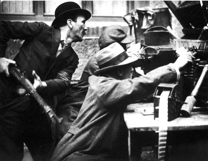
Spreading the revolution. German revolutionaries man the barricades in Berlin in January 1919.