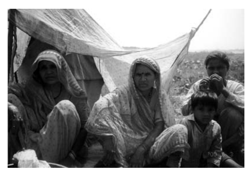
25 Mallah women cultivators mind their crops near the Ganges, Allahabad.