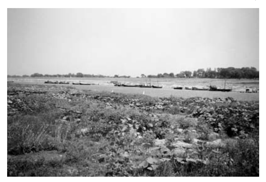
27 Islands of fertile cultivable land on the Ganges near Allahabad.

convinced that the interests of the family or society at large would be served. Had the sole purpose of the meetings been for play or entertainment, the women would likely have found it much harder to get away. On the whole, younger wives, who were still in the process of establishing themselves in their marital homes, were rarely present at meetings and workshops unless accompanied by a senior woman of the family, usually the mother-in-law, who was also participating. In these matters, the spadework the NGOS carried out was important in breaking down the resistance of the village patriarchal communities to the new ideas and initiatives the NGOS offered.