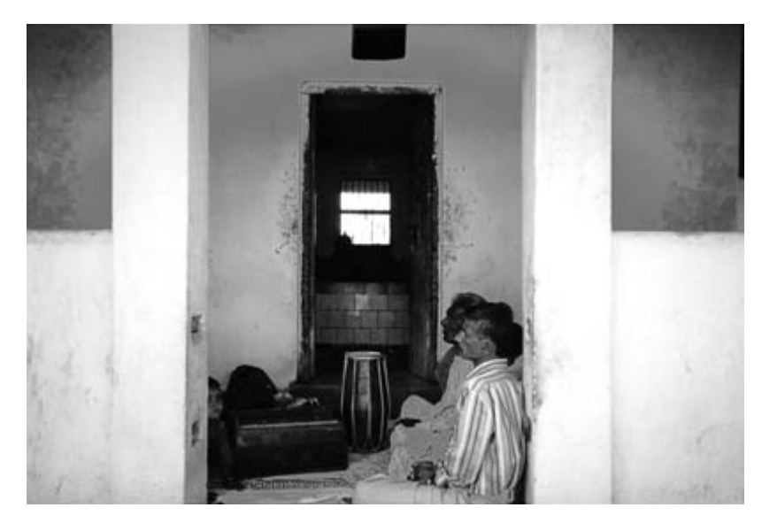
_{\rm 3} \, Preparing for a singing session at the goddess temple in Misraulia, Chhapra.