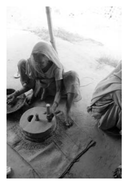
8 Small version of the type of grinding stone still in use in Barsara village, Jaunpur.

wider social and gender-specific lessons, about both power and power-lessness, to be most effectively learned.