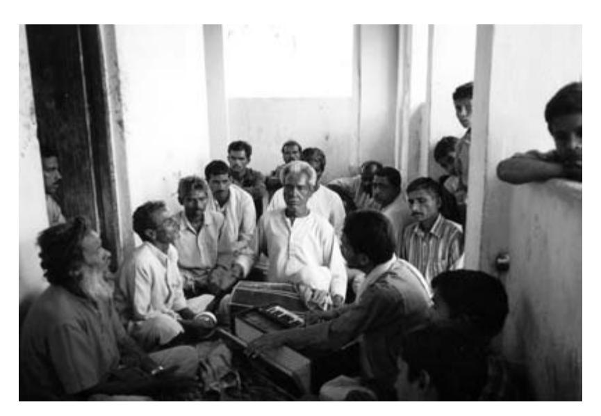
6 Ecstatic devotional singing in Misraulia, Chhapra.