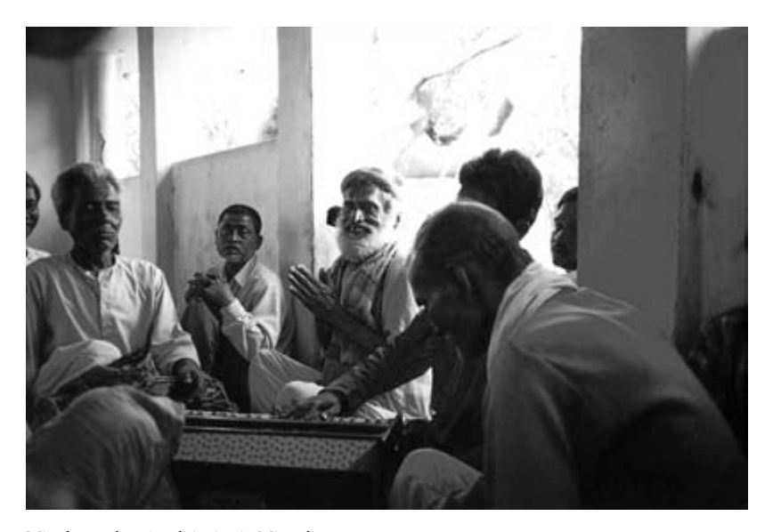
1 Mixed caste devotional singing in Misraulia.