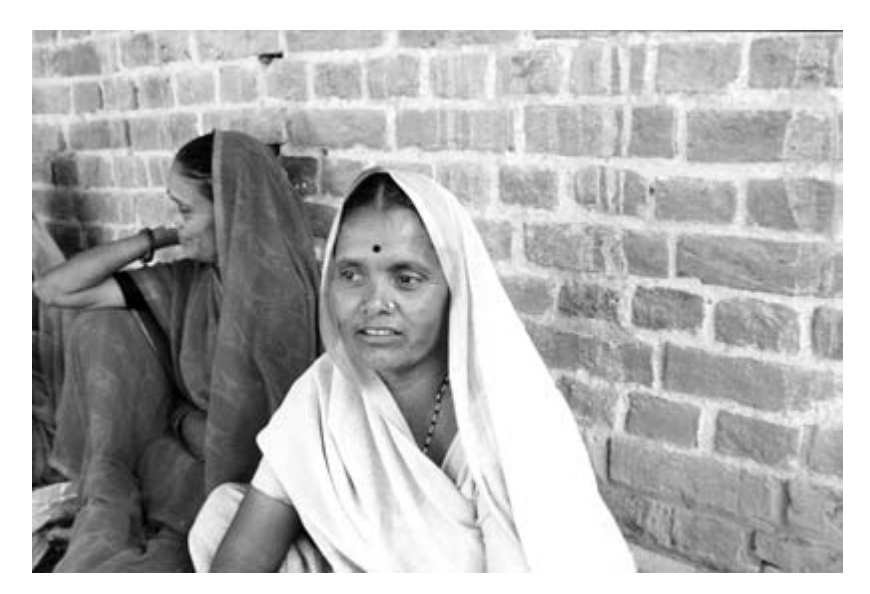
16 Wives of prosperous Brahmin (center) and Rajput (left) landlords in Barsara, Jaunpur.