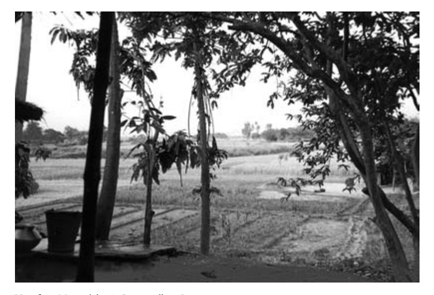
18 View from Munraji's hut in Barsara village, Jaunpur.

this section that upper-caste women face food shortages, the lower-caste Munraji's reference to palatial living conditions appear equally to challenge the stereotypes and expectations we have about the subject matter of lower-caste women's songs. However, it must be stressed that the song is entirely in keeping with folk conventions of remarkable exaggeration, wherein humble peasant dwellings are invariably referred to as palaces endowed with the world's riches, including horses and elephants, gold and silver, and other trappings of wealth. The next section highlights the significance of the context in which the songs are performed.