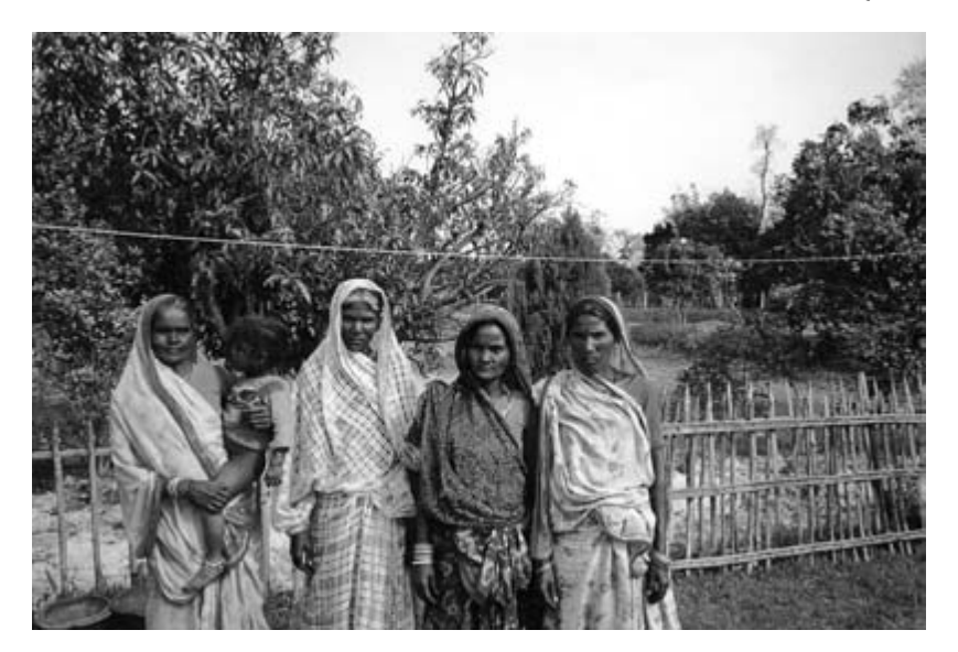
28 Members of a fishing cooperative in Madhubani, Bihar.

chairs." While the remarks were often harmless, that they were remembered fifteen years later seems particularly poignant.