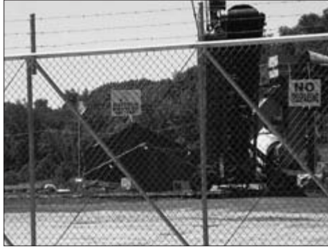
Sago Mine, 2007

pile of old boards sprinkled with pale yellow fungus. This is not what the people of Sago want, to have their style of living eradicated.