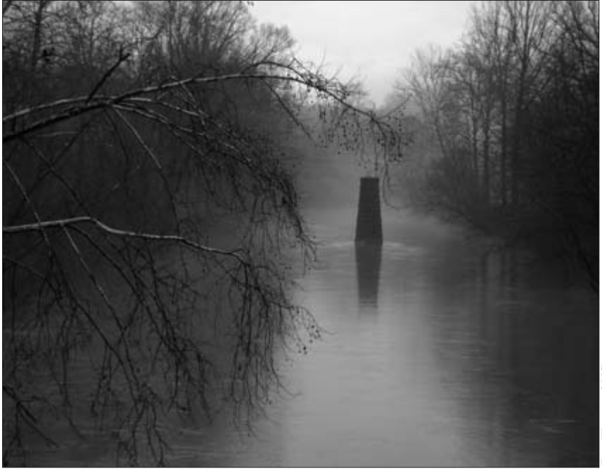
Stone block pillar in Buckhannon River

pour rain on the heads of the mourners gathered on the grounds of Sago Baptist Church to view the memorial: a six foot slab of granite, reflective and dark like the walls of a coal mine. Many came wearing T-shirts with the names of their deceased loved ones printed across them, and this time fewer camera crews camped along the sidelines to record the events.