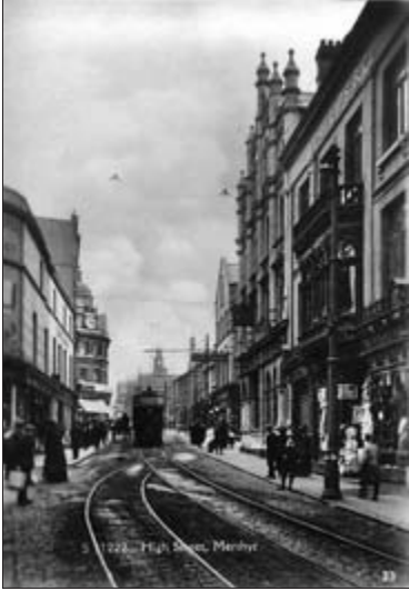
High Street in Merthyr Tydfil, WHS Kingsway, 1910

The buildings downtown, like the miners' houses, had fresh coats of paint. Flowers hung from lampposts, and the sun moved in and out from white clouds—a very different image than a photograph from 1910 I had found on a Welsh genealogical site on the Internet. In this photograph, the atmospheric effect on the buildings in the distance is significant. A stormy day could have caused this, but the people are hardly blurred, indicating a quick snap of the shutter. It must have been bright, with the clouding of the buildings resulting from the particulate matter pumped into the air by the smokestacks. Puddles gather on the street, and the tracks of a streetcar narrow into the distance. The photograph is of High Street, and men and women dressed in black line the walks next to the storefronts. In Evan and Margaret's time, these streets would have been even more densely populated. Between the hours of six and ten p.m., the working class would emerge in hordes for their evening promenade: girls in canvas dresses covering woolen petticoats, colliers with tin boxes and broad-brimmed hats. Women in checked shawls would sell their eggs, butter, and bacon. Apples and herring were sold in barrels. Amid the food retailers, quacks would call out their newest remedies for ailments ranging from indigestion to immoderate passions. Ballad singers would dispense a tune at the price of one pence per song.