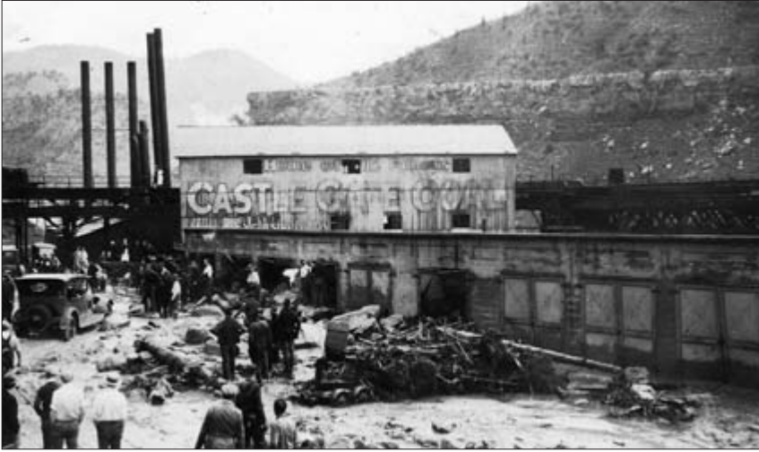
Processing facility at Castle Gate, circa 1924

long-tasseled bedspread are still brilliant, woven into the purple and pink. The Greeks opened coffee shops in every mining community, providing moustache cups to prevent Greek men from dampening their facial hair. One man left behind one such cup—an ordinary porcelain mug, except for the moustache-shaped barrier with a little round opening for the coffee to flow through.