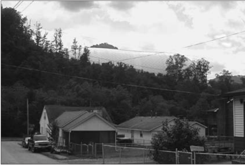
Silver dome at Elk Run preparation plant

Coal River Valley, an area so seemingly untouched by modernism and development, is the battleground for much of the recent debate over coal mining and its most destructive practices: water and air pollution, sludge lagoons, mountaintop removal, and flooding caused by diverted streams. Appalachian townspeople miles removed from grocery stores have recently found themselves in the forefront of the conflict, broadcasting their stories to a national audience. Sylvester is one such town, and I knew I'd arrived when I caught the almost metallic glint of an enormous white dome behind the trees. I pulled off into the neighborhood just under its shadow. A woman walking her two dogs asked me if I was looking for something.