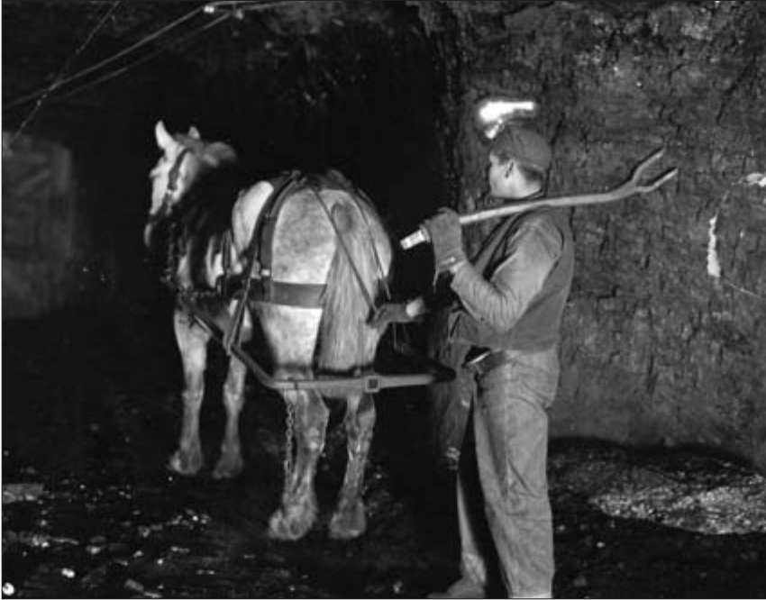
Miner and mule in Coos Bay, Oregon mine