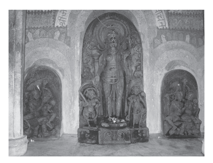
Figure 2.1 Uma Mahesvara icons from Bodh Gaya Mahant's Matha

Within this courtyard, a part of the ground-floor verandah has been fenced off and a heavily secured gate leads into a long chamber. The door to the chamber is kept locked, and entry and photography is restricted. Inside the chamber is probably the largest collection of images and sculptural fragments that I have come across outside of a museum. This fascinating collection includes Buddhist and Hindu deities, the sculptures are whole or broken along with a large number