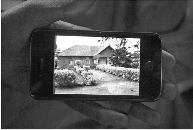
Figure 12.3 Final photograph in the Memory → Witness exhibition entitled, “Redemption,” by the author.

smiling woman. The concluding photograph is of a hand holding a smartphone displaying a photograph of a modern Rwandan home. More so than the others in the exhibit, these two photographs point to the ongoing nature of the post-genocide narrative. Bookending the exhibit with these two images suggests the nonlinear nature of this narrative. The genocide is not experienced as something that has come and gone; rather, it underlines and overarches individual and interconnected lives.