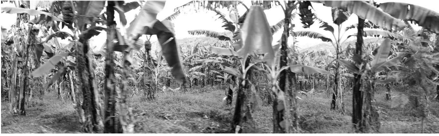
Figure 12.2 Photograph entitled, “I will always tremble whenever I hear voices raised among the leaves of the Banana groves”, for the Memory → Witness exhibit by the author.

at the Gisovu tea plantation between the lakeside town of Kibuye and the hilltop at Bisesero genocide memorial. Tremendous pain and sadness are in those hills, yet they look soft, inviting, and full of vitality. The photograph reveals its depth to spectators as they engage with the text, the image, and the narrative interwoven between the two. It is this sort of action the juxtaposition of the otherwise benign pictures and the contrasting text is meant to encourage throughout the exhibit. Other landscapes include pictures from Lake Kivu, banana groves, and the pine trees at Bisesero entitled “Understand this: the genocide will not fade from our minds. Time will hold on to the memories, it will never spare more than a tiny place for the solace of the soul,” “I will always tremble whenever I hear voices raised among the leaves of the banana groves,” (Figure 12.2) and “I feel at home here,” respectively (Hatzfeld, 2007).