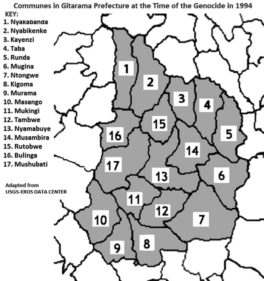
Figure 4.1 Gitarama prefecture.

Gitarama prefecture was also the cradle of evangelism in Rwanda and among the first places in Rwanda where Christian missionaries established