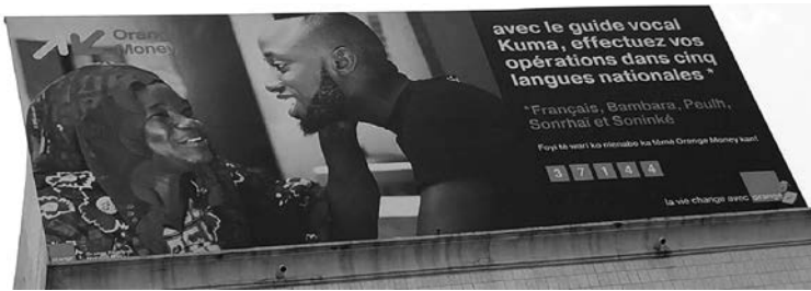
Figure 10.4 Orange’s national languages billboard

contexts. This idea is illustrated with the word yórɔ ‘place’ as an example in Figure 10.3, with the continuum extending from French-influenced spelling through historical and current official orthographies, to the normative IPA model prescribed by linguists.