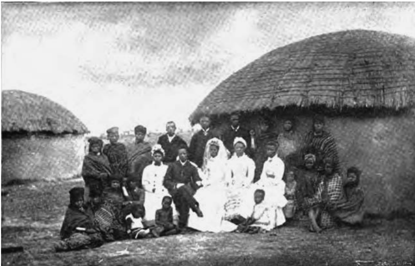
Figure 11.1 ‘White wedding’ party of mission-educated amagqoboka among traditional amaqaba , showing the overlapping of old and new in everyday life and the necessary hybridity of these categories

New forms of social differentiation and new identities emerged from the colonial encounter: on the one hand, there were those called amagqoboka , ‘the perforated/pierced ones’, who had been influenced by contact with Europeans and had adopted European practices; on the other hand, the amaqaba , ‘the smeared ones’, who used traditional red ochre as a form of bodily adornment and continued to follow amaXhosa practices (Hunter 1936; Mayer 1961). 4 While the two terms seem to depict distinct social personae, they are better understood as social orientations that can be foregrounded by the same person at different times (Deumert 2010), and they thus form part of a complex local response to colonial conquest (Mabandla 2013). A common strategy was for one child of the family to be sent to live at the mission station. This was, for example, the case for Dyani Tshatshu, one of the early interpreters mentioned above and son of the chief of the amaNtinde. The intention was to have a foothold on the mission, but also for Tshatshu to learn new skills (Levine 2011, 19; also Mabandla 2013, 44–45). Such strategies of engagement led to the emergence of a new social group: mission-educated and literate, while nevertheless rooted within the local context (see Figure 11.1).