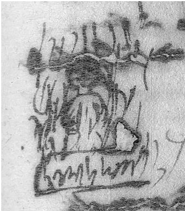
Figure 12.1 Notarial representation of the execution of Giordano Bruno

On that subject, the recent discovery of yet another abnormality involving Celestino’s death should be mentioned. The notary’s sketch of the burning was recently found alongside the official record at the Tribunale del Governatore. 21 Unlike the previously cited drawing depicting the execution of Giordano Bruno (Figure 12.1), and for that matter, unlike any other image seen to date in research on this type of representation (see another example in Figure 12.2), 22 this sketch does not trace the flames in a few brush strokes that approach, but do not overlap the figure of the condemned. Instead it shows the scaffold completely wrapped in and overcome by fire, in a fury of lines (Figure 12.3). A dense curtain of flames renders the dying man indistinguishable: perhaps with the purpose of making the graphic certification uncontestable, and to protect the notary in case of future disputes. 23