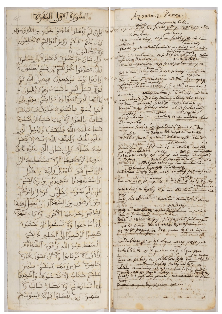
Figure 5.1: Sūrat al-Baqara (fragment) in Milano, Biblioteca Ambrosiana, MS D 100 inf., f. 46.