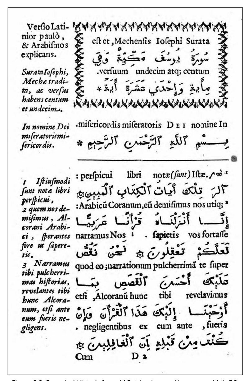
Figure 5.2: Erpenius' Historia Iosephi Patriarchae ex Alcorano arabicè, D2.