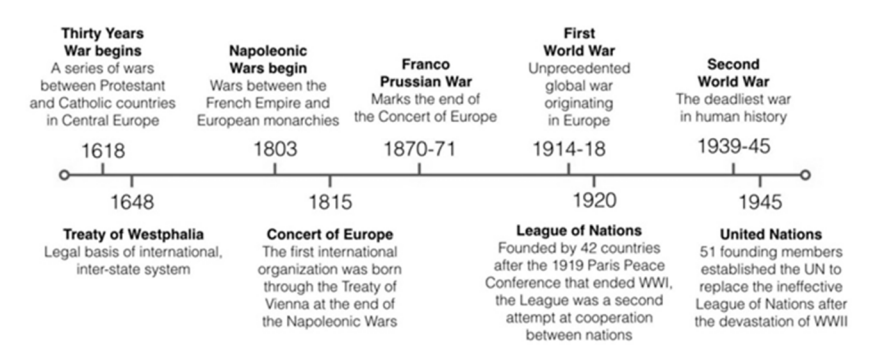
Figure 1: Evolution of international organizations, until 1945

The United Nations is not the first but the third in a series of international organizations that date back to 1815. To give some historical context to the establishment and workings of the United Nations as it is today, the first part of this chapter describes these organizations and the key events that led to their creation (see Figure 1).