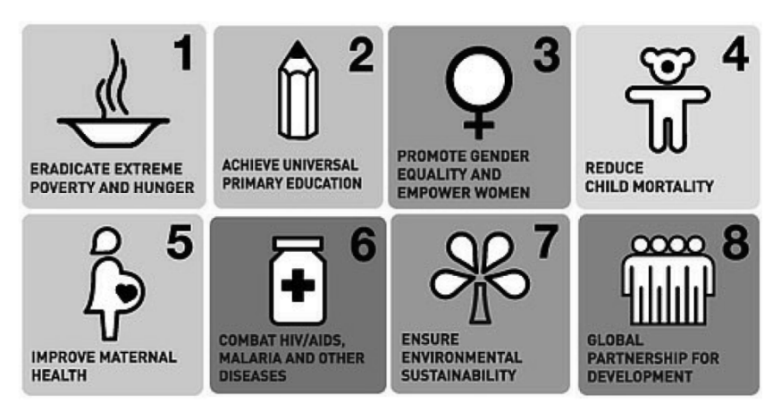
Figure 4: Millennium Development Goals

referred to as the MDGs, were eight easy-to-remember, time bound, focused and measurable goals that people worldwide could rally behind (see Figure 4). They were drafted in the late 1990s and came into force through the Millennium Declaration, adopted by the UN General Assembly on September 8, 2000. They were intentionally ambitious, with goals such as "halving extreme poverty" and "providing universal primary education" by 2015.