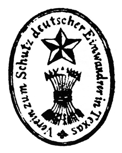
FIGURE 2.1 Logo of the Mainzer Adelsverein.

this group set up an organization on the Rhine called the Mainzer Adelsv erein, or the Verein zum Schutze Deutscher Einwanderer. These noblemen felt that German colonization in Texas would bring them wealth, power, and prestige. It could also, they thought, alleviate overpopulation in rural Germany. This project managed to draw thousands of Germans to Texas from 1842 onward, even negotiating a private treaty with the Comanches on the account that one of the Germans' land grants stood on Comanche lands (Figure 2.1).