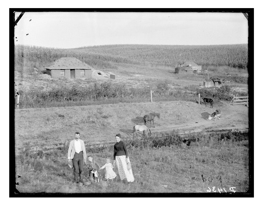
FIGURE 4.1 "My little German home across the sea."

In their efforts to domesticate and claim control over the colonized terrain, whites also tried to shape the land to meet their expectations. They turned out enthusiastic amateur scientists: gazing, sampling, and collecting flora and fauna. They brought seeds and planted gardens of vegetables, rolling green laws, and flowers. Rows of familiar trees surrounded settler homes and communities whether on the Australian Outback or on the Great Plains. Often little regard was given to the suitability of the natural surroundings to any particular kind of plant. For a colonial place to be claimed "civilized," it needed European greenery. One woman in Kenya explained that "it was proverbial of the English that they love to make two blades of grass grow where there was one before."<sup>2</sup> It was also equally proverbial of the settlers entering the West, those invading French Algeria, and numerous others places.