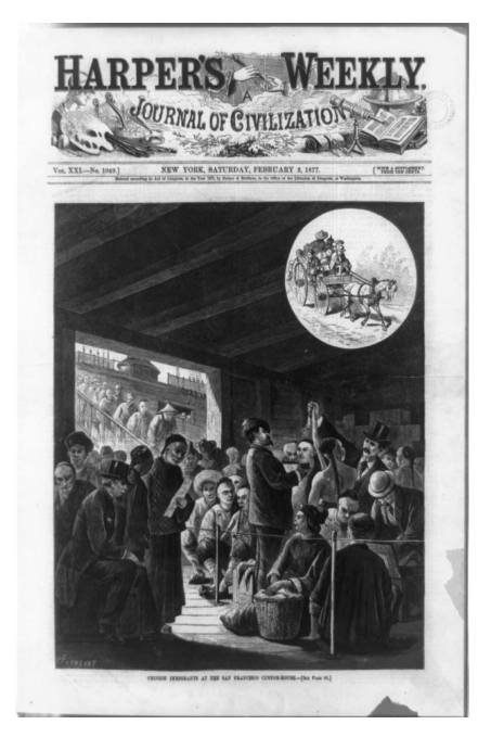
FIGURE 2.3 Chinese immigrants at the San Francisco customhouse.

Asian settlers kept coming legally to the West in the form of the Japanese, until their entry was restricted by the so-called gentlemen's agreement between the United States and Japan in 1908 and by the Alien Land Laws that spread like wildfire: California in 1913, Arizona and Washington in 1921, Idaho, Montana, and Oregon in 1923, Kansas in 1925, and several other Western states such as Utah and Wyoming up to 1943. This type of legislation was meant to keep the Asians out, to prevent their settlement by restricting their ability to own land and property. Like the Chinese, the Japanese would-be settlers frequently carved exceedingly transnational lives while negotiating the long shadows of exclusion and racial prejudice in the West. They included people like Hiroka Maeda, whose grandparents had emigrated from Japan to Oregon in the 1890s.