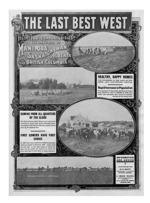
FIGURE 2.2 The Last Best West. Advertisement of the Canadian government in the Christmas edition of The Globe encouraging the settlement of Western Canada, December 25, 1907.