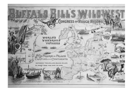
FIGURE 5.3 Buffalo Bill's Wild West Show European tour postcard.

electric lights and set up camp on the opposite side of the street from Cody in Hamburg. The "duel" ended in Carver's triumph, while Cody, left in the dark, gave just one performance before he split town. Gordon Lillie's, or Pawnee Bill's, "Historical Wild West, Indian Museum and Encampment," reached big time in the 1890s touring Europe and the United States. Frederick T. Cummins' Miller Bros. 101 Ranch Wild West staged an Indian Congress – including "Indian battles," holdups, cowboys, and stagecoaches at the Omaha Exposition in 1907. The show also toured Europe until World War I and put on the show at the Panama–Pacific International Exposition in San Francisco in 1915. In the 1910s, the German Sarrasani Circus (which is still running and world famous today) hired several Sioux as regular performers alongside Chinese, Javanese, Hindus, Ethiopians, and Argentinian Gauchos. And there were many others. At the turn of the century, an estimated 125 to 150 "Wild West shows" of various pedigree were on the road in Europe and North America.