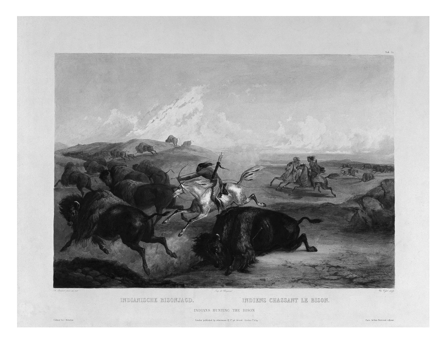
FIGURE 5.1 Indians Hunting the Bison, Tableau 31 by Karl Bodmer.

Gore saw no need to rough it in the wilderness. His party included 27 wagons, more than 100 horses, 18 oxen, and 3 cows. One wagon was just for weaponry, being crammed with pistols, shotguns, and about 75 rifles. Gore also brought a large striped green and white linen tent, a brass bedstead, a rug, a portable table, and several other luxury items. He had over 40 men on his payroll doing tasks from cooking and hunting to tending greyhounds and staghounds. It was much the same kind of material wealth and entourage with Charles Murray, the second son of the Fifth Earl of Dunmore. He followed the Pawnees on their summer hunt in 1835 dressed as a British dandy. He came with his English rifle, brace of pistols, Scots valet, and a kilt. Sir William Drummond Stewart, the Lord of Grand Tully and Baronet of Murthly, and a veteran of the Battle of Waterloo, tried to merge into the fur trading scene in St. Louis in the 1830s as a cultured gentleman hunter. Yet, he also brought from Europe special cheeses, wine, brandy, and servants.