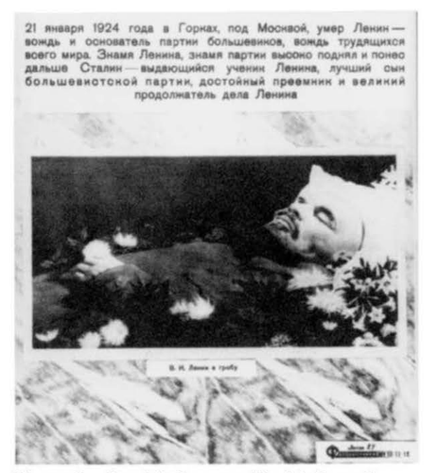
Figure 6. Pravda's Coverage of Lenin's Funeral Service, 1924

Lenin suffered another massive stroke on March 10, 1923. During the last ten months of his life, he was unable to speak, read, or write. He died on January 21, 1924, just short of his fifty-fourth birthday (see Figure 6).