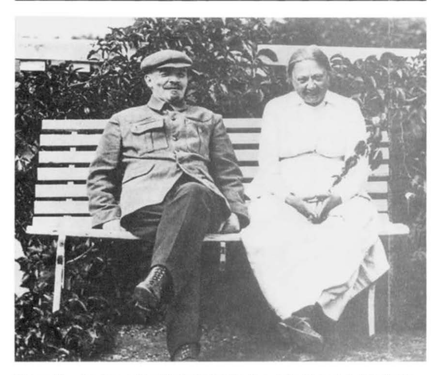
Figure 2. Lenin and Krupskaia in the Garden at Gorki (undated, probably 1922)

This private country estate, which was named Gorki in the nineteenth century long before the writer Maxim Gorky adopted his pseudonym, was nationalized in 1918 and turned into a museum ("Lenin's Gorki") in 1938.