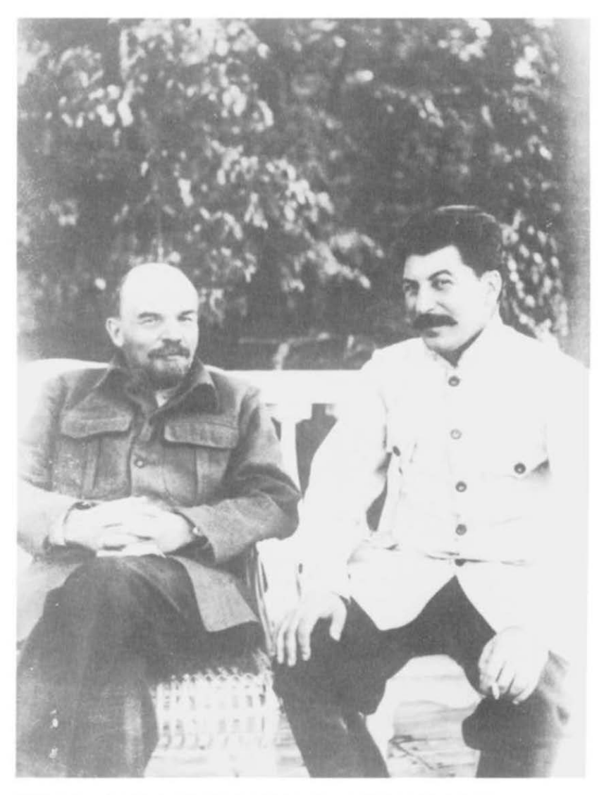
Figure 5. Lenin and Stalin in the Garden at Gorki, March 1923

Despite their stormy relationship, Stalin continued to visit Lenin until the former leader lost the ability to communicate. This picture was presumably taken to demonstrate their close friendship. That very month, Lenin threatened to break off all relations with Stalin if Stalin did not apologize for insulting Krupskaia, Lenin's wife.