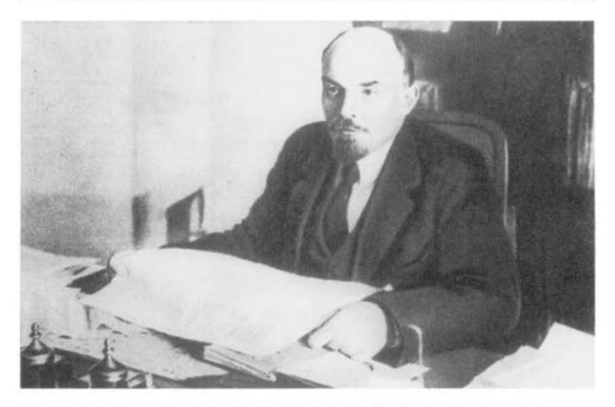
Figure 4. Lenin Holding a Copy of Pravda in His Study, October 1918 Lenin in his study holding the chief party newspaper, Pravda . Lenin used Pravda , the official organ of the Central Committee of the Bolshevik Party, to impart his views and shape policy.