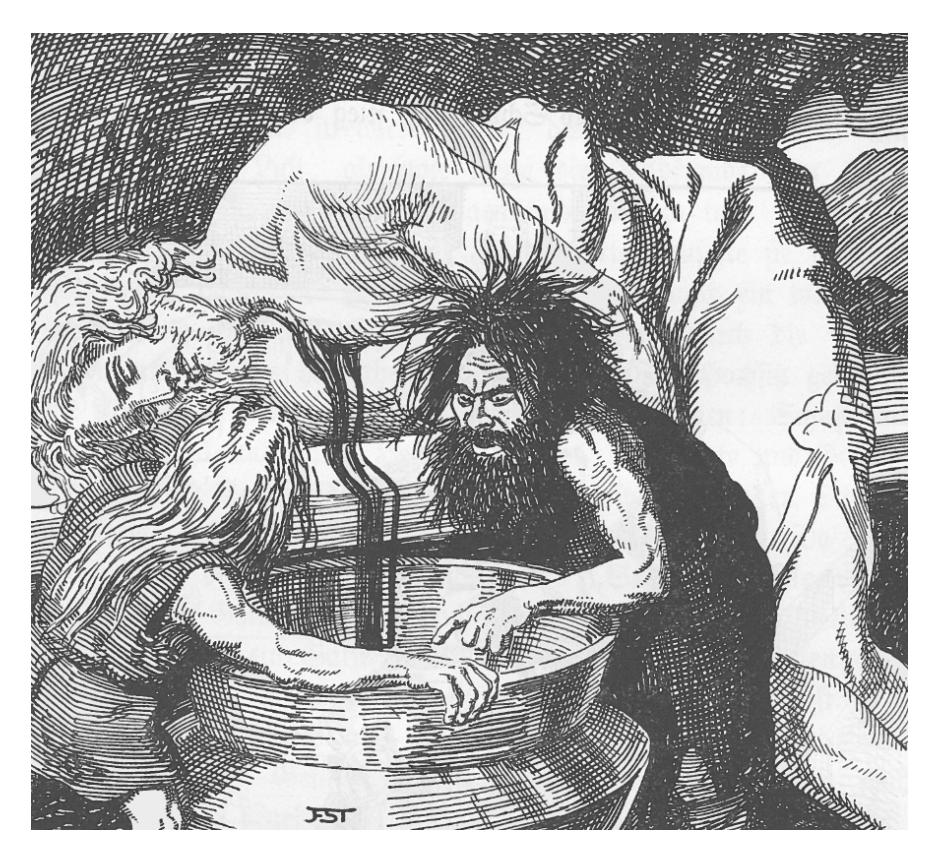
Figure 3.1: The dwarves collect Kvasir's blood to make mead. No medieval images of the myth survive. From Franz Stassen's illustrations to Die Edda: Germanische Götter- und Heldensagen by Hans von Wolzogen (1920). The resemblance between the dark-haired dwarf and classic antisemitic imagery may not be accidental. Stassen was later a member of the NSDAP and favoured by Adolf Hitler. This image also bears a striking resemblance to the depiction of Jews collecting William of Norwich's blood, found on the rood screen at Loddon Church. Public domain.

heart from my trunk, who has killed my only friend, [and] I presume has also eaten him).