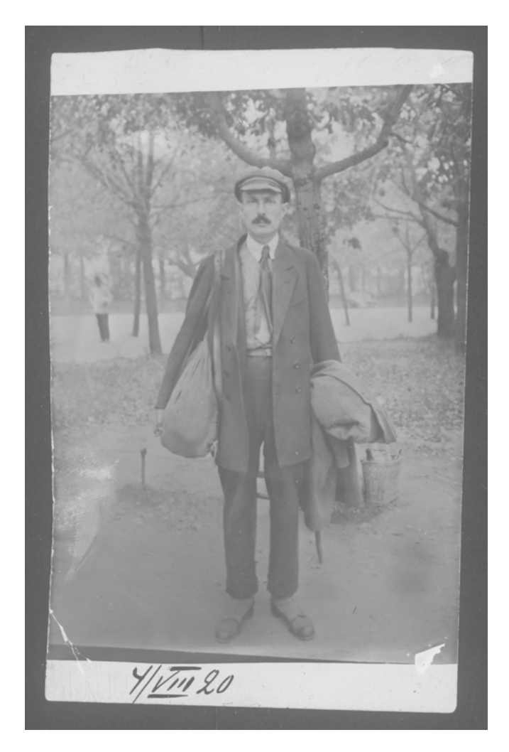
Figure 7.1: Santeri Jacobsson, a civil rights activist and a writer of the book Taistelu ihmisoi keuksista , the first publication to describe the antisemitic ideas present in Finland.

in 1942 led to a suspicion that when it came to antisemitism, Finland was not so exceptional.