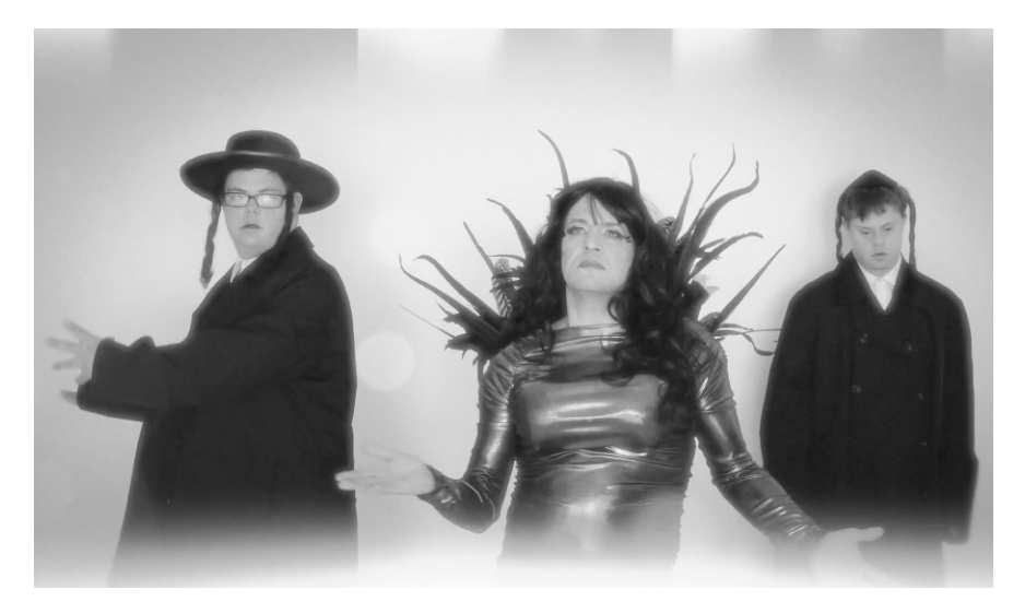
Figure 4.2: Still from the music video "Hatikvah" by Icelandic artist Snorri Ásmundsson, published on youtube.com in 2014: < https://www.youtube.com/user/snorriasmunds >. Public domain.

mundsson, the video is a protest against Israel's treatment of Palestinians. In it, the artist wears drag – a tight-fitting metallic dress, lipstick, and eve shadow – as a reference to Dana International, the transgender Israeli who won the Eurovision song contest in 1998, and sings the Israeli national anthem alongside two other adult performers in a very degrading manner. Somewhat spasmodically and with little grace they dance to the anthem with accompanying animated gestures and grimaces. One of those in the video is meant to be an Israeli soldier and a female participant is dressed as a Muslim woman who is attacked by the soldier at the beginning of the video; for the rest of the film she dances dressed in a cowgirl outfit. In addition to these characters, there are two young men with Down syndrome performing, dressed in large black overcoats and hats and with stuck-on sidelocks ( pevot ) in order to represent Hasidic Jews.<sup>72</sup> In an article in the English-language weekly Icelandic Grapevine , Ásmundsson explained what he wanted to achieve with his video. In addition, he described how he avoided being accused of and prosecuted for antisemitism under Icelandic law. Ásmundsson employed the frequently used alibi that he has Jewish friends: "Snorri added that he realized his artwork was highly controver-