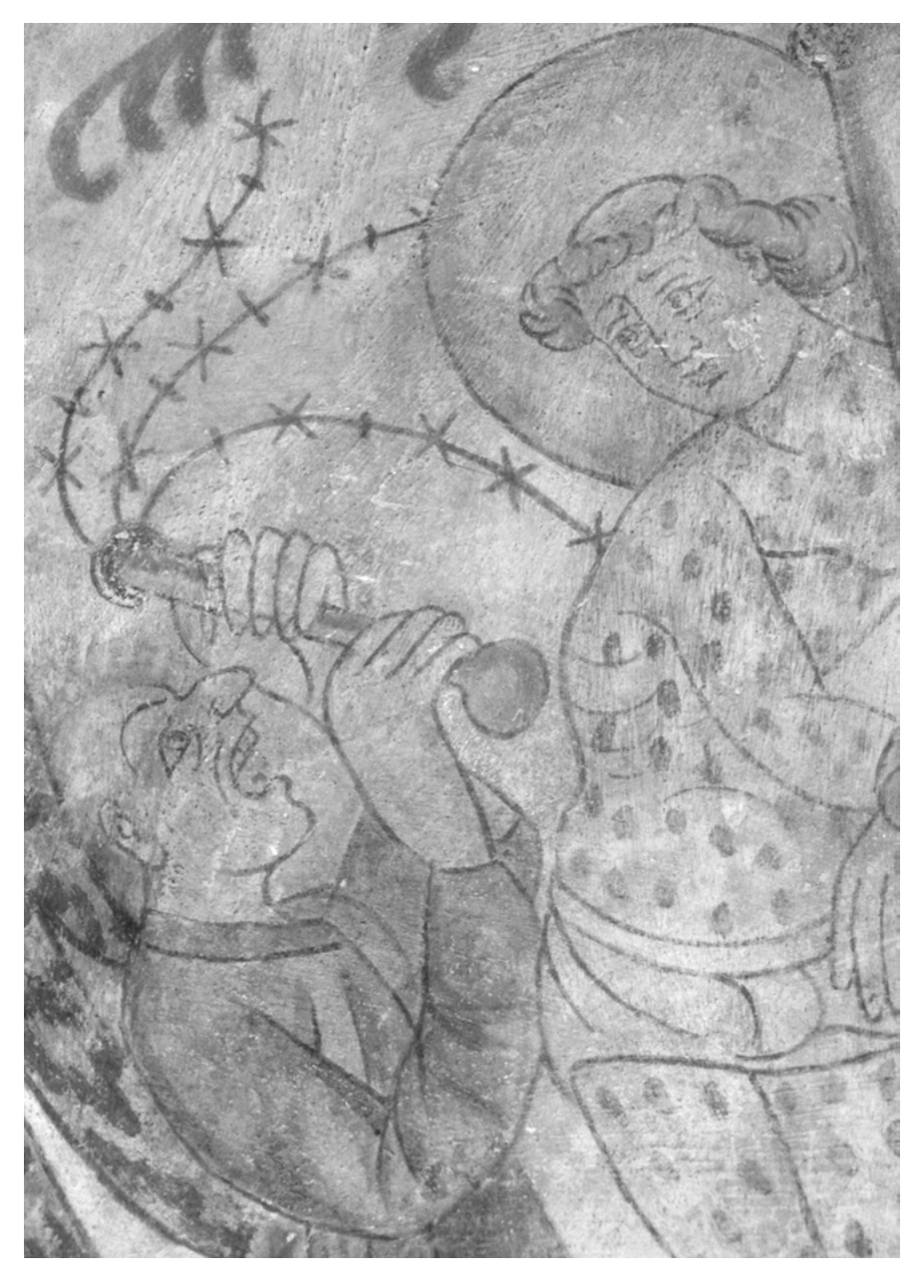
Figure 2.1: A Jew scourges Jesus. Over Dråby Church, Roskilde, Denmark. 1460–80.