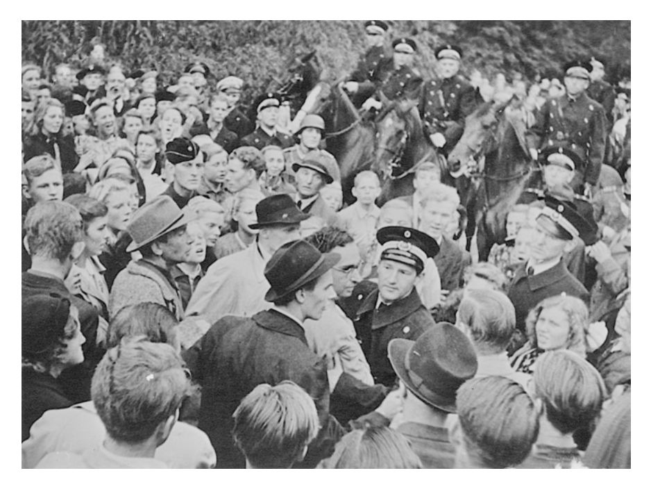
Figure 6.1: During the German occupation of Denmark 1940–45, Danish police protect a young man who is harassed by National Socialists (The Museum of Danish Resistance). Public domain.

dangerous informant culture among the radical antisemites in the NSAP/Danish Anti-Jewish League ( Dansk Antijødisk Liga ) and the slippery slope between anti-Judaism and antisemitism in the Nazi-inspired party, the Danish People's Community ( Dansk Folkefællesskab ). In addition, the Danish reception and publication history of the antisemitic classics – most prominently The Protocols of the Elders of Zion – has been recounted,<sup>14</sup> whereas the personal paths leading to an antisemitic worldview have been explored in biographies of the author Olga Eggers, the leader of the Danish Anti-Jewish League Aage H. Andersen, and the commander of the Danish SS corps C. F. von Schalburg.<sup>15</sup> Whereas the