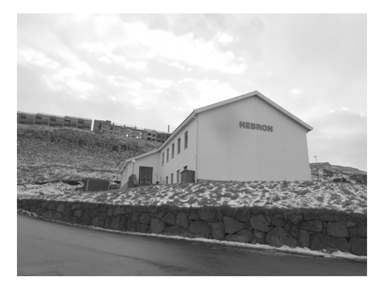
Figure 11.2: Hebron is a small Plymouth Brethren congregation in Argir, just outside the capital Tórshavn, which started its activities in the 1930s. The "new" Hebron (depicted above) opened its doors in 1992.

Brethren or other denominations) in villages and towns. On several occasions, Jewish religious and political dignitaries visiting the Faroes, for instance Yitzhak Eldan (in spring 2001), then Israeli ambassador to Denmark, have talked about the "Israel-friendly" Faroe Islands, alluding to less friendly (or even hostile) neighbouring Scandinavian countries voicing criticisms about Israeli policies.<sup>20</sup> Faroe Islanders supporting the Scandinavian countries' relatively critical standpoints towards Israeli policies (usually regarding the situation of the Palestinian population) often keep silent in order not to enrage pro-Israel religious communities and their political allies in the Faroes. Actually, most Faroe Islanders seem to be more interested in the cultural history and geography of Christianity than in what takes place in the Knesset in twenty-first-century Israel. This reflects the past/present/future temporal dimension – and its boundaries – in the presentation of Jews and Israeli in Faroese narratives and discourse.