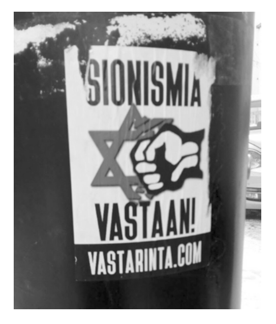
Figure 7.2: Old imagery in modern times: Sionismia vastaan – Against Zionism . This poster appeared on a litter bin in the city of Kajaani in the beginning of February 2018.

Today, the history of the interwar period and wartime far-right political movements, the development of Finnish-German relations, and subjects like Antisemitism or Holocaust Studies regarding Finland still constitute an understudied field. These subjects nevertheless continue to attract the attention of both scholars and the reading public. The writers of this survey are all carrying out new