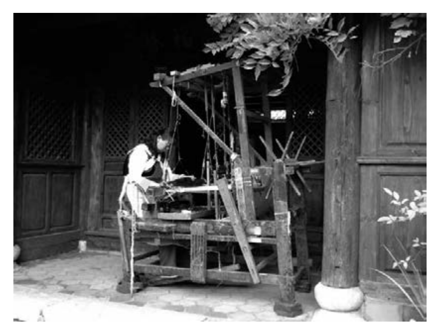
Figure 2.5 One of the courtyards displaying traditional cloth sewing