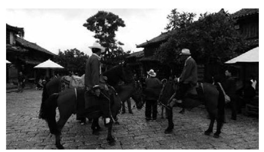
Figure 2.3 New Sifang Square with horse riding for tourists