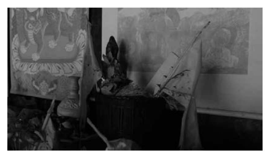
Figure 3.6 The Su basket used by Dongba Fuhua during wedding rituals