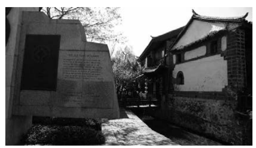
Figure 2.1 The World Heritage emblem in the Old Town of Lijiang