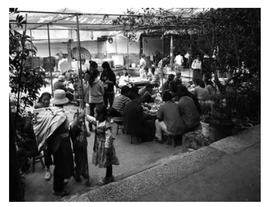
Figure 3.2 A local Naxi wedding ceremony in Lijiang