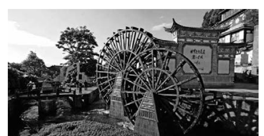
Figure 2.2 The newly built entrance to the Old Town of Lijiang