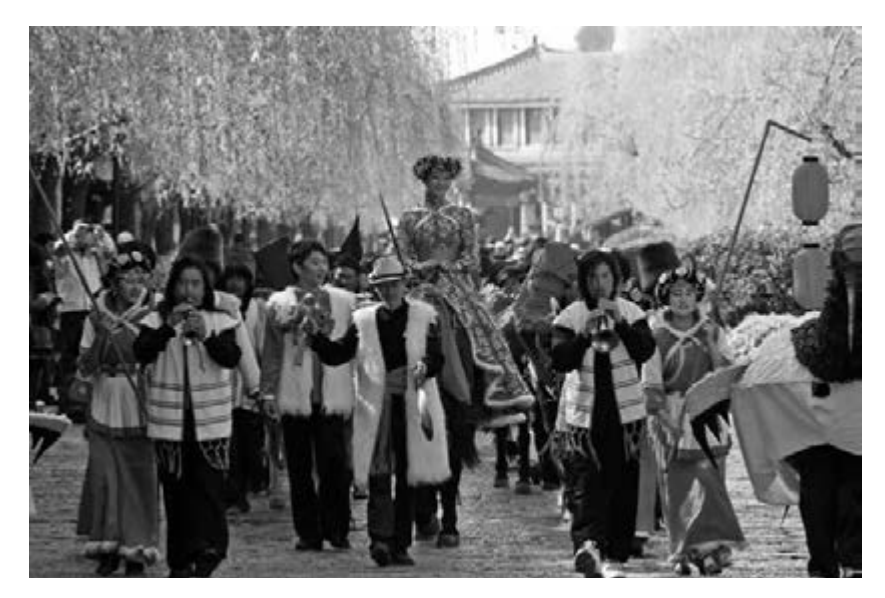
Figure 4.3 The promotional photo about the wedding ceremony