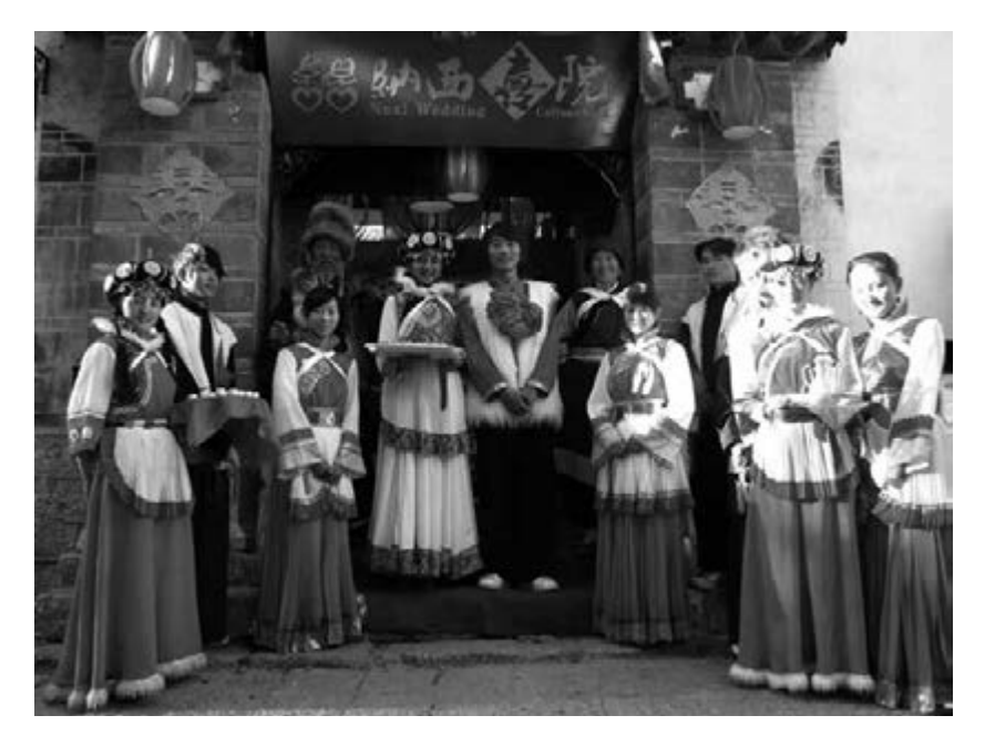
Figure 4.1 The local actors at the Naxi Wedding Courtyard