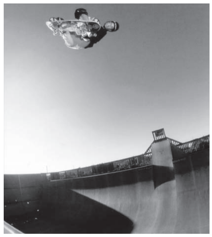
Tony Hawk on a half pipe in ESPN's Ultimate X: The Movie (2002), a celebration of The X Games. His athleticism is clear, as is the epic nature of the depiction.

culture had always had a contradictory stance vis-à-vis mainstream sporting culture. For skateboarding specifically, the mainstream press made it clear that despite its success in the wake of The X Games and an Olympic showcase, "skateboarding has not entirely shed its underground image, which might explain its attraction to teenagers. . . . It may be the only sport in which participants can get arrested."<sup>215</sup>