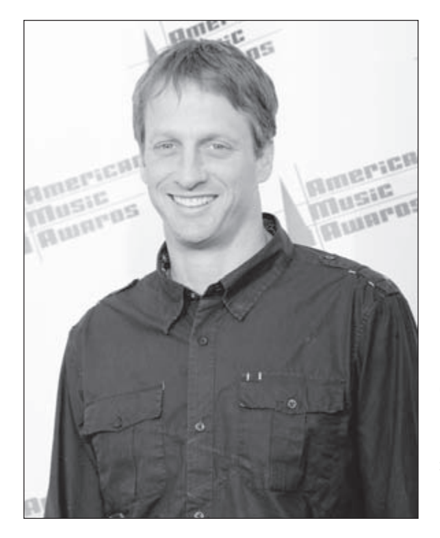
Tony Hawk, professional skateboarder, all-American family man, and the height of mainstream cool.

and citizens routinely voice concerns about skateboarders' safety,<sup>36</sup> pedestrians' safety in the path of skateboarders,<sup>37</sup> and skateboarders' destruction of public space and disruption of civil society (e.g., through vulgar language, loud and rowdy behavior, the destruction of property via both the practice of skateboarding and graffiti, and general disrespect toward elders).<sup>38</sup> While marketers celebrate teenage boys' spending power and the cultural appeal of skateboarding, parents, teachers, local politicians, and law enforcement officers sometimes revile these practices in their own locales and dismiss teenage boys' behavior as immature and irresponsible.