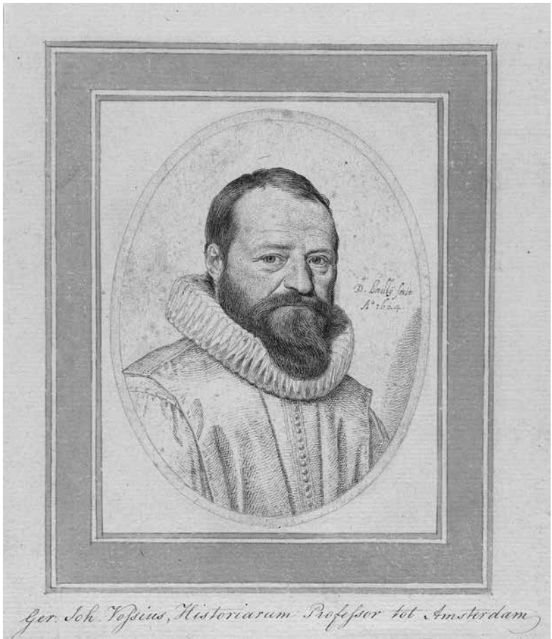
Portrait of Gerard Vossius by David Bailly, 1624. Rijksmuseum, Amsterdam