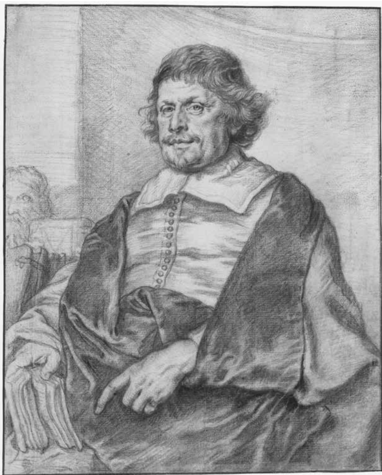
Portrait of Caspar Barlaeus by Joachim von Sandrart, made between 1637 and 1643. Rijksmuseum, Amsterdam