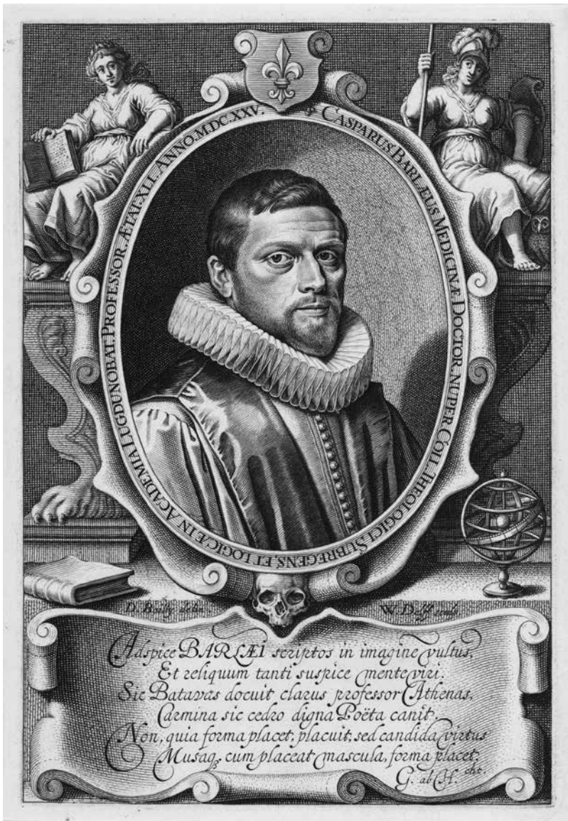
Portrait of Caspar Barlaeus in 1625, by Willem Jacobsz Delff. Rijksmuseum, Amsterdam