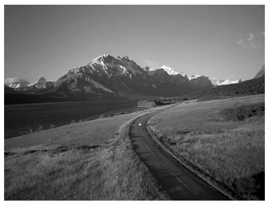
Figure 4.1. The Shining. The unattributable shot suggests something following Jack.

trails off the road, flying over the cliffs as we hear extra-diegetic dissonant sounds of a human voice. As such, the opening images of the film and haunting score are composed with unusual emphasis in order to evoke the notion that "some others exist"—that a gaze not identified with a specific observer lurks around Jack. The unsettling effect of the skulking aerial shots is reinforced by the film's blue rolling credits (often reserved for the end of a movie), suggesting, again, that The Shining is a circular narrative: the end is the beginning.<sup>22</sup>