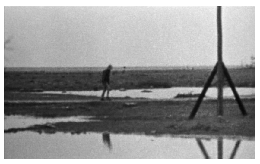
Figure 3.1. The Passion of Anna. The boundary between reality and the real begins to collapse.

falls to the ground as the grain of the film literally disintegrates him. The sound of timpani is heard, evoking the dead horse. As the film ends, the narrator states: "This time they called him Andreas Winkleman."