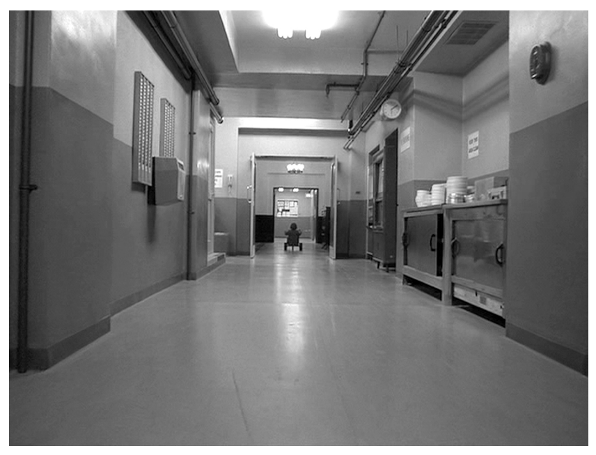
Figure 4.2. The Shining . The camera lingers far behind Danny to suggest something frighteningly unknowable.

states, "Point-of-view structure depends on there being no total view, no transcendental position from which an all would, if only in principle, come into view."<sup>23</sup> Kubrick's expressionistic movement of the Steadicam, wide-angle framing, and sinister soundtrack manifest the excess of the gaze. At the same time, the unattributable bearer of the look suggests the presence of others that exist in the Overlook. Danny's ability to manifest the past confirms what lurks in the corridors and may not just be his imagination. As I will explain in the final section of this chapter, exploring the reverse-angle shot offers a potential clue to uncovering the Overlook's ghostly dimension.