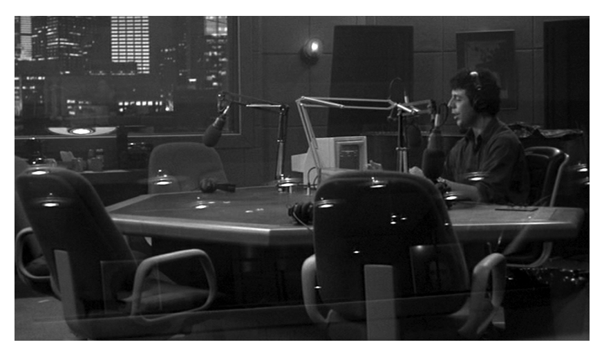
Figure 5.1. Talk Radio. The city looms as a figure of surveillance.

in which Barry is under surveillance by a looming, amorphous public eye. Because Barry stubbornly refuses to shy away from racist and dangerous callers, the confined setting of WGAB transforms into a space of deep uncertainty.