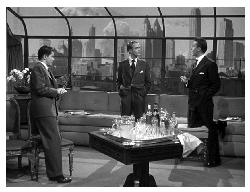
Figure 2.1. Rope. The large penthouse window and cityscape loom in the background.

the details of the cyclorama work in concert with Hitchcock's "real-time" narrative in order to follow Brandon and Phillip's command of space and concealment of the secret.