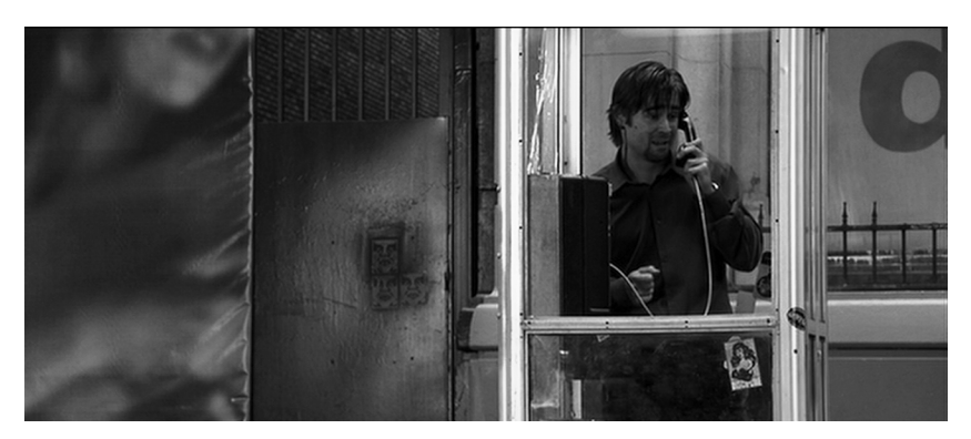
Figure 6.2. Phone Booth. OBEY Giant stickers loom in the background.

too much information as a cinema of excess, Schumacher, in a sense, is forcing the viewer to put on the glasses. As such, the film's exposure of excess explicates not only a dark dimension of the news media and celebrity gossip culture, but also the concern with mobile communication emerging at the turn of the millennium.