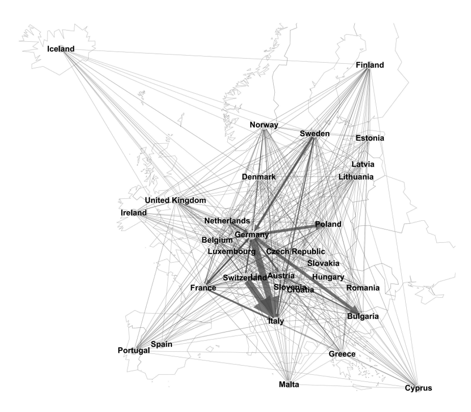
Figure 8.1 Dublin requests between EU Member States in 2015 (social network analysis)

This general pattern merits closer inspection. For this purpose, we refer to Table 8.1, which assembles various statistical measures identifying the internal