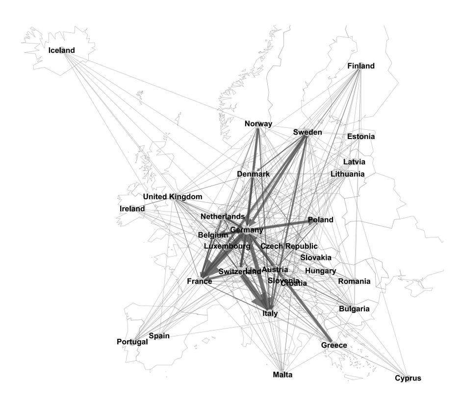
Figure 8.2 Dublin transfers between EU Member States in 2015 (social network analysis)

The picture does not change substantially when we move from Dublin requests to factual transfers, as shown in Figure 8.2 and Table 8.2. The most notable change relates to total numbers. While national administrations have exchanged Dublin requests in 1,537 cases – on average – with other countries in 2012, only one out of five cases led to a transfer (i.e. 295 cases on average) in the same year. In 2015, the number of requests increased to 2,486 cases, with only 330 transfers on average. However, the internal structure of the network is still very similar, as shown in Figure 8.2. For 2016, it is remarkable to see that the number of requests