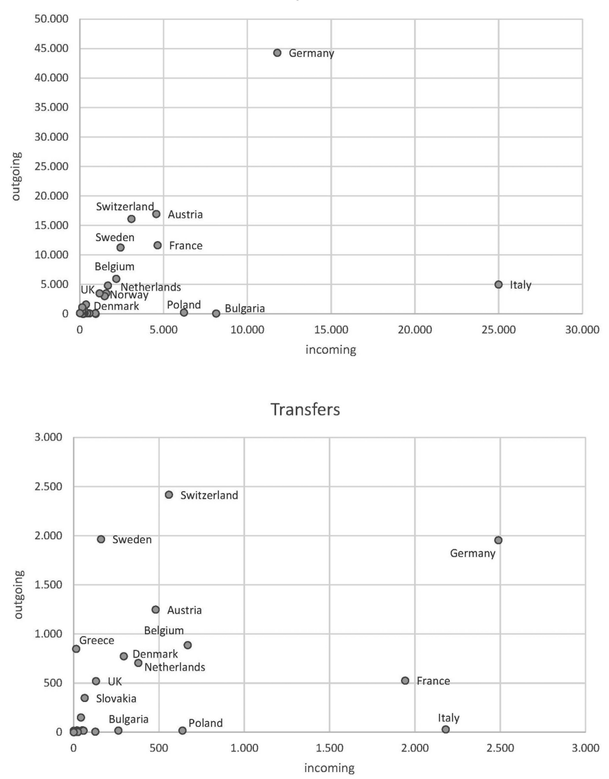
Figure 8.4 The number of Dublin requests/transfers per country (2015)

Note : Except those with missing data, all EU+ countries are included (i.e. in total 26 cases). Member States with fewer than 1,000 incoming Dublin requests without country label: top graph; countries with fewer than 100 outgoing Dublin transfers (plus Italy, Poland and Bulgaria) without data labels: bottom graph. The number of incoming transfers for Sweden (January–10 October) was taken from the AIDA country report 2015 (www.asylumineurope.org/sites/default/files/report-download/aida_se_update.iii_.pdf).