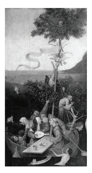
Fig. 1. Hieronymus Bosch, Ship of Fools (1490–1500)