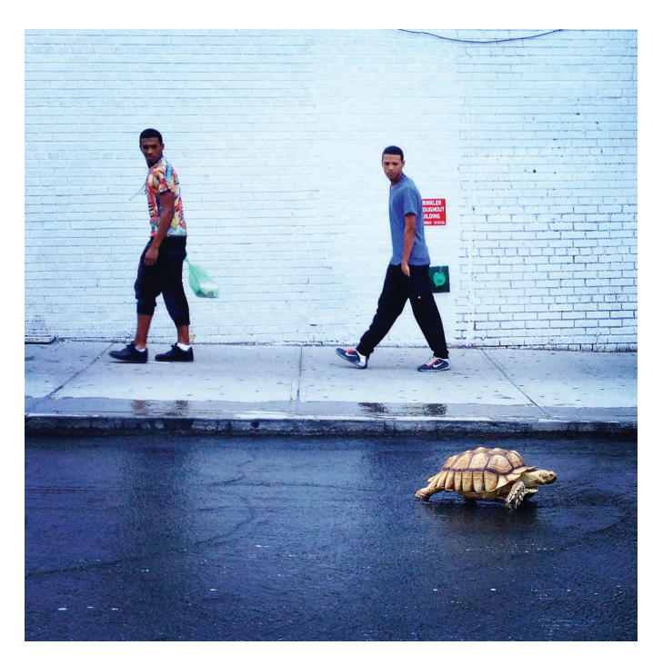
Figure 3. "Stratford Avenue," @ EverydayBronx (Instagram).

vibrant cultural life of the Bronx. Instead of the dissociation of struggle from representations of struggle, these cultural actors speak to aggrieved communities and not simply of their experiences. They ask, "what is your story" and engage in the work of collectively developing strategies to tell it. They create art collectively and question why they've been excluded from learning formally about art or learning how to think of themselves as art. They gain knowledge from community and at the same time keep learning how to see them, how to re-present them, and how to see them again.