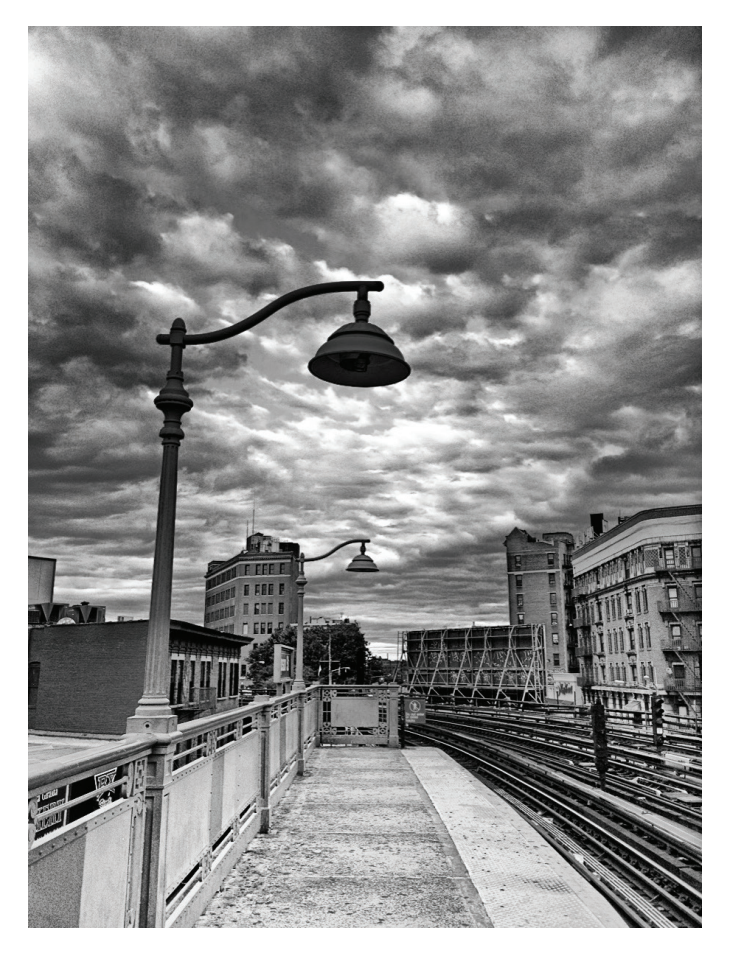
Figure 1. "The Storm Before the Calm." Simpson Street subway stop, the Bronx, New York.

formally trained, but self-taught and committed to the type of local documentation and expression the BDC promotes. In January 2016, sixteen members of the BPL formalized the Jerome Avenue Workers Project (jeromeaveworkers.com) to document and celebrate the workers and trades of people on Jerome Av-