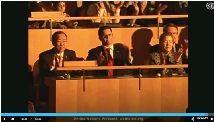
Fig. 11: Secretary-General Ban Ki-moon and General Assembly President Vuk Jeremić watch the Viva Vox Choir perform.

raised the issue again during the daily noon briefing by the Spokesperson for the Secretary-General, this time with specific reference to the fact that Ban was seen “applauding there” (“Daily Press Briefing”). On behalf of the Secretary-General, the spokesperson responded, “[w]e sincerely regret that people were offended by this song, which was not listed in the official programme. The Secretary-General obviously was not aware what the song was about or the use that has been made of it in the past” (“Daily Press Briefing”).