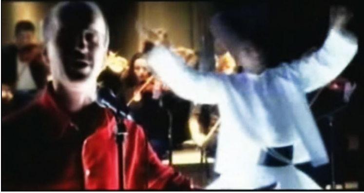
Fig. 3: Screenshot from the video of Sami Savni Özer's "Demedim Mi."