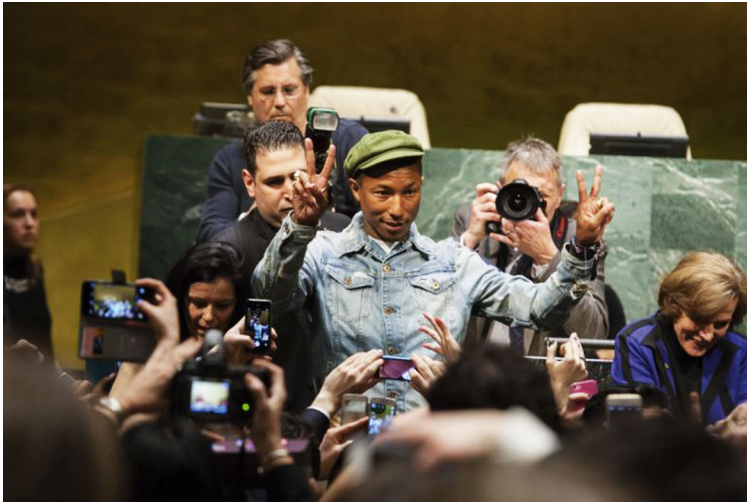
Fig. 10: Pharrell Williams at the General Assembly during the special event on the occasion of the International Day of Happiness.