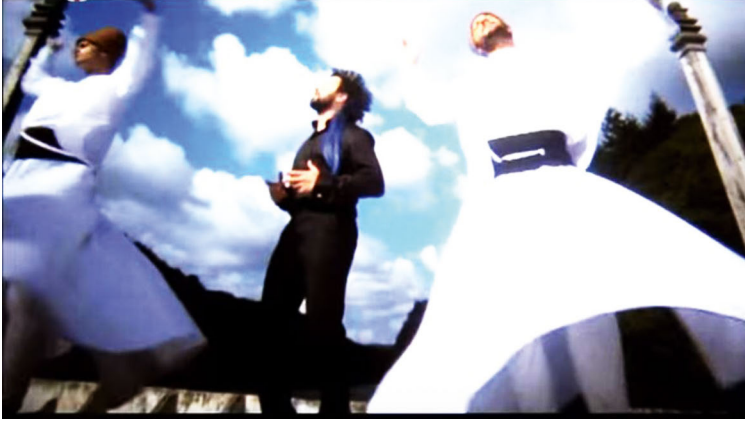
Fig. 4: A screenshot from the Hayko Cepkin episode of the Sufi Klipler project.

popularity. “Demedim Mi” was performed in almost every occasion possible, frequently with the accompaniment of whirling dervishes as reflected in the video, shown in figure 4. That the hymn was parodied in Selçuk Aydemir’s 2011 movie Çalgı Çengi (Musician and Dancer) testifies to its great popularity.