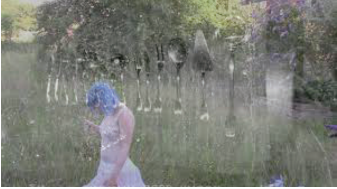
Figure 4. Deadly Landscapes. Still from The Luminol Reels .