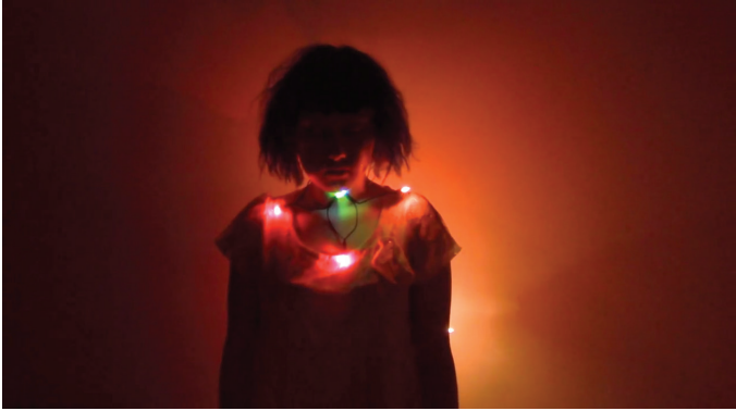
Figure 2. Queer Light. Still from The Luminol Reels .