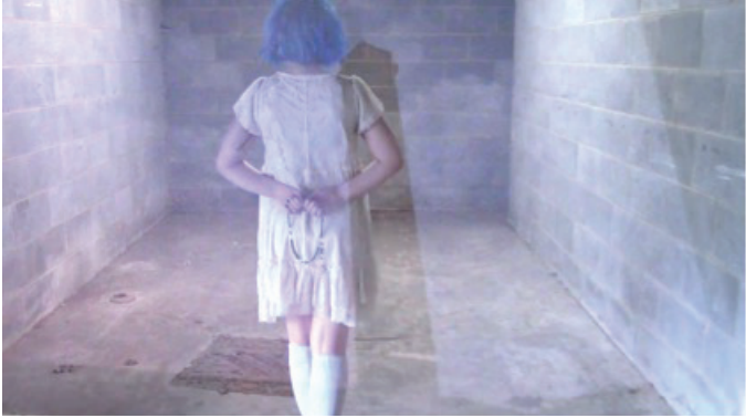
Figure 1. Girl in the basement. Still from The Luminol Reels .