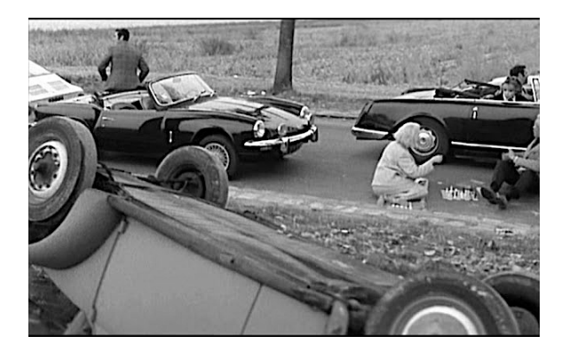
§ GLOBAL CAR CRASHES AND TRAFFIC JAMS / CHINA & THE NORTH PACIFIC GYRE

The plateau of the petro-citizen forms individuals and herds that consume and exist within the context of petro-politics, and this formation now extends around the globe (see Toscano 2010). One of the clearest consequences of this spread of the petro-citizen is the consumptive practices and growth of cars in China. The longest traffic jams in the world are now in Beijing. There are chthonic relationships between the ways in which the individuation of petro-politics forms citizens and the consumptive patterning and global consequences of these drives; and these should also be explored. One might say that the traffic jams in China represent a mode of organization that infiltrates the ways in which one might now conceive of freedom. The drives that one exhibits in order to consume and exist within