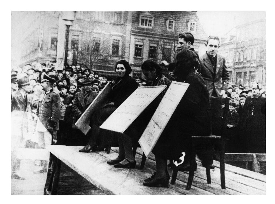
Figure 2 Public shaming of Jewish women in Linz, Austria, during the Kristallnacht , November 1938.

Roman spirit. For Nazis like Ernst Schönbauer, the oriental roots would have meant that the law would be racially impure (Riccobono 1925-6; Schönbauer 1939: 390-1).