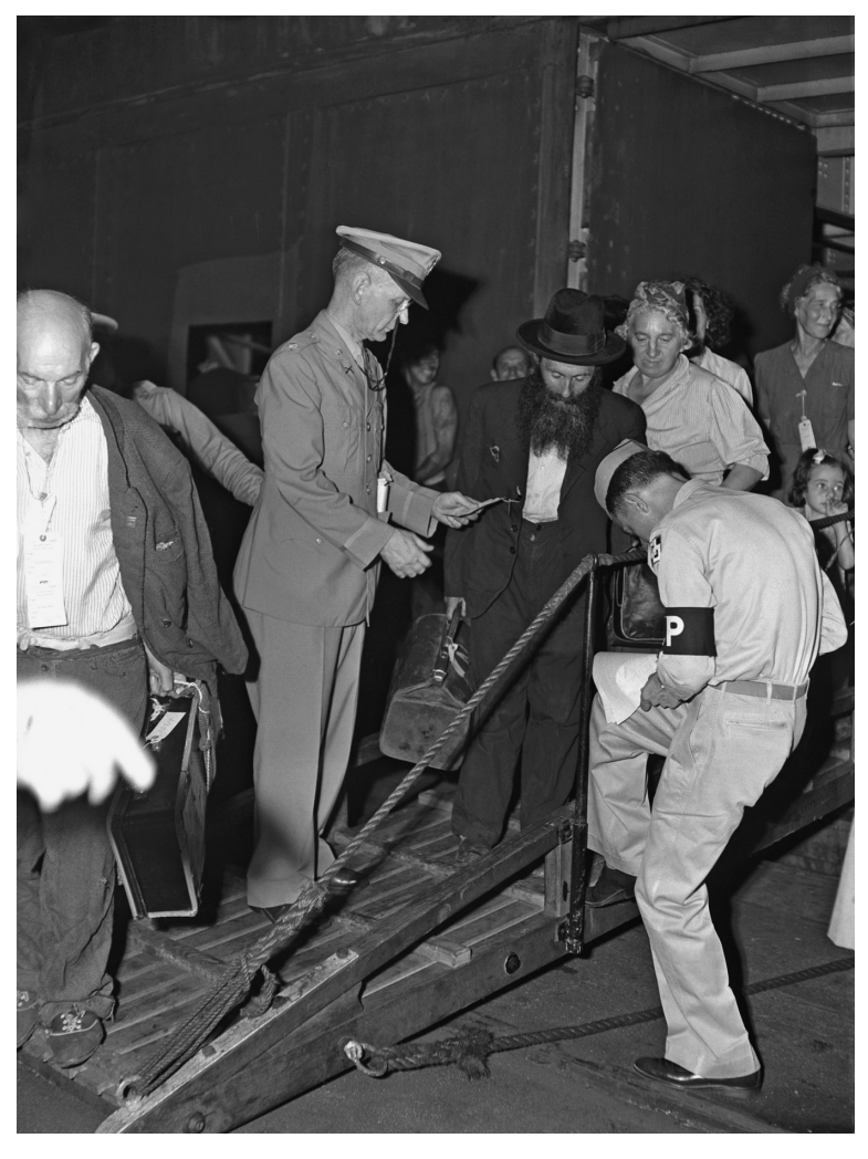
Figure 1 An immigration officer checks the names of refugees escaping Nazi persecution.

The emigration path of those who escaped led first to neighbouring countries – France, the Netherlands or Czechoslovakia. For instance, before reaching the United States, Hannah Arendt, after being arrested by Gestapo for helping her Marxist friends and colleagues, escaped to France, where she ended up being detained in the women's concentration camp in Gurs (Coser 1984: 191). For those wanting to escape Continental Europe, the route through Spain and Portugal was for a long time the only way to do so. In particular, those caught in southern France were forced to cross the Pyrenees to reach Lisbon. The United States admitted 1,300,000 persons, while 759,000 ended up in Latin America. The UK sheltered 80,000 refugees, while 55,000–60,000 emigrated to Palestine. Additionally, some 100 scholars found positions in Turkey, where Kemal