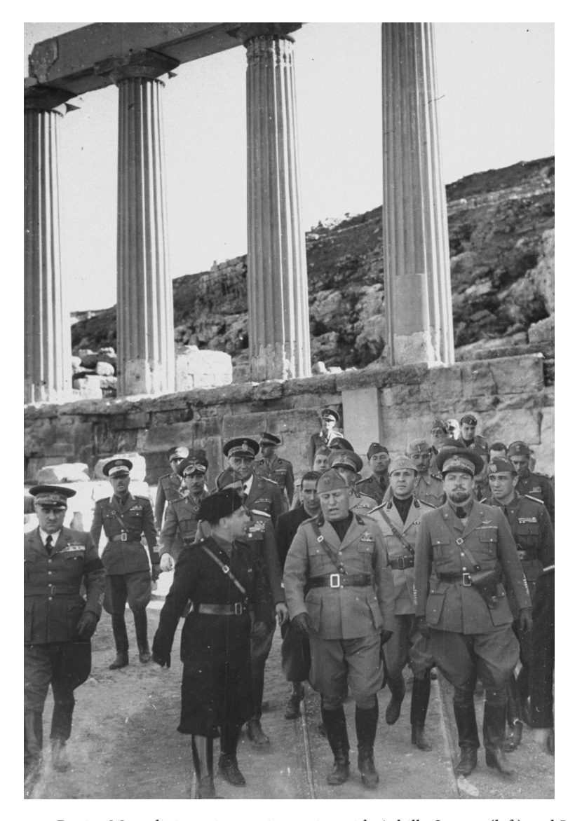
Figure 5 Benito Mussolini touring ancient ruins with Achille Starace (left) and Italo Balbo (right).

opponents aligned themselves with the expansionist policy that realized the old dream of an African Empire, reacting to the sanctions imposed by the League of Nations.<sup>17</sup> On 9 May 1936, the Duce triumphantly proclaimed from the balcony of Palazzo Venezia 'the reappearance of the empire over the fatal hills of Rome' (Giardina and Vouchez 2000: 250ff).<sup>18</sup> The highest point of political support for Mussolini corresponded to the climax of the rhetoric of the myth of Rome. While Vittorio Emanuele, the King of Italy,