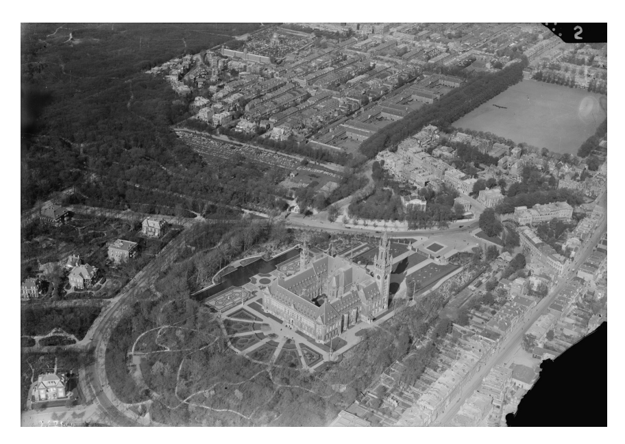
Figure 4 Aerial photograph of the Peace Palace in The Hague (opened in 1913, photo from 1920-40).

the Russian Empire. His international career was no less outstanding. In 1913, he was among the dignitaries who inaugurated the Hague Peace Palace, a crowning achievement of the field of legal scholarship he and his teachers had represented, and served as a judge in major disputes before the First World War broke out.<sup>3</sup>