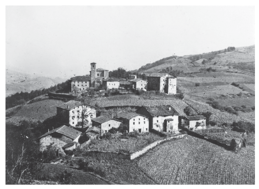
Figure 6.1 The village of Alkiza, 1945.

town hall, were sold to young families from San Sebastián within a short time. Also, two old buildings, located near the plaza, were bought, restored, and are now homes for couples with children. The rest of the houses were not built by a profit-seeking intermediary but by locals. These were villagers who would not inherit or had rejected their inheritance; they built on the family's farmland, so living near their aged parents, who were still tending the farm. Some features of these houses, such as size and style, as well as the fact that their inhabitants were employed in activities other than farming, make farmers identify them as kaletxeak, 'city housing'. But people from out of town who do not share the farmhouse culture usually describe the houses as chalets, or villas. The houses stand on an ambiguous space in the local map: the proximity of the family farmhouse, the fact that the inhabitants participate regularly in farming work, that they keep vegetable gardens, fruit orchards or crops for cattle feed in the same land make them not, in the strict sense of the word, kaletxeak or chalets. It is interesting that neighbours use the term etxea, house, to refer to one of these buildings. However, they always use baserria to refer to the farmhouse, and chalet or villa to refer to the houses built by real estate agents or construction companies to make a profit.