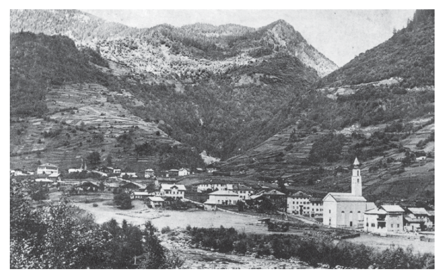
Figure 2.1 The 'cultural landscape' of the village of Caoria and its surroundings in the 1930s.