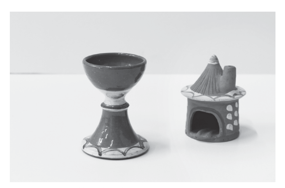
Figure 7.4 Souvenirs sold as traditional pottery.