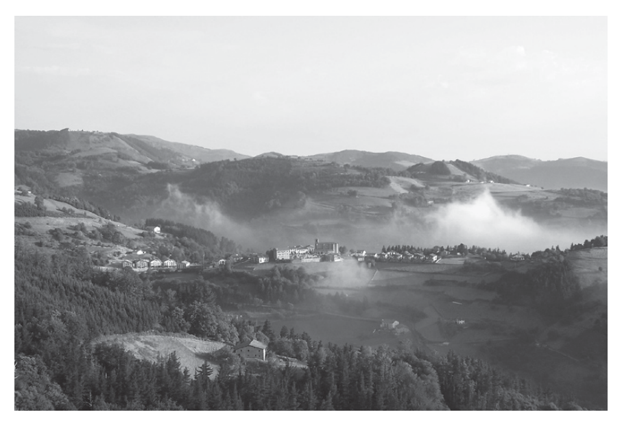
Figure 6.2 Alkiza, 2006.

the plaza. One cause was the rise of 'officially protected housing' promoted by the Basque government in line with an EU objective for rural development: to stop the gradual emigration from villages by giving locals incentives to remain in their hometowns. To that end, the Basque government, together with the rural municipalities, designed an intervention plan whose goal was to create affordable housing for locals. Alkiza participated successfully in this scheme: in 1998, two new buildings with a total of eight flats were finished; seven years later, sixteen flats in four recently completed buildings were allocated to young locals.