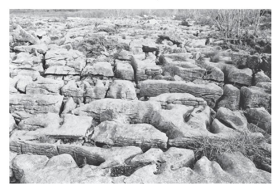
Figure 8.1 The Burren: karst limestone.

Be that as it may, many locals displayed great kindness to these newcomers in their midst. Many blows, when asked about their relations with their neighbours, will spontaneously and very happily list the unpaid labour that locals gave them to help rebuild their ramshackle houses, the tractors they were loaned, the furniture they were given, the repeated advice about farming that was freely offered, the parcels of food left out for them, the seemingly endless teas they were invited to, and so on. One said she and her partner need never have gone shopping in their first three years if they had accepted all the invitations made to them. Another cried when he recounted to me the thoughtfulness of his local postman: one day, several months after the arrival of he and his partner, the man knocked at their door with a big box of food. The blow suspects the postman knew the pair did not know many people. The following year, his French neighbour was still putting felt on his roof at the time his son was born. When, a few months later, the baby was kept in hospital because of whooping cough and poor home conditions, the postman offered to loan the blow a caravan and a radiator until he had fixed his house.