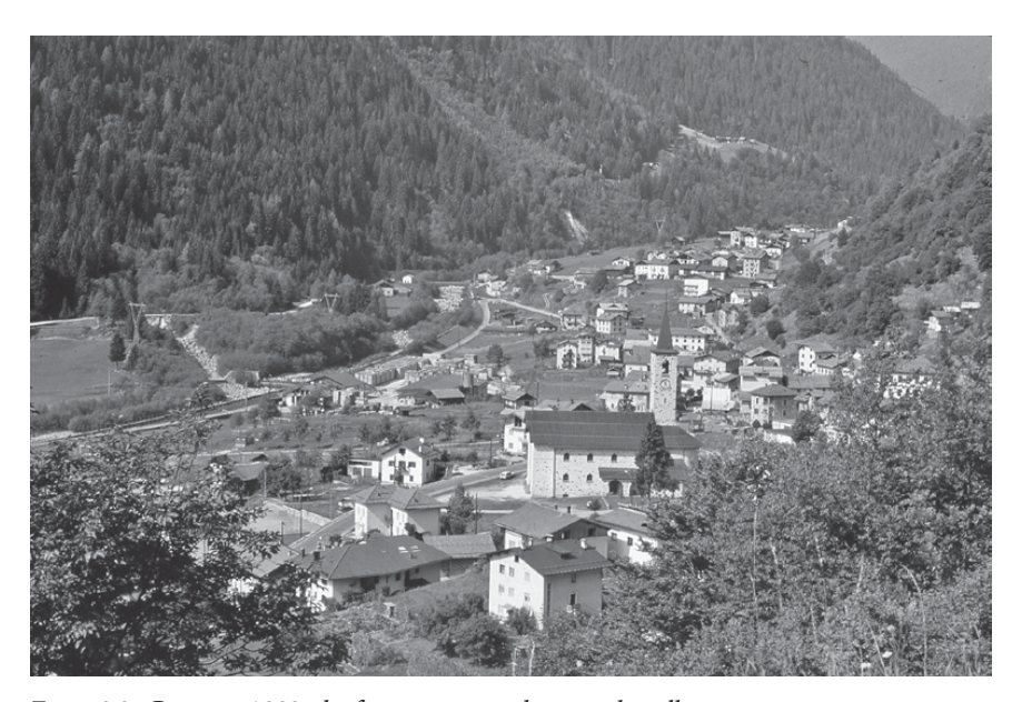
Figure 2.2 Caoria in 1992: the forest is encroaching on the village.