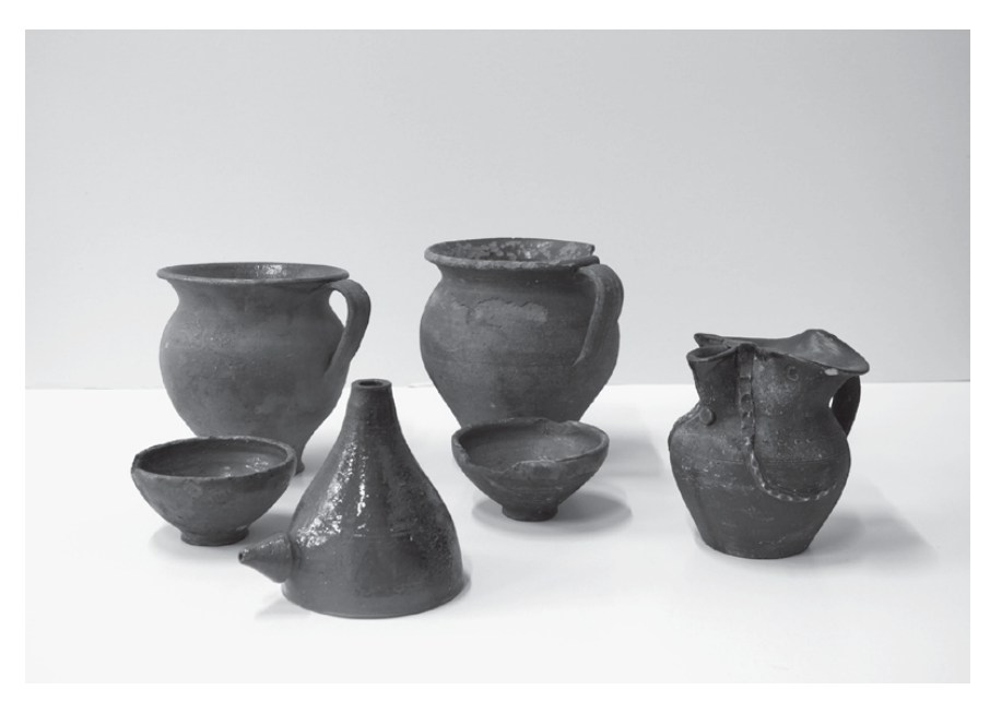
Figure 7.1 Pieces made before 1960, and a modern reproduction of an original shape (the breastmilk pump piece).

temperature, for at least two hours, during which the pieces turned reddish. From then on, the pace of firing decreased slowly, until the oven's heat was finally extinguished and the pots left to rest. This phase of production has been the one most subject to innovation: today potters use electric hermetic ovens with external temperature controls. Also, in order to apply the modern glazes, the firing has to proceed through two interrupted temporal sequences; something completely new compared to the ceramics made up until the 1960s.