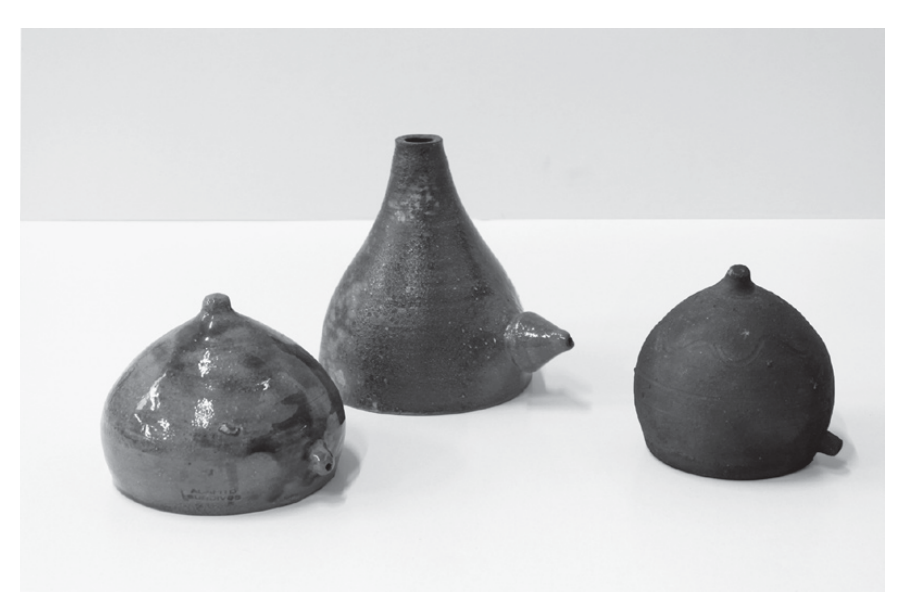
Figure 7.3 Diachronic evolution of a breastmilk pump piece (pezoeira).