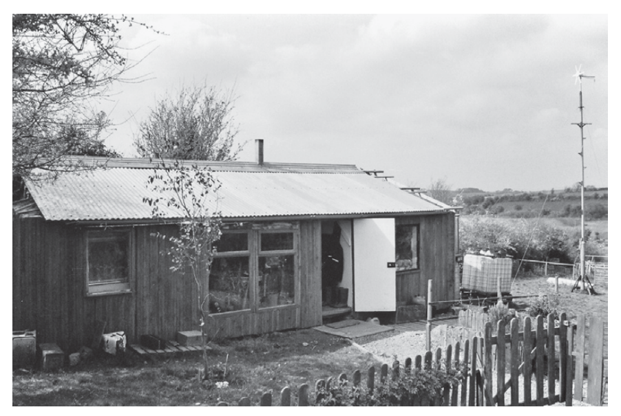
Figure 8.2 This blow-in's house has been built around the original caravan (just visible through the leftmost window).

cottaging business, giving the otherwise unconnected access to the Net. Teachers and parents of pupils at the school also revived or revitalised seasonal celebrations: in particular, they boast of transforming the town's St Patrick's Day parade into a very popular, lively event.