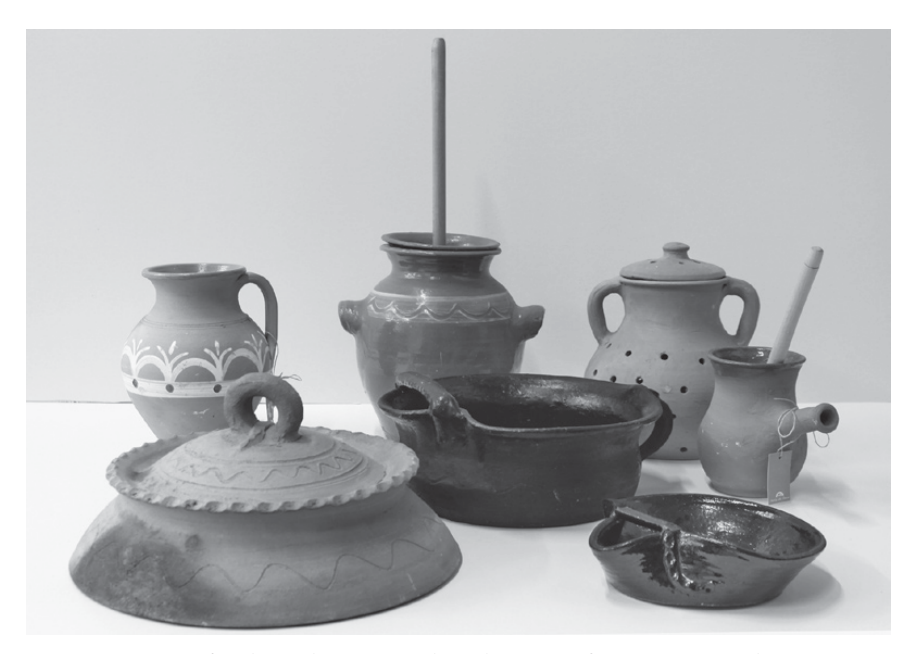
Figure 7.2 Pieces of traditional pottery made in the twenty-first century in Galicia.

and jobs for rural areas to replace the unviable primary-based economy. Of course, the limited economic scope of this measure, insufficient itself to replace the totality of the previous economic system, can be considered in some sense as the institutional Trojan horse, which comes accompanied by a series of parallel interventions of an ideological character.<sup>2</sup>