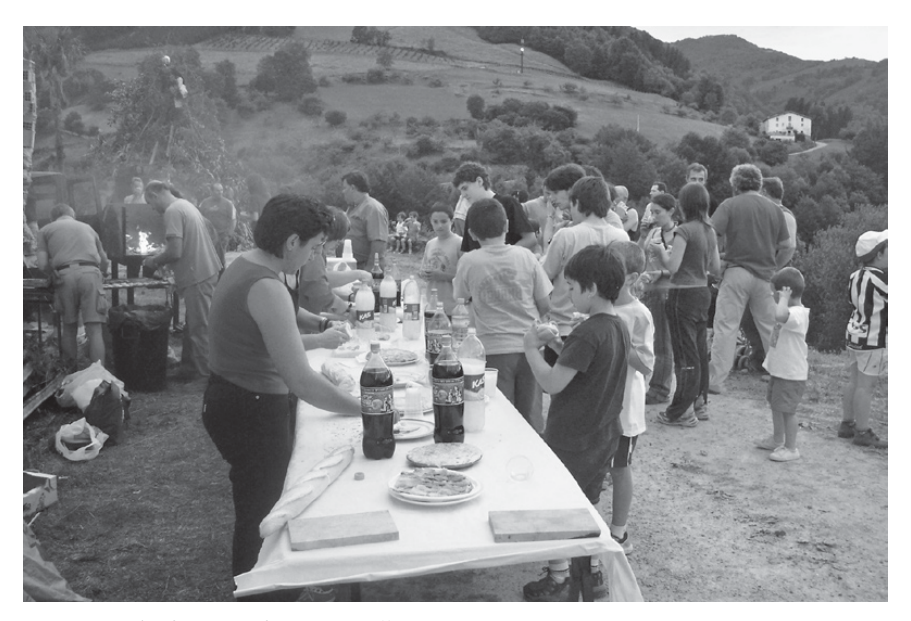
Figure 6.3 The festivity of San Juan, Alkiza, 2006.

For the last decades San Juan has been an invented festivity linked to school life in Alkiza. Those who take part display their links to their neighbours and the degree to which they are part of a socially constructed space. However, in contrast with the role it played in the 1980s and before, in the late 1990s the school did not act as a space of cultural and social integration for newcomers. Rather, it became an institution immersed in controversy, and the source of social division among residents. It happened that some people started questioning whether a rural school really possessed the educational requirements to prepare children to continue their education in an urban centre and among urban teenagers. In addition, in the early 2000s, a violent incident between young children led two local families to withdraw their children from the school. As a result, members of the gurasoen elkartea can see that withdrawing their children from this very small school is a threat to its very existence. They also believe that taking children out of school is a disloyalty to the community spirit which should surround the local school.