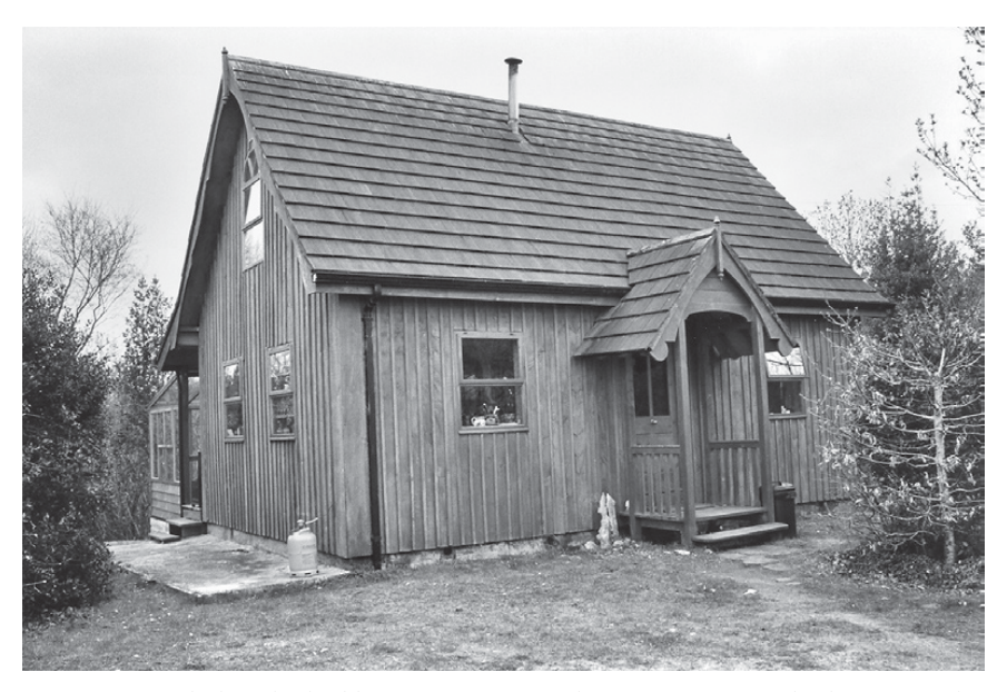
Figure 1.2 Locals thought this blow-in carpenter 'mad' to construct a wooden house in such a gale-swept area as County Clare, west Ireland. More than a decade later, the house still stood, in good shape.