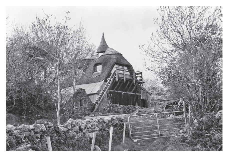
Figure 1.1 Fairy-tale turreted house, for a blow-in cheesemaker, County Clare, west Ireland.