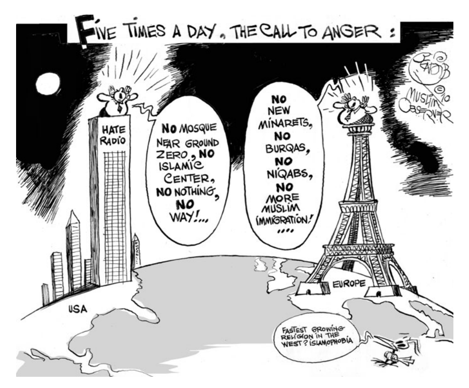
Figure 1.1 Five times a day, the call to anger. From Muslim Observer, 2 September 2010 © Khalil Bendib, all rights reserved.

individuals, between collectivities, and between individuals and collectivities, of relationships of similarity and difference.