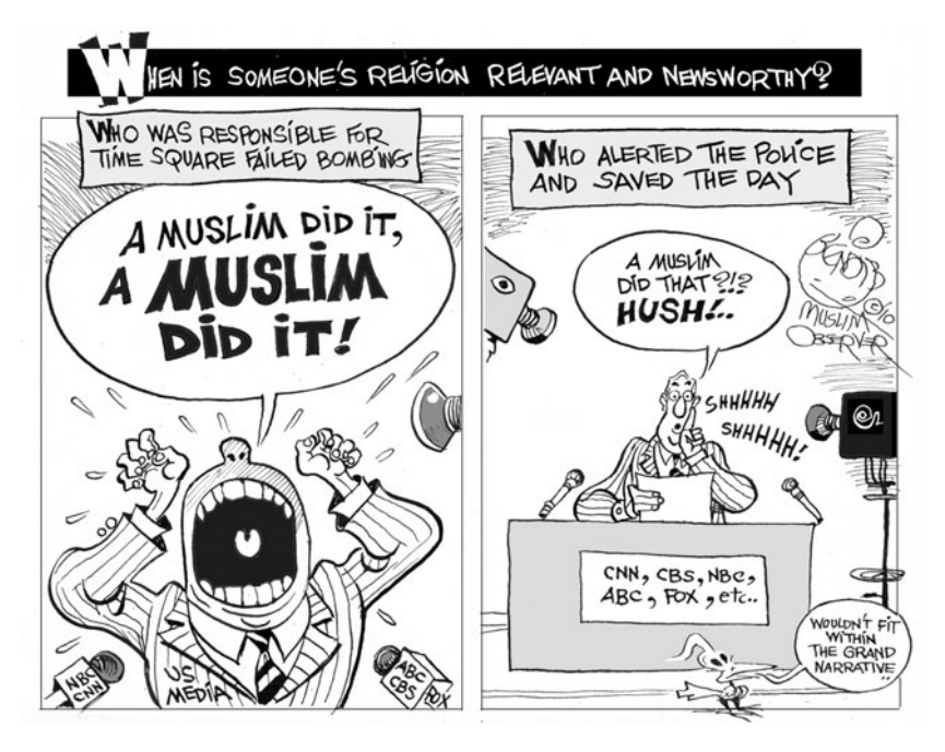
Figure 4.1 When is someone's religion relevant and newsworthy? From Muslim Observer, 16 May 2010 © Khalil Bendib, all rights reserved.

in Fort Hood and Umar Farouk Abdulmutallab, who allegedly attempted to blow up a flight as it approached Detroit in December 2009.<sup>64</sup> Overall, Time managed to generate fear among some readers as it published photographs of alleged and convicted terrorists (all bearing Muslim names), and mentioned that terrorist groups in Pakistan were working globally.<sup>65</sup>