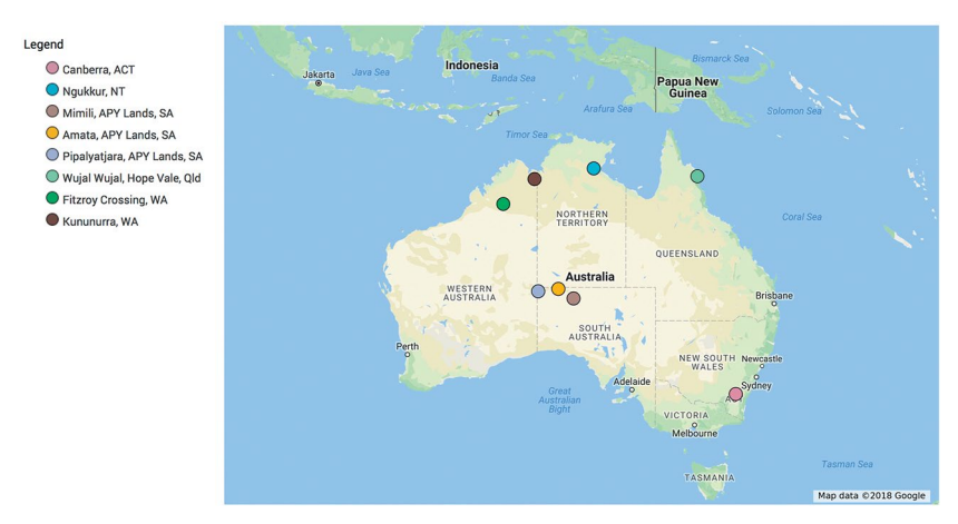
Figure 9.1: Remote tenancies case study communities

Across the case studies, a total of 144 tenant surveys, 138 tenant interviews, 37 housing provider interviews and 34 stakeholder interviews were undertaken (see Table 9.1).