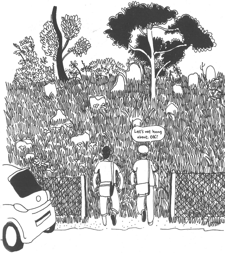
Figure 1. Nous n'irons pas voir Auschwitz , Jérémie Dres, éditions Cambourakis (2011), translated as We Won't Go and See Auschwitz , SelfMadeHero (2012): 129, reproduced with the kind permission of the author.

even impede a meaningful connection. Yet if we “don’t go and see Auschwitz,” what else do we see and how can we encounter the wartime past? In Nous n'irons pas voir Auschwitz , the comic book proves central to a third generation’s relationship to the Holocaust.