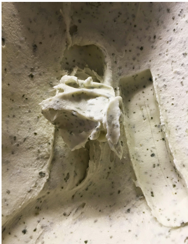
Figure 4 40

blurry condition within a postcolonial world. Learning how to eat ‘non-native’ ‘invasive’ plants introduces tastiness as a form of habituation. Like in the case of the