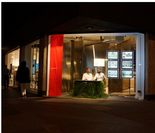
Figure 3 38

criminalises them has to support the redefinition of who does or does not belong and what is to be tasted.