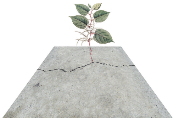
Figure 2 23

If, to follow the idea of objectivity according to science historians Lorraine Daston and Peter Galison, the botanical image is a clear means of production of truth. Eighteenth-century atlas illustrators had the authority to define what is the image of a plant; what is the perfect image of the plant. The ideal. The average. The normal. Goethe's Urpflanze . 24 But that image is so idealised that it actually does not exist, as it carries features of many specimens, put together in an impossibly true way to distribute certain kind of 'objective' knowledge. Botanical drawings traditionally overlapped different time cycles simultaneously, to represent growth and death, blossoming and decay, through the production of fictional images that tamed nature at a pictorial level.