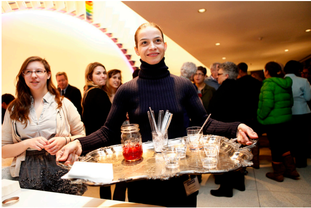
Ana Prvacki. The Greeting Committee , 2012 Performed by the artist for 'Feast: Radical Hospitality in Contemporary Art'. 7