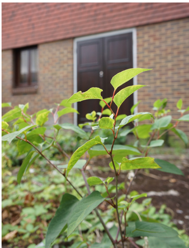
Figure 1 5

‘invasive’ as the media claim. 6 Indeed, the introduction of ‘non-native’ species has almost always increased the