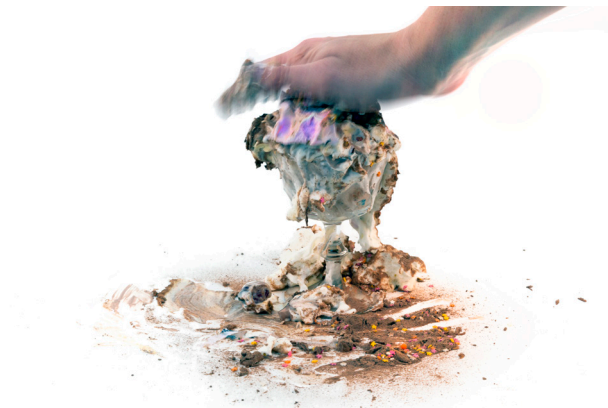
'Rock and Roll will never die' , Kit Poulson & Benjamin A Owen, 2018

Another way of looking at it is that it is simply a relief on a hot day. But what a construction to bring that comfort.