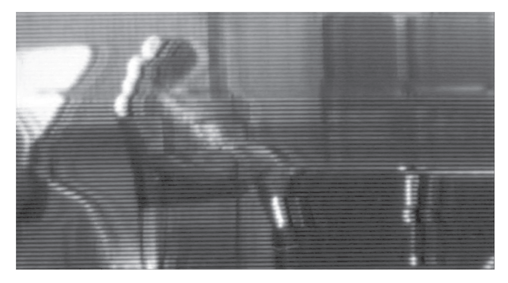
6.1: Blurry monitor feed from Una cierta verdad (2008), Evohé Films, S.L., Corporació Catalana de Mitjans Àudiovisuals, S.A. y Vértice Cine, S.L.

is sane when both are caught up in complicating social power struggles. In social reality, as with Cervantes's protagonists, both the patients and the providers in Una cierta verdad are well-matched counterparts: though it is possible for patients with severe impairments to suffer infrequent episodes of psychosis with consequences for themselves and for others, they seek the better quality of life they experience when not taking imprecisely dosed meds that force them into slumber.<sup>20</sup> Though some providers may have the best interests of patients at heart,<sup>21</sup> these frequently conflict with the best interests of society or of clinical practice, which prefers patient slumber and turns all too easily towards the use of brute force. These options are extreme ones, to be sure, but admitting that treatment for severe psychiatric illness must extend beyond the walls of the institution for those living in the community, contemporary clinical practice has struggled to find sustainable social solutions outside of this polarized conundrum. Beyond merely symbolizing social distance and hazy solutions, then, the decision to draw viewer attention to the monitor feed additionally signals that social and medical power only moves in one direction: the patient is the object of clinical observation, itself an imprecise instrument.