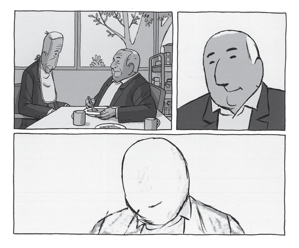
5.3: Iconic modulation from Arrugas (Roca, 2008), 96.