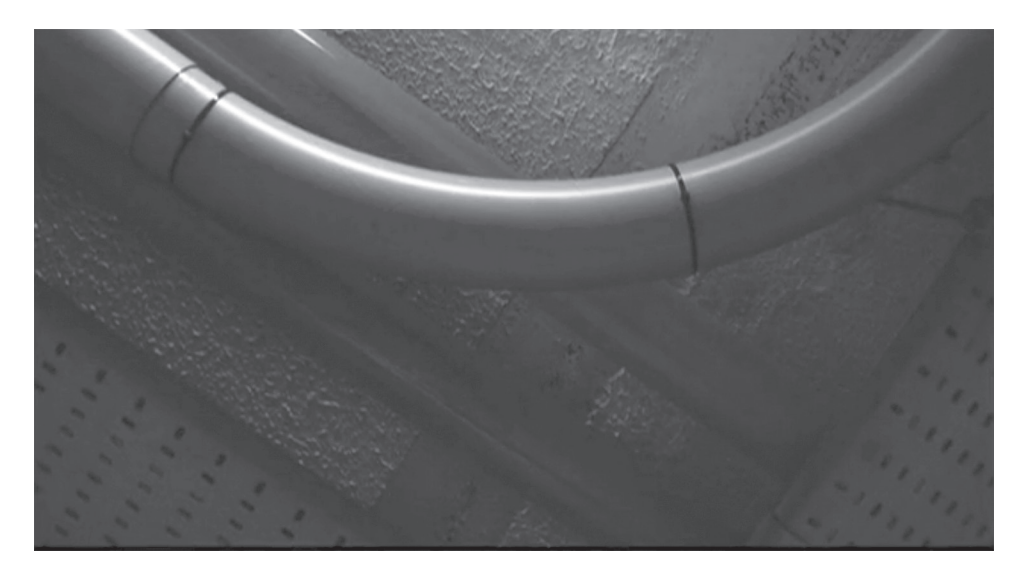
6.2: Tubing from Una cierta verdad (2008), Evohé Films, S.L., Corporació Catalana de Mitjans Àudiovisuals, S.A. y Vértice Cine, S.L.