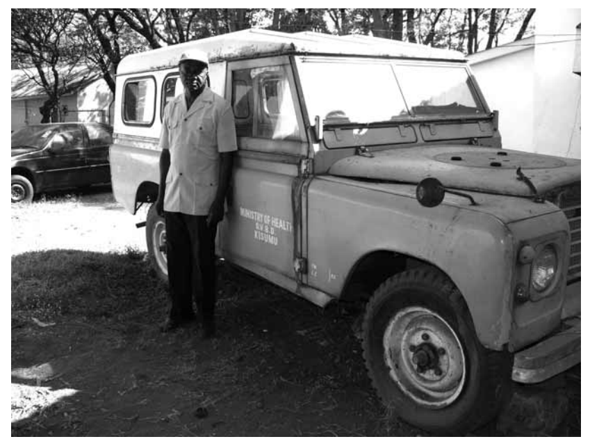
Figure 12.7: Portrait with 1982 Uniform and 1970s Land Rover (author's photograph).

claimed this DVBD virtue and praised 'British' punctuality, recalling the early morning parades, as well as dismissals due to minor delays during the early postcolonial period. And young as well as old cherished the uniforms that had been provided up to the early 1980s (Figures 12.6 and 12.7). The praise of self-discipline is common among older Kenyans, but fieldwork adds an edge to it. Exposed to the dangers of a hostile, remote and diseaseridden environment, 'field men', like soldiers, had to be enduring and punctual, fair, meticulous and self-controlled: