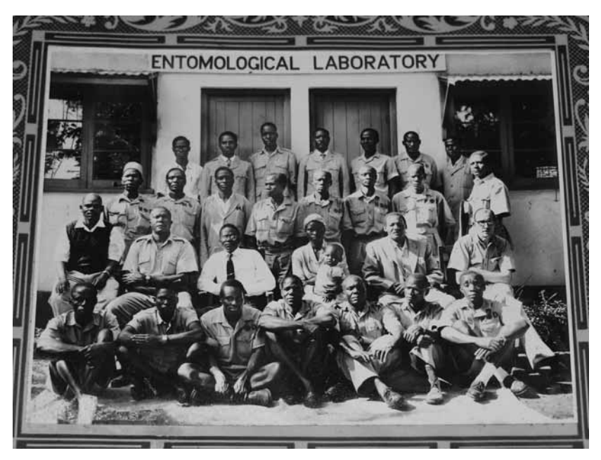
Figure 12.1: The Staff of DVBD Kisumu, Around 1962.

In this chapter I draw upon the life stories of a group of old men from western Kenya – born in the 1920s, recruited by DVBD in the 1940s and 1950s and retired from government service in the 1980s – whom we found