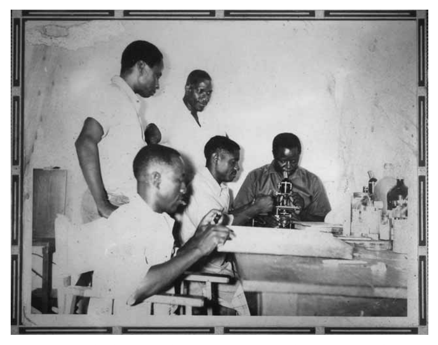
Figure 12.2: Technologists Bench Training in a DVBD Laboratory, 1960s.

Their rural homesteads, often built from concrete or brick, with painted tin roofs, screened verandas and half-high oil painted walls, citing modernist Kenyan architecture, are easily recognised among the more common mud-huts; they embody their owners' achievements in making modern Kenya, intertwining personal lives and scientific work, domestic growth and the development of the nation. Inside their houses, sofas and armchairs are covered with snow-white embroideries; glass shelves display books and decorative objects; calendars and clocks ornate the living room along with Christian mottos and family pictures, coloured ones of young people with academic gowns, cars and urban backgrounds, and some faded black and white ones of the DVBD's scientific work (Figures 12.1 and 12.2).