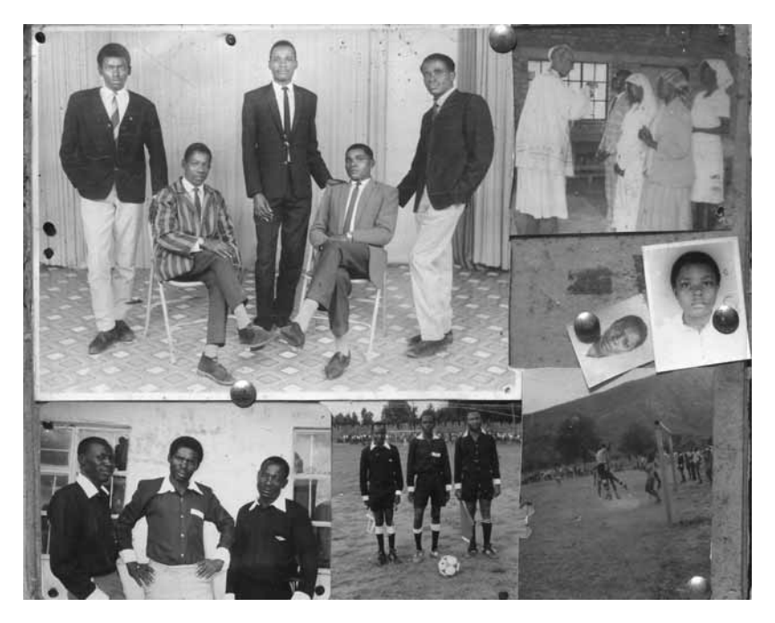
Figure 12.8: Plate with Mixed Photographs of DVBD Colleagues, 1960s and 1970s.

Crucial among these new relations were ties between older and younger men. Recruitment along kinship lines seems to have been so common that one old man lamented: 'There used to be a rule that one could bring one son [to be employed by DVBD], but these days, they have cheated us on that, too' (Sawe, 24 April 2005). More importantly, 'bench training' by older men (initially, British officers) was a mark of DVBD which even the youngest staff who had achieved academic certificates continued to praise as the source of DVBD men's superior expertise: 'In those days, people who were employed earlier and had been trained would sit down with us and show us [how things are done]. This made us know the work well from [down] there' (Ogalo, 24 June 2004).<sup>17</sup> This metaphor of growth was un-