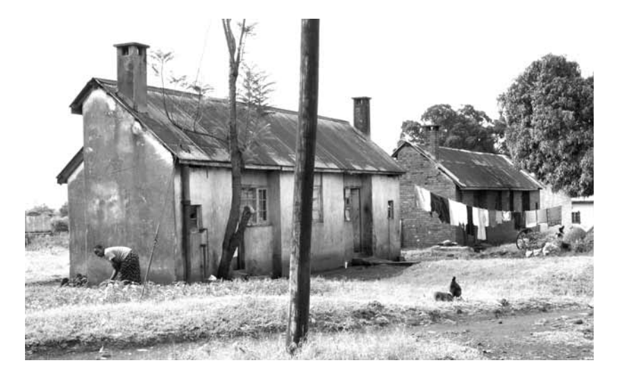
Figure 12.9: Urban Housing Estate in Shauri Moyo Kisumu Where DVBD Staff Lived With Their Families in the 1960s.

When they met, younger staff related to their professional genitors with respect and affection. They introduced them as 'fathers' and praised their achievements: 'he could identify mosquitoes by ear' (Staff Reunion, 12 December 2004). Due to the expanded educational opportunities after independence, generational respect and professional rank were sometimes at odds with each other. Thus, when we visited the home of one of the oldest staff, a former yellow fever inspector and lifelong DVBD man, accompanied by the retired Head of the DVBD – a generation younger, holding a UK doctorate and author on innumerable scientific papers – the