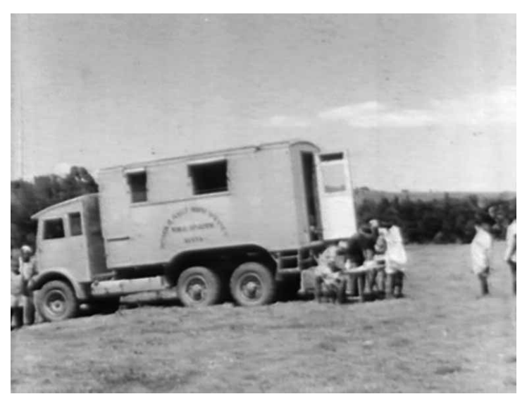
Figure 12.4: Mobile Laboratory, 1950s (from 'DDT vs. Malaria') (photographer unknown).

ing moves one right out into the field, yet the independent, mobile and nonlocal nature of tents, camp-beds and kerosene stoves marks a clear separation from the stable local environment. Camping creates a community of 'field men' who lead, in principle, a self-contained existence without relying on or relating to local communities. This positioning, close to reality but detached from it, is the idealised position of the scientific observer; in field life, the men's entire everyday embodied this stance.<sup>15</sup>