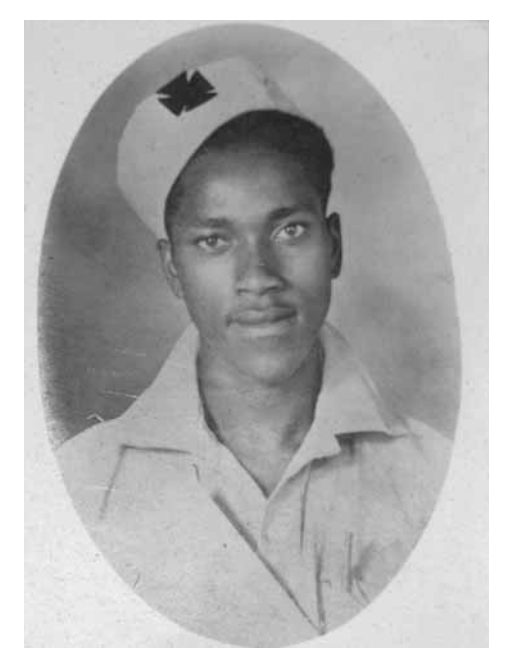
Figure 12.6: Portrait of 'Yellow Fever Inspector', 1941 (photographer unknown). (Personal archive John Nguriethi).

Education and Christianity were linked to self-discipline, and although the old men predictably lamented the youths' lack of it, even younger men