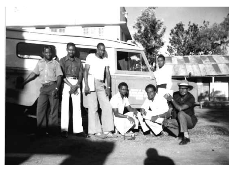
Figure 12.10: Younger DVBD Staff Members, Mid-1970s (photographer unknown) (personal archive, Ambrose Masime).