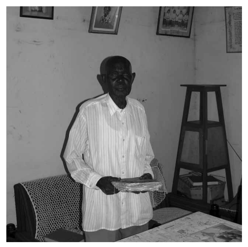
Figure 12.5: Portrait with 'The Mosquitoes of South Sudan'.

The men did not derive from the top layer of colonial rural life; unlike the progeny of the first Christian converts or of colonial chiefly families, many of their fathers had been pagans and none had been a chief. Indeed, they seemed to have pursued education and science in competition with wealthier Christian children, who from the 1940s onwards began entering clerical work and administration. Their childhood stories were full of hard-