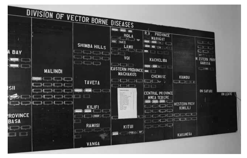
Figure 12.11: Organigram of the Entire DVBD Displayed at the Director's Office, DVBD HQ, Nairobi (author's photograph).