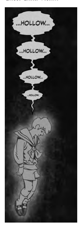
Ghost Child Victim

Coraline is a story about a bored young girl, who does not get sufficient attention from her parents and escapes into an otherworld, which is the lair of the story's villain, the "Other Mother". The child ghosts that are locked away in this otherworld are former victims of this demon, also called the beldam, who have been sucked dry of their love. They are described and illustrated as translucent, "pale figures, [...] nothing more than afterimages, like the glow left by a bright light in your eyes, after the lights go out" (101). All that is left to them is the feeling of emptiness: "'Hollow,' whispered the third voice. 'Hollow, hollow, hollow, hollow, hollow, 'ibid.). The child ghosts are represented as Victorian children, playing on the image of the angelic child and its pitiful death. This is exactly the reaction which they invoke in Coraline (and the reader). First they warn Coraline of her fate, if she succumbs to the seduction of the beldam: