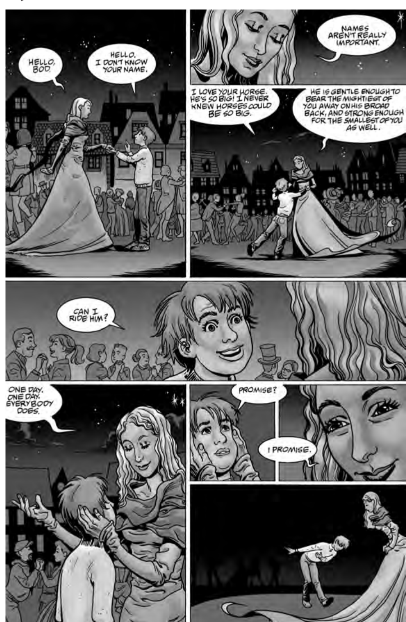
Half Ghost. Bod Dances with Death