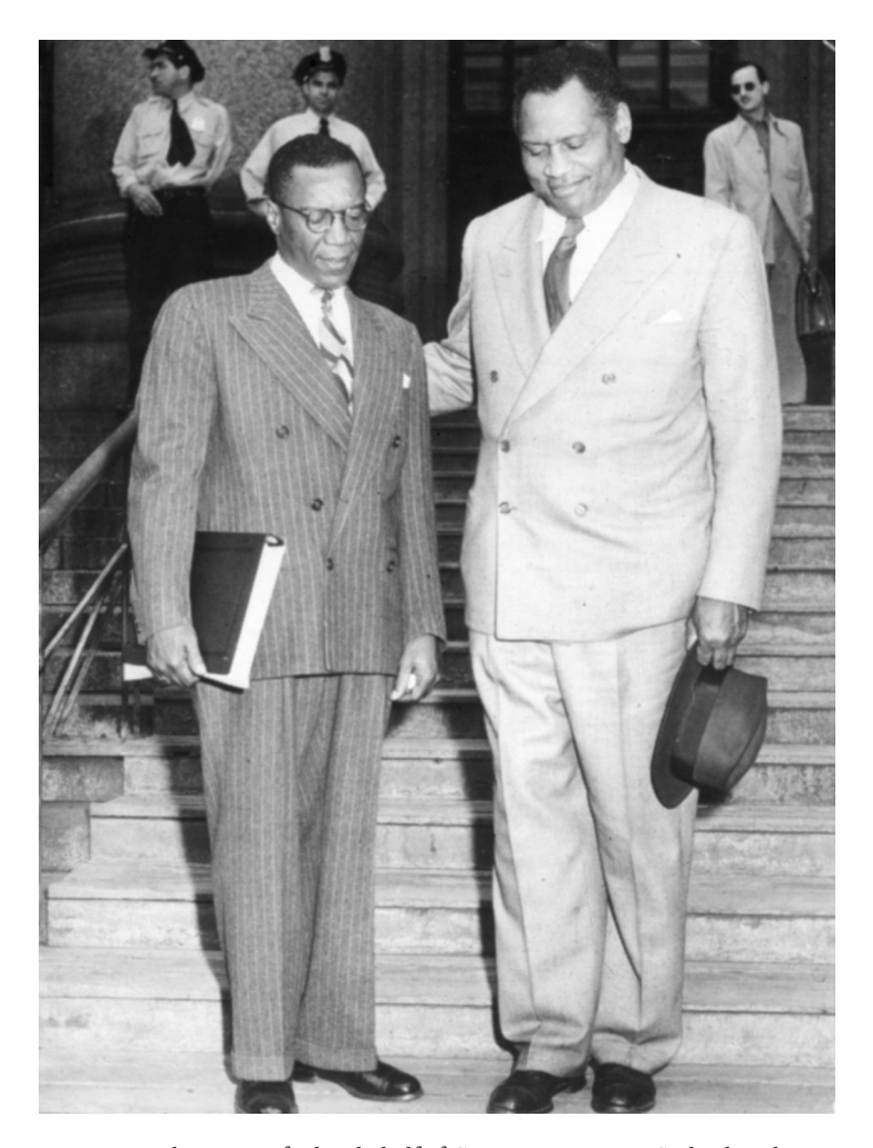
Figure 6 Robeson testified on behalf of Communist Party-USA leaders during their pivotal 1949 trial in Manhattan. A chief attorney for the defendants was George Crockett, who was jailed because of his vigorous advocacy; however, this militant defense did not prevent Crockett from being elected to the U.S. Congress from Detroit subsequently, exemplifying the point that anticommunism was not as potent among African-Americans, the constituency that voted him into office and also buoyed Robeson.