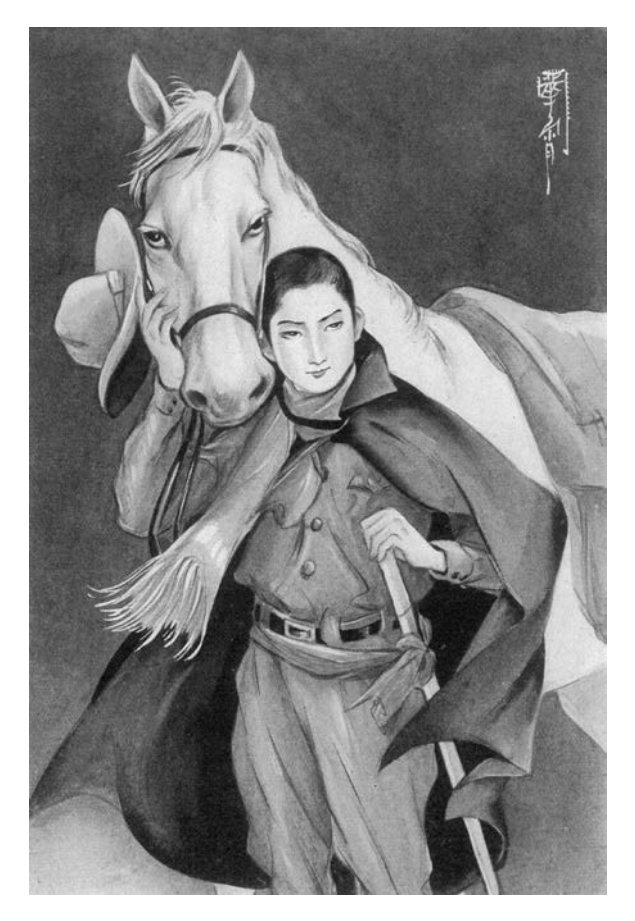
FIGURE 8.2. Takabatake Kashō, Song of the Bandits ( Bazoku no uta , 1929).

Kashō individuates and separates such subjects even beyond their sexual difference. An instance of Kashō's technique of directing the gaze in order to isolate the subject would be in Atelier ( Atorie , 1926),<sup>38</sup> in which