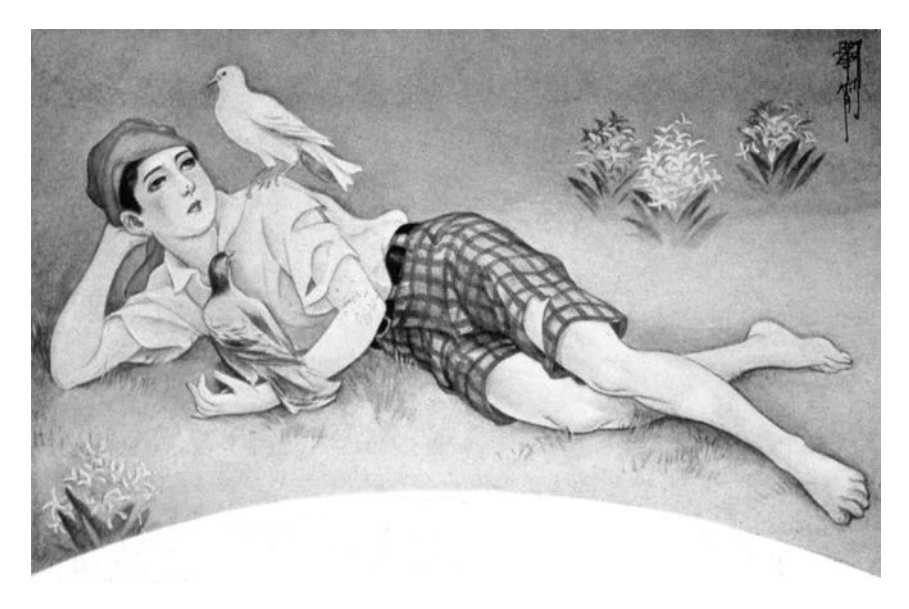
FIGURE 8.3. Takabatake Kashō, untitled image used as cover of stationery set, 1930.

of the picture. The subject's double-sexed sensuality paired with the torn clothing disrupts the pastoral setting, leaving a highly charged impression of sexuality.