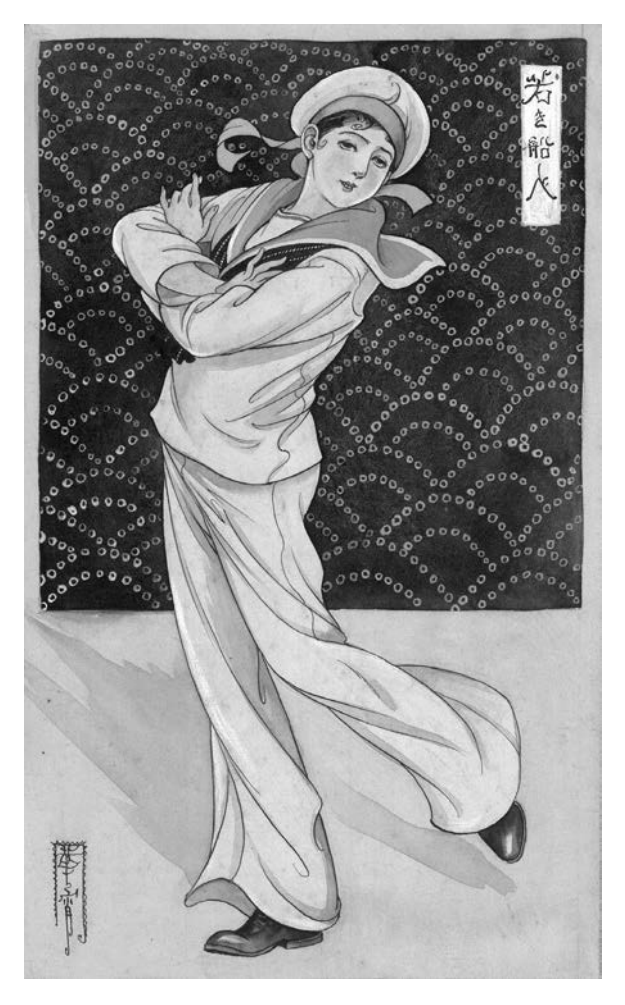
FIGURE 8.1 Takabatake Kashō, Young Sailor (Wakaki funabito, 1926).

similarly in Sea's Illusion . In addition, the sailor maneuvers his shoulder to dip and arch his back, while the mermaid raises her shoulder and twists her torso. The sailor has the same face as the mermaid but is playful and flirtatious. The mermaid is overtly sexual and alluring. The sailor could easily be female; the mermaid seems quite human. The dynamism of these in-between bodies speaks to possibility born of the subversion of categorical absolutes that bind the subject to prescribed bodies, behaviors, and desires.