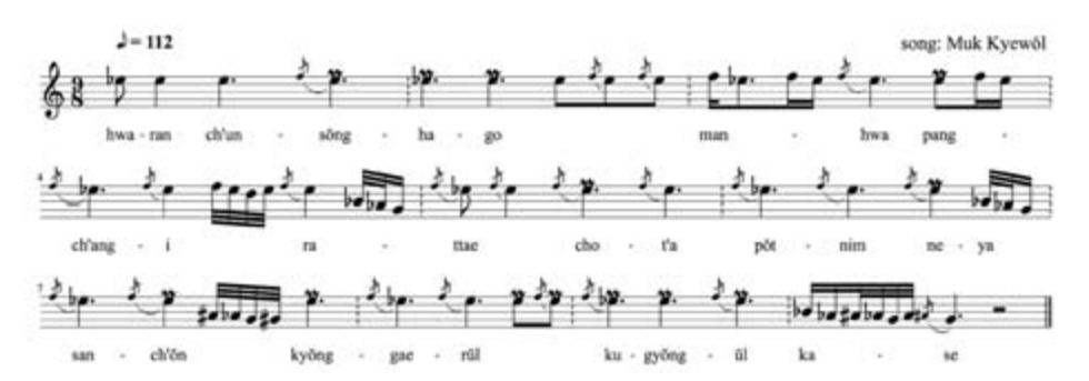
Hwaran ch'unsŏng-hago manhwa pangch'ang-ira ttae chot'a pŏt[/n]nim ne-ya sanch'ŏn kyŏnggae-rŭl kugyŏng-ŭl kase (With flowers blossoming vibrantly and all things growing lushly, this is the perfect time. My dear, let's go enjoy the sight of the mountains and streams).

As with other folksongs, the ideal vocal timbre is a husky one. Yi Ŭnju, holder of Kyŏnggi minyo , told me, "The way to get a hoarse sound is not simply to compress your voice [mog-ŭl tchalpke hada], but to pull your voice up [mog-ŭl ppopta], so it's extremely difficult."<sup>149</sup> Below I provide a transcription of the first phrase of "Yusan'ga" by Muk Kyewŏl from 1997 that shows the fast vibratos and long, sustained notes:<sup>150</sup>