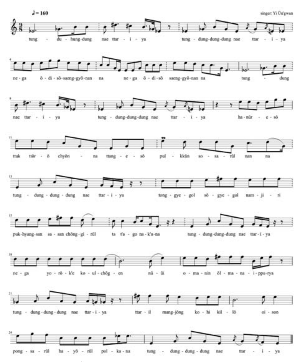
Transcription of Yi Un'gwan's 1993 recording of Paebaengi kut.

The transcription of the earlier recording shows that despite the faster tempo, Yi sang with a greater number of acciaccatura and a more defined vibrato while alternating between chest and falsetto registers more noticeably. The difference in finesse and ornamentation are presumably caused by the difference in Yi's age, while the difference in speed may be the result of the different playback