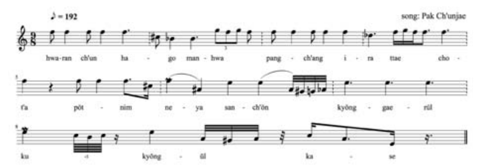
The first phrase of "Yusan'ga" on Pak Ch'unjae's 1911 recording has virtually identical lyrics, but much less ornamentation.

overall. The much higher pace may account for the fairly basic tonal ornamentation and lack of grace notes. <sup>152</sup> Another difference is that in Pak's version the main pitch drops half a tone from F to E in the last few measures (see below). The greater speed is likely to have been caused by the very limited recording time. SP recordings generally provided no more than three-and-a-half minutes of playing time per side. What is more, the recording technology did not allow small nuances nor great dynamic shifts, which left most recordings from this time sounding flat by today's standards: <sup>153</sup>