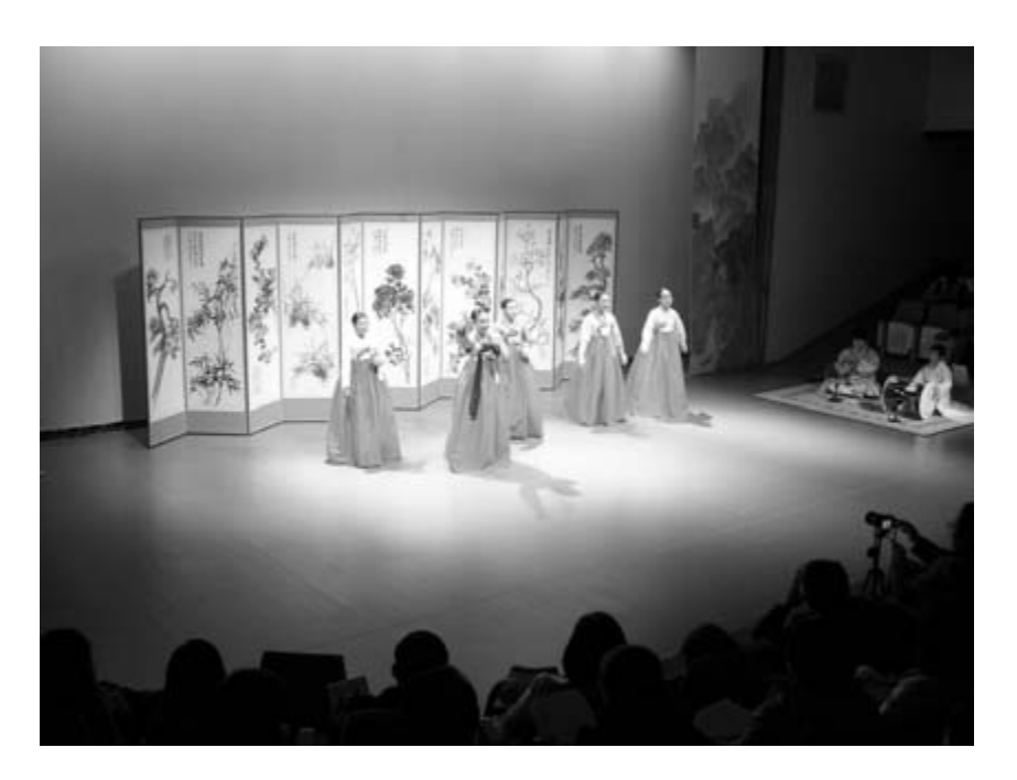
Pak Chunyŏng's students perform at the Seoul Training Center for Important Intangible Cultural Properties on November 21, 2008.

The government supports previously staged performing arts by designating them as cultural properties based on their likelihood of becoming extinct, the personal artistic skill of the performers, and the degree to which the properties represent a tradition it considers important. The reports on the designation of Paebaengi kut stress the urgency of the first point in particular. Although they acknowledge that the tradition has gone through a number of changes in the recent past, they emphasize that Yi Ŭn'gwan's art is unique and in need of trained successors. By publicly recognizing Yi as the sole holder of Paebaengi kut , the piece attracted and nurtured new talent. This, in itself, justified Yi's suitability as holder.