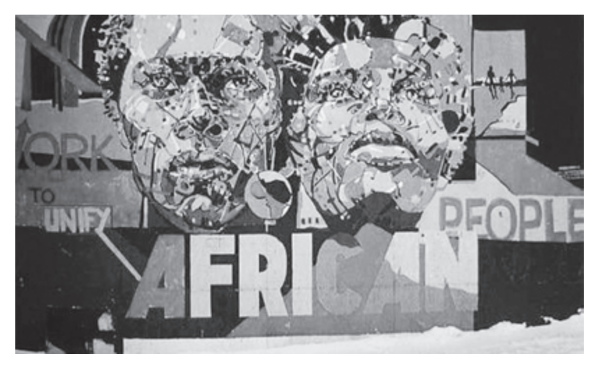
Fig. 1. "Work to Unify African People." Nelson Stevens.

piction of "mimesis at mid-point" is a stunning coloring of the black and white "stained glass" in Lama's drawing. Lama shows the woman's profile that is a realistic sign tilted as if it is in the process of entering the outer space of the abstract (that which the AfriCobra manifestos describe as "superreal").