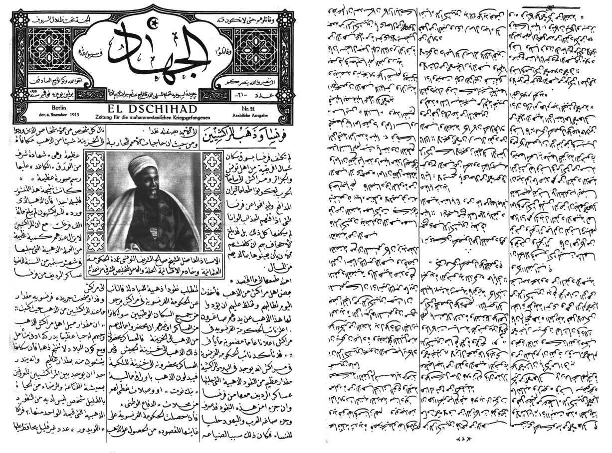
Fig. 5.1 El Dschihad or Al Ğihād, newspaper published in Arabic and other languages by the Nachrichtenstelle für den Orient for Muslim prisoners-of-war who had served in the armies of the Entente powers. First number appeared in Arabic on March 1, 1915, thereafter fortnightly, then irregularly until 1918. Reproduced in Gerhard Höpp, Arabische und Islamische Periodika in Berlin und Brandenburg 1915–1945 (Berlin: Das Arabische Buch [Forschungsschwerpunkt Mittlerer Orient], 1994), p. 61.