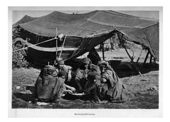
Fig. 2.1 "Bedouin Women." Photograph from Oppenheim's Vom Mittelmeer zum Persischen Golf (1899). Dr. Max Freiherr von Oppenheim, Vom Mittelmeer zum Persischen Golf durch den Haurān, die Syrische Wüste und Mesopotamien (Berlin: Dietrich Reimer, 1899), vol. 2, facing p. 124.