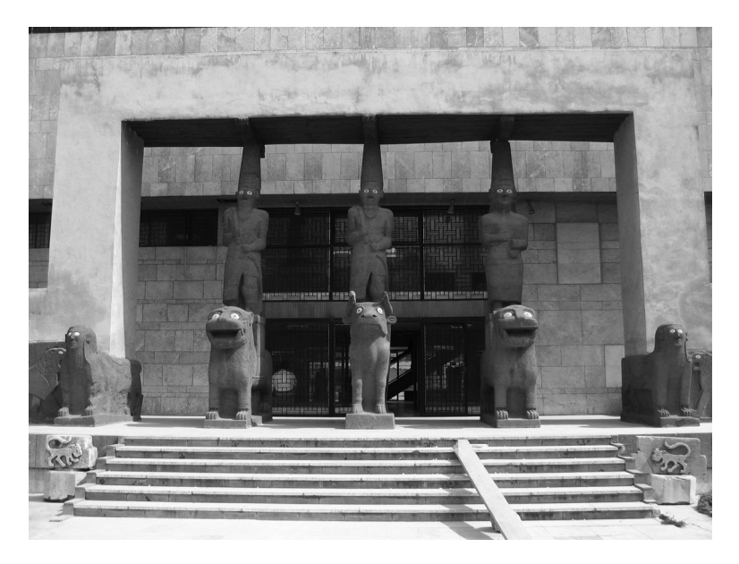
Fig. 8.1 Façade of Aleppo National Museum, showing plaster casts of statuary shipped to Berlin by Max von Oppenheim.

For these latter items, the Near Eastern section of the State Museums no longer being an option, he accepted an offer by the Technical University of Berlin to place at his disposal, at no cost to him, a disused machine factory in the Charlottenburg district of the city. Despite inflation and economic depression, which ate into his fortune, Oppenheim succeeded in turning the old factory into a makeshift museum, the central feature of which was a reconstruction, from both original parts and plaster casts, of the grand entrance to the Temple Palace with its monumental statues. The opening ceremony took place on Oppenheim's 70th birthday, 15 July 1930, in the presence of the original excavation team and a large number of scholars. A couple of weeks later it was opened to the general public from 10 am until 3 pm daily and from 10 am until 2 pm on Sundays, with no admission charge.