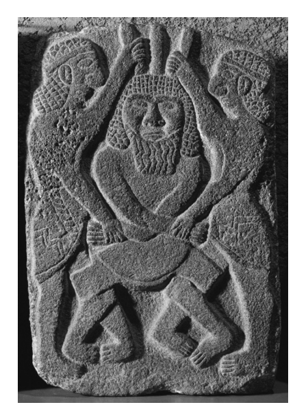
Fig. 8.5 Tell Halaf. Orthostat. "Two heroes pinning down a bearded foe." The Walters Art Museum, Baltimore. Accession no. 21.18.