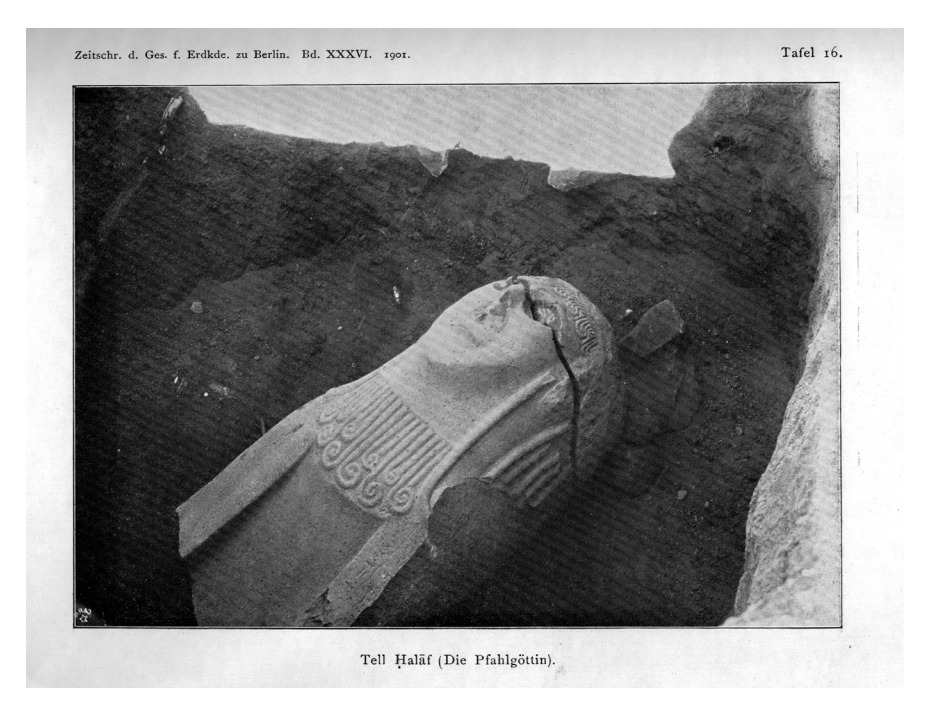
Fig. 7.1 Tell Halaf. "The Pole Goddess," excavated in 1899. Dr. Max Freiherr von Oppenheim, "Bericht über eine im Jahr 1899 ausgeführte Forschungsreise in der asiatischen Türkei," Zeitschrift der Gesellschaft für Erdkunde zu Berlin, 36, 2 (1901): 69–99, plate 16.

A photographic illustration in the article showed how "the bust, more than three times life-size, atop a cubic base, formed a whole hewn out of a single block of stone." It "thus appeared to provide a uniquely simple solution to a problem still facing many artists today":