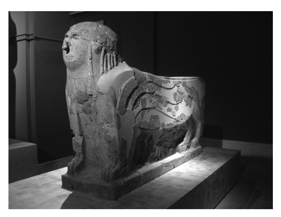
Fig. 7.3 Tell Halaf. "Sphinx". Berlin, Pergamon Museum.

It was one of the great events of my excavations and one of my greatest joys as a discoverer, to see this statue literally rising out of the ground. After the greatly denuded mass of mud bricks had been laid bare [...], its surface was cleared. In doing this we first of all came upon the top of the head. It looked like a great dark iron pan, but soon the outlines of the head showed themselves. Now one layer of mud bricks after the other was carefully lifted away. [...] The work had to be carried on most carefully, so that the pickaxes should not do any hurt to the statue. It was hours and, indeed, days before the great throned goddess at last stood before us in all her greatness. What was our joy when we found that the statue was wholly unhurt! Our Beduin workmen came to call this goddess my bride, because I kept on going to her and could not be out of sight of her. [...]