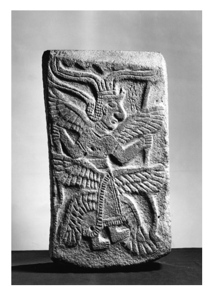
Fig. 8.6 Tell Halaf. Orthostat. "Winged goddess." The Walters Art Museum, Baltimore. Accession no. 21.16.