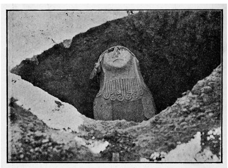
Abb. 12: Schürfloch D. Stein 14 (Die verschleierte Göttin).

was the most remarkable of our finds. It was the torso of a human figure. The moment I saw it, I had the impression that the artist's aim had been to represent a veiled woman, a goddess. The head emerged directly from a stone block that was barely broader than the neck. There were no shoulders or arms. From the area of the breast down, the stone had been