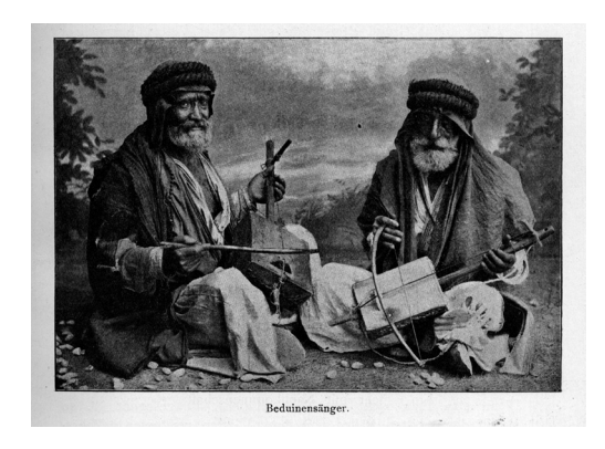
Fig. 2.2 "Bedouin Minstrels." Photograph from Oppenheim's Vom Mittelmeer zum Persischen Golf. Ibid., vol. 2, p. 127.