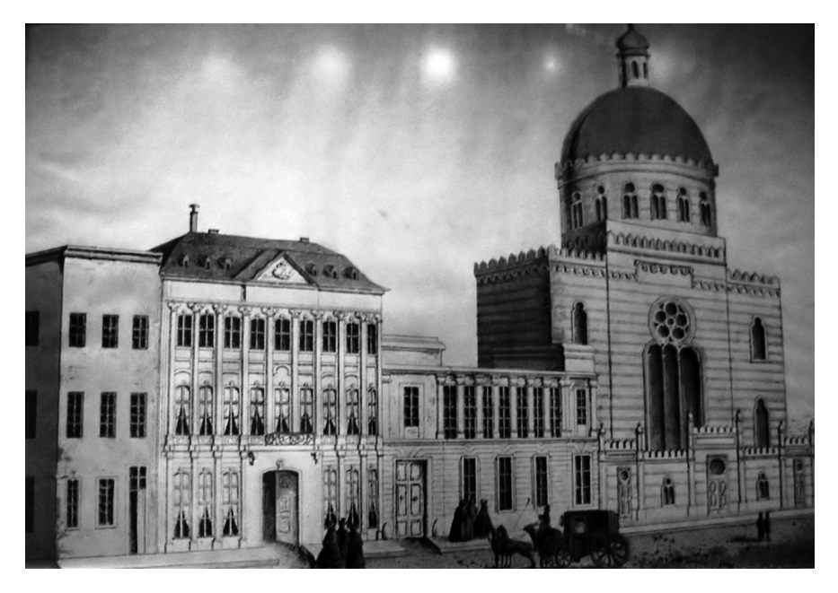
Fig. 1.2 Synagogue in the Glockengasse, funded by the Oppenheim family, 1861. Lithograph by J. Hoegg from a water colour by Carl Emanuel Conrad (1810–1873). Wikimedia Commons (original in colour).

Abraham submitted "a humble petition" for a more complete emancipation of the Jews to the King of Prussia. Their youngest brother David (1809–1889), a liberal who in 1842 launched the Rheinische Zeitung and brought Karl Marx in to edit it, also embraced the cause of Jewish emancipation and continued to support it even after he himself had converted to Catholicism in 1839 and taken the name Dagobert. In the mid-1850s Abraham donated 600,000 thalers (over a million and a half dollars in today's money by some estimates) for the building of a new synagogue in Cologne, the land for which had been purchased by his father in the 1820s, while in his will (1880) Simon made provision for a home for old, infirm or indigent Jews.