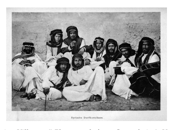
Fig. 2.3 "Syrian Villagers." Photograph from Oppenheim's Vom Mittelmeer zum Persischen Golf. Ibid., vol. 1, facing p. 254.