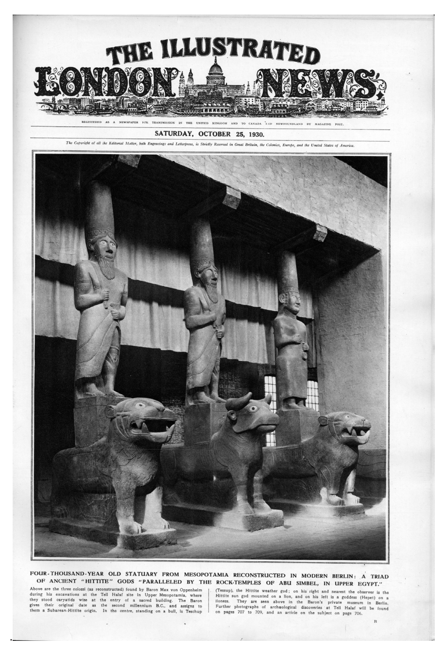
Fig. 8.2 Illustrated London News, October 25, 1930, front page, showing caryatids from Tell Halaf in newly opened Tell Halaf Museum.

The striking front cover of this issue was entirely taken up by the towering caryatids forming the entrance to the so-called Temple Palace